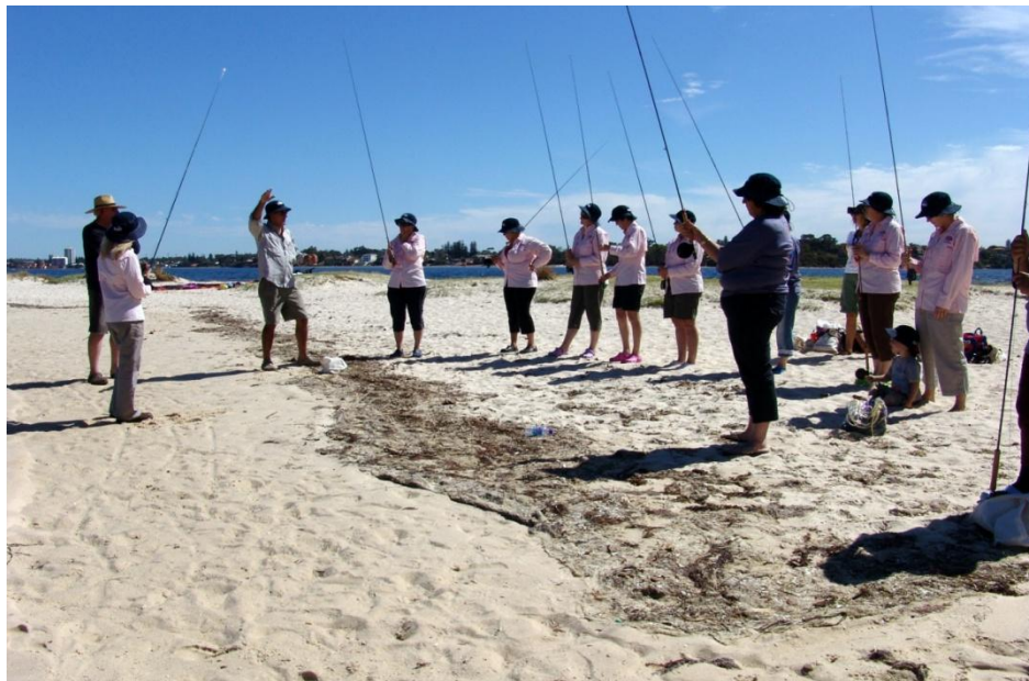
Figure 8: Pink Fly Fishers on the Swan River.

RecfishWest noted during the running of the program, participants had the opportunity to interact socially before, during and after fishing.