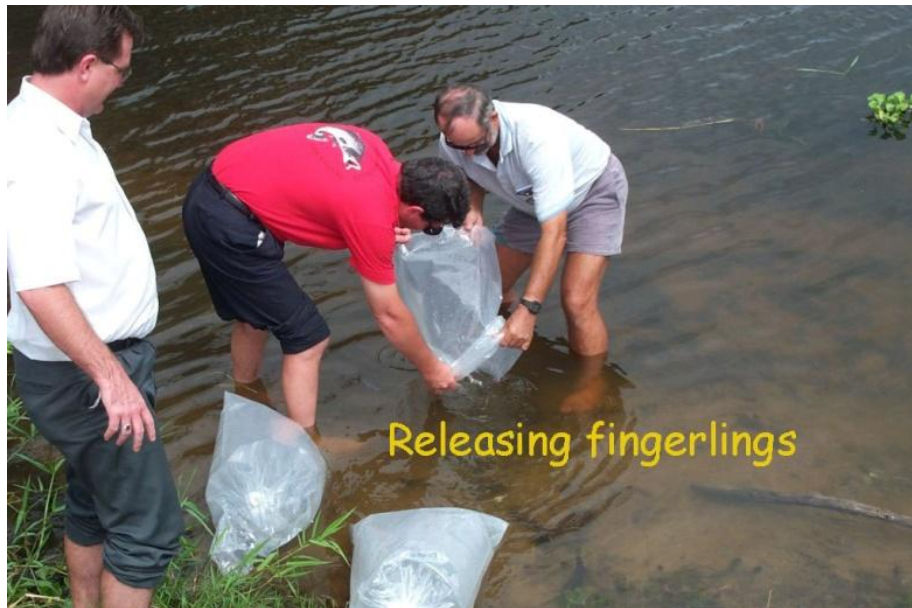
Figure 6: Townsville Restocking Society.

Fishcare Victoria runs regular events that educate people on sustainability, compliance with regulations and also support selected community groups such as the disabled and seniors. A one-day fishing trip exclusively for women is currently being planned. Most recreational fishing clinics and events rely heavily of the support of volunteers and as such play an important role in building community awareness.