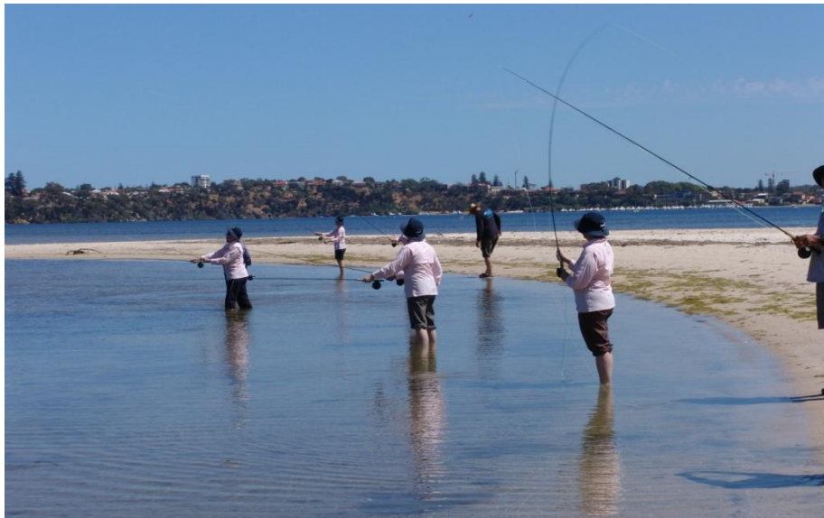
Figure 7: Pink Fly Fishers on the Swan River.