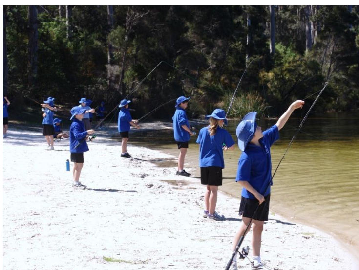
Figure 2: Hey Kids Let's Go Fishing.