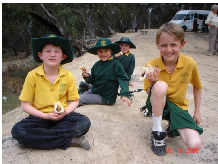
Figure 4: Fishing 4 Friends.

With two teachers ready to operate the program and several staff supporting them, the program was put into place. 10 boys identified with welfare needs were chosen to participate. Another 10 boys identified as excellent role models were chosen as their fishing friends. The students had to show significant improvements in their classroom and playground behaviours to attend each fishing trip. Their progress is tracked via the schools RISC data collection software as well as display charts and regular meetings. The 'friends' also help keep the boys on track with their encouragement and support.