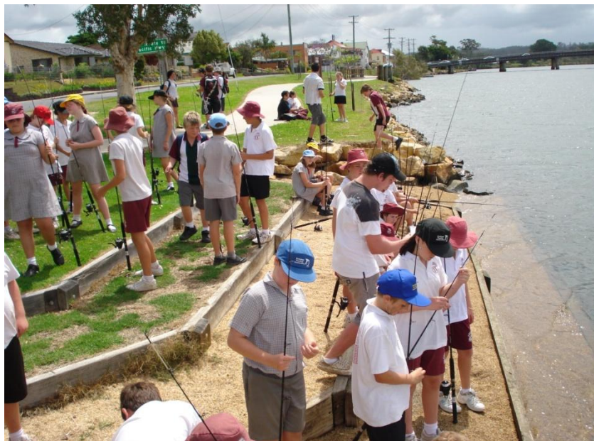
Figure 3: Hey Kids Let's Go Fishing.

Results of a school summary survey conducted on the Hey Kids Let's Go Fishing Program were generously provided by Doug Joyner, Australian Fishing Trade Association (AFTA). The survey yielded 118 responses from 40 high schools, 72 primary schools, one K-12 school and 5 other organisations. All responses agreed that the program was rewarding and enjoyable and 100% of those that completed the program agreed it made children aware of responsible fishing practices. The feedback received was overwhelmingly positive (see Figures 2 and 3).