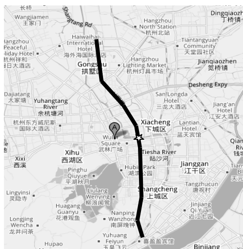
Fig. 1 Map of the City Centre. The solid black line represents Zhong He Viaduct. ☆ Sampling venue

The ambient air monitoring survey was conducted on Zhong He Viaduct at the city centre (see Figure 1) in February 2009. Zhong He Viaduct is a two-way vehicle-only viaduct, with two lanes in each direction. The length of the viaduct is about 20km from north to south with 10 exits on each side. The sampling venue was near Huan Cheng North Road in the middle of the viaduct and one meter away from the edge of the road and outside a sentry box (the star in Fig. 1).