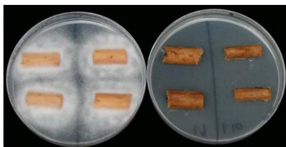
Figure 4. Recovery of P. cinnamomi from pine plugs either not incubated in LaBC® (LHS), or incubated in LaBC® for 6 days (RHS).