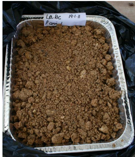
Figure 3. Inoculated LaBC ® ready for incubation.