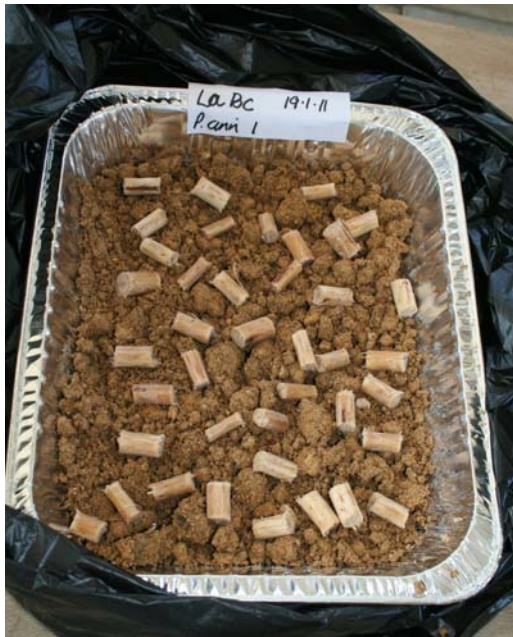
Figure 2. Inoculum spread over the surface of LaBC ® .

A similar protocol was used for LaBC ® + compost. The control treatment was colonised pine plugs that had not been exposed to either LaBC ® or LaBC ® + compost.