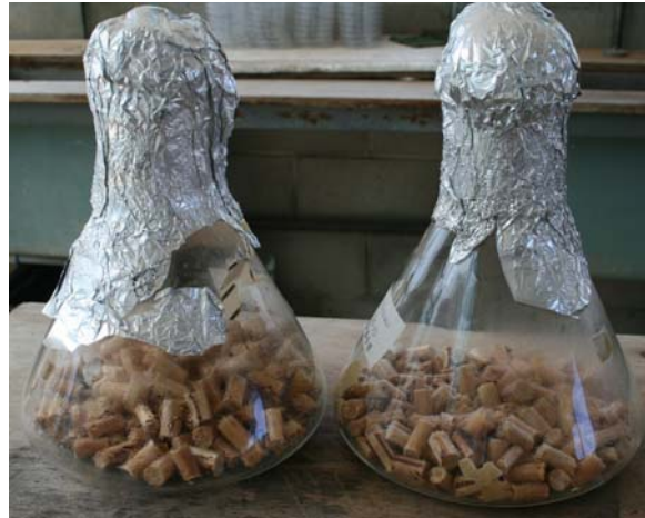
Figure 1. Pine plug inoculum

After 10 weeks two pine plugs were removed from each flask to check colonisation. Each plug was surface sterilised in 70 % ethanol for 30 sec., rinsed twice in sterile de-ionised water, dried, split in half using sterile secateurs, and then plated onto agar selective for Phytophthora (17 g corn meal agar, 100 mg ampicillin, 50 g hymexazol, 100 mg PCNB, 1 ml nystatin, 0.5 ml rifadin /L). Within 2 days P. cinnamomi or P. multivora grew vigorously from the plated pine plugs, showing complete colonisation.