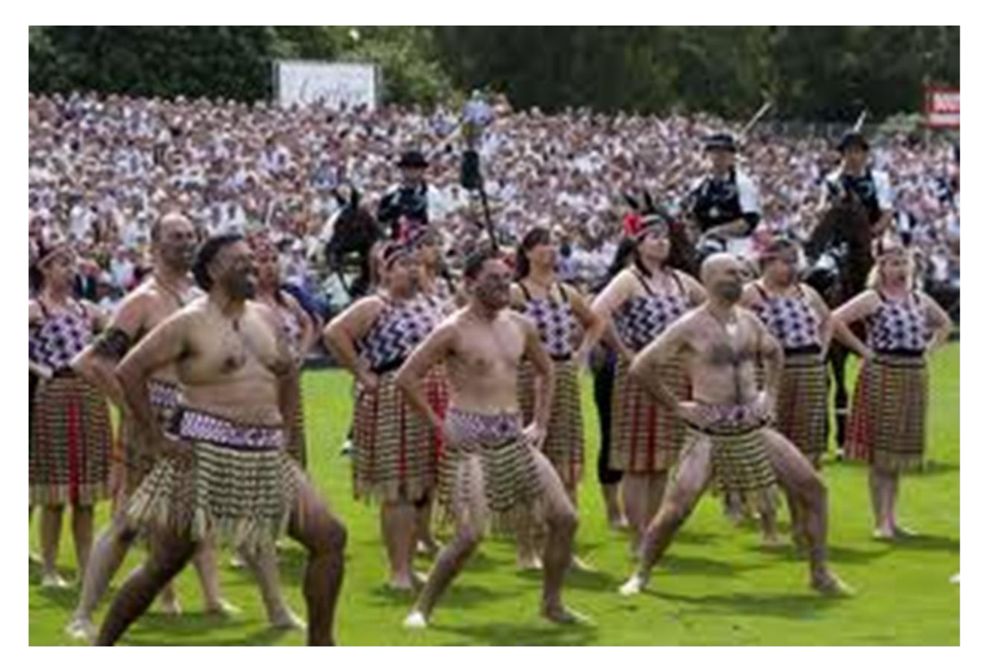
Figure 3 Maori Haka Performance at Sporting Event