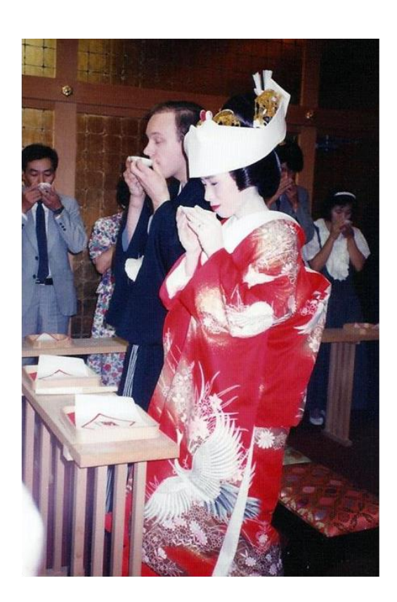
Figure 4 Achieving an Authentic Destination Experience by a "Native-Visitor"