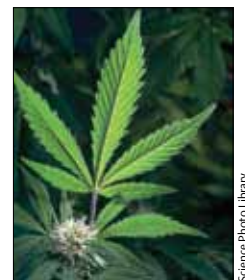
See Articles page 286

three studies from Australia and New Zealand, clearly shows a dose-response association between frequency of cannabis use in adolescence and ability to complete specific tasks that mark the transition to adulthood, specifically the ability to achieve high levels of education. After confounder control, individuals who were daily users before age 17 years had reductions in the odds of high-school completion (adjusted odds ratio [OR] 0.37, 95% CI 0.20–0.66) and degree attainment (0.38, 0.22–0.66) compared with those who had never used cannabis. Furthermore, cannabis use was associated with increased risk of suicide attempt (adjusted OR 6.83, 95% CI 2.04–22.90) and, unsurprisingly, later cannabis dependence (17.95, 9.44–34.12) and use of other illicit