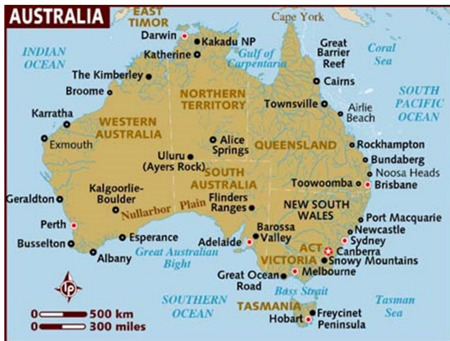
Figure 1: Map of Australia 27

Australia is the largest island in the world, covering an area of 7.69 million square kilometres (see Figure 1). To put this into context Australia's land mass is almost the same as that of the United States of America, about fifty per cent bigger than Europe, and thirty two times bigger than the United Kingdom. 28 Australia was invaded and colonised by the