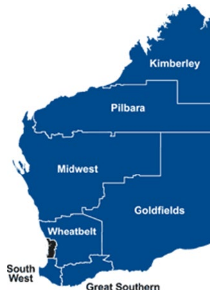
Figure 2: Regions of Western Australia with the Perth metropolitan area identified in black 32

Today, Australia's population is approximately twenty-three million, and of this number over eighty percent live within one hundred kilometres of the ocean. 30 Australia is divided into six states and two territories. Western Australia (WA) has the largest landmass of the states and territories with a population of 2.59 million people. Of this number three quarters of the population live in Perth, the capital and the surrounding metropolitan area. 31 Western Australia has a diverse landscape from forests in the south to the tropical north and desert areas of the east. Western Australia consists of eight regions (see Figure 2) the Kimberly, Pilbara, Goldfields, Midwest, Wheatbelt, Southwest, Great Southern and the Perth metropolitan area running 160kms from North to South.