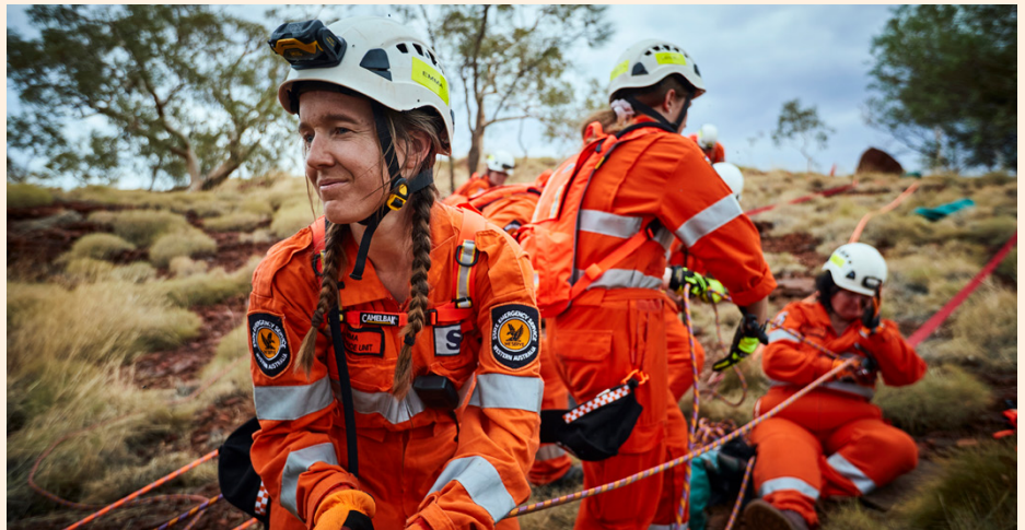
▲ ABOVE: THIS RESEARCH IS PROVIDING INSIGHTS AND DATA TO STATE EMERGENCY SERVICE'S AROUND AUSTRALIA TO HELP TO DEVELOP NEW RECRUITMENT AND RETENTION STRATEGIES.

Across Australia, turnover of State Emergency Service volunteers is high, particularly within their first year of volunteering. This turnover is higher than other volunteer emergency services. Little is known about why individuals volunteer with emergency services and what encourages and supports long-term engagement. This research is providing insights and data nationally to help to develop new recruitment and retention strategies for SES volunteers. With the research team being based in Western