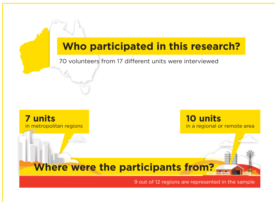
▲ Figure 1: WHO PARTICIPATED IN THE RESEARCH AND THEIR LOCATION.

Little is known about precisely why individuals volunteer with emergency services and what maintains their long-term engagement. This research explored DFES survey data among first year volunteers and identified three types of volunteers, based on their initial motivation to join the service and role expectations. The research found that having too few or too many expectations has a negative impact on volunteer experiences and turnover intentions (Kragt et al. , 2018).