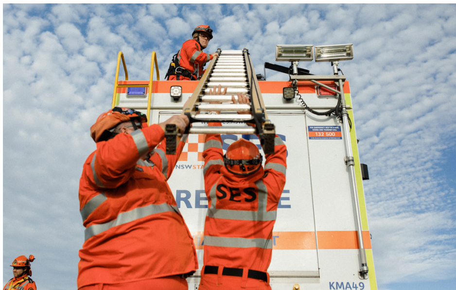
▲ Above: THIS RESEARCH IS EXPLORING HOW VOLUNTEERS MAKE SENSE OF THEIR VOLUNTEERING EXPERIENCE.