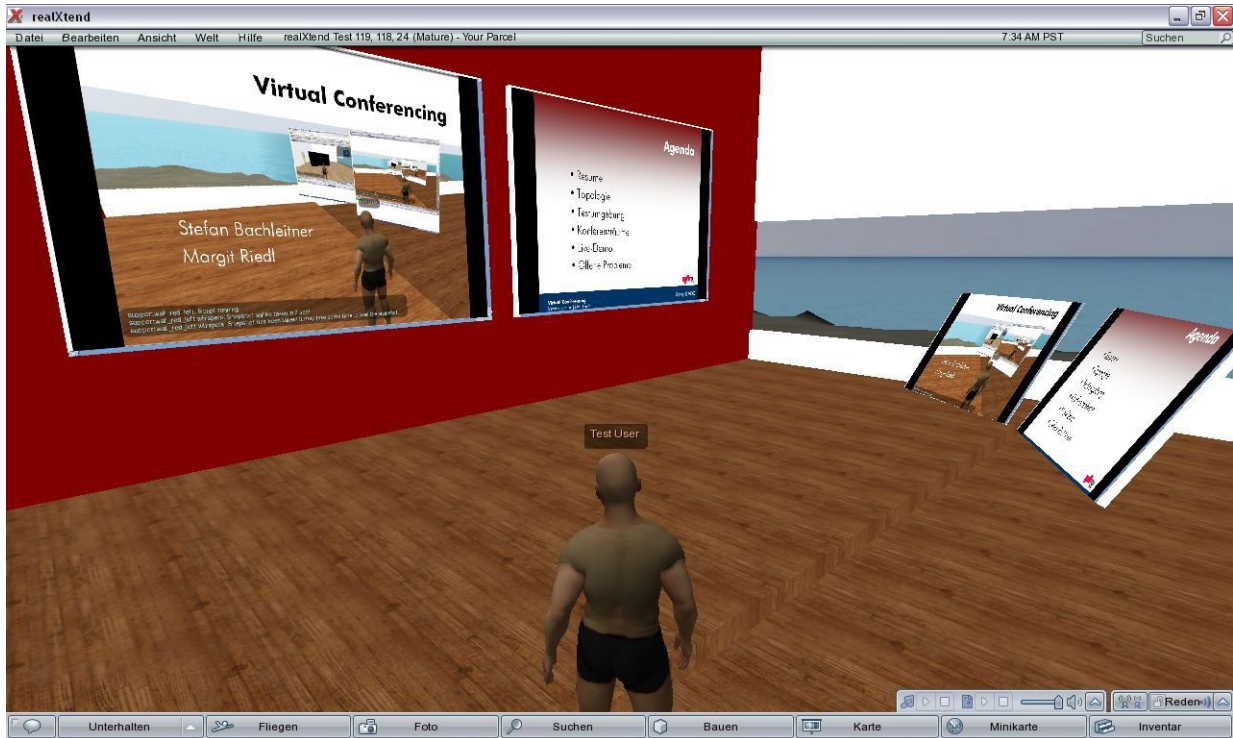
Figure 2: Red conference room with two main presentation screens and the two monitor screens

Before the presentation, presenters need to connect to the Presenter's Interface using a Web browser, and enter the IP address and password of their VNC server (see Figure 3).