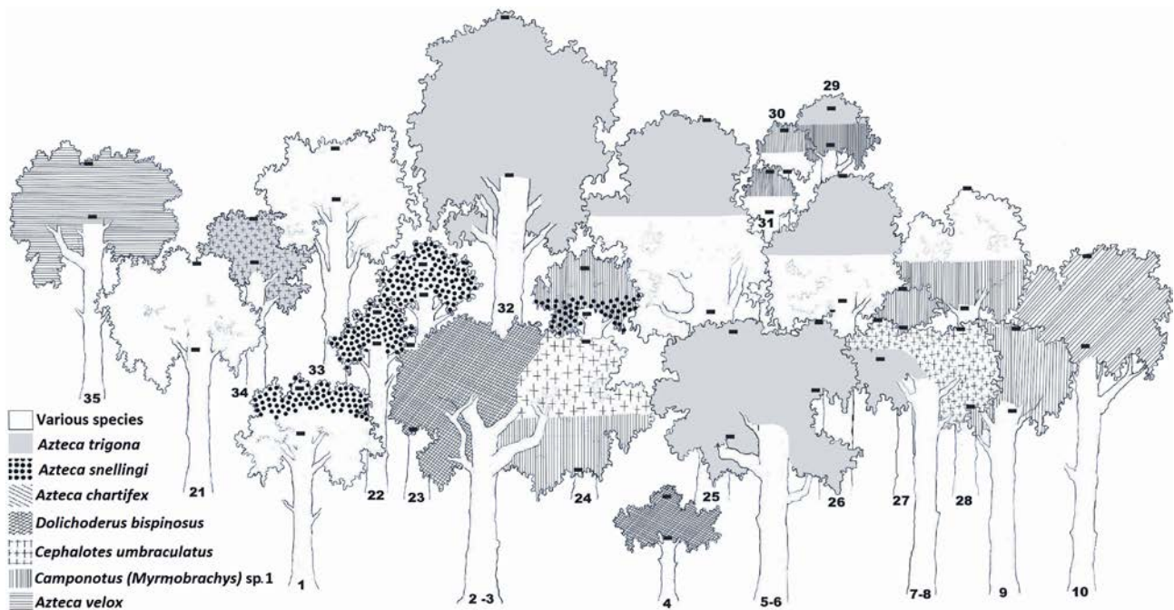
Fig. 1: Ant mosaic in the tree crown, showing sampling height within each crown.

JEAN & al. 2003) species. Other ants of low abundance and frequency were considered non-dominant. Some apparently sub-dominant species, being of high abundance but extremely localised, were found at the edge of our sampling grid and their territory may well be larger and extending outward from where we sampled, meaning that they are in fact dominants.