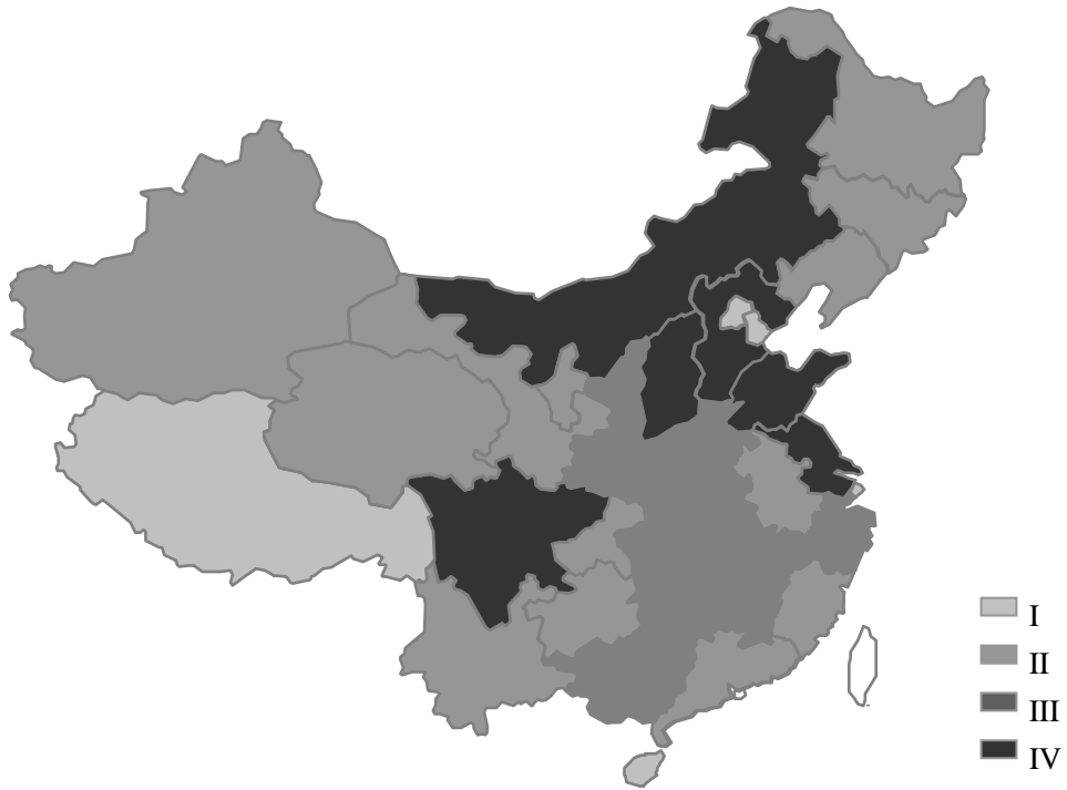
Figure 1 Cluster analysis results for Chinese state-monitored heavily air polluting enterprises

791 792 793 794 795 796 797 798 799 800 801 802 803 804 805 806 807 808 809 810 811 812 813