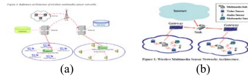
Fig. 2 Architecture of WMSN [8] and [1]

Elhadi et al [8] was described typical characteristics of WMSNs and introduced a reference architecture for WMSNs similar to [2]. It can be show in Fig. 2.a. Grieco et al [1] introduces an architecture of WMSN. It is composed of numerous multimedia sensors that exchange sensed data with sinks using a wireless channel. It can be seen in Fig.2.b.