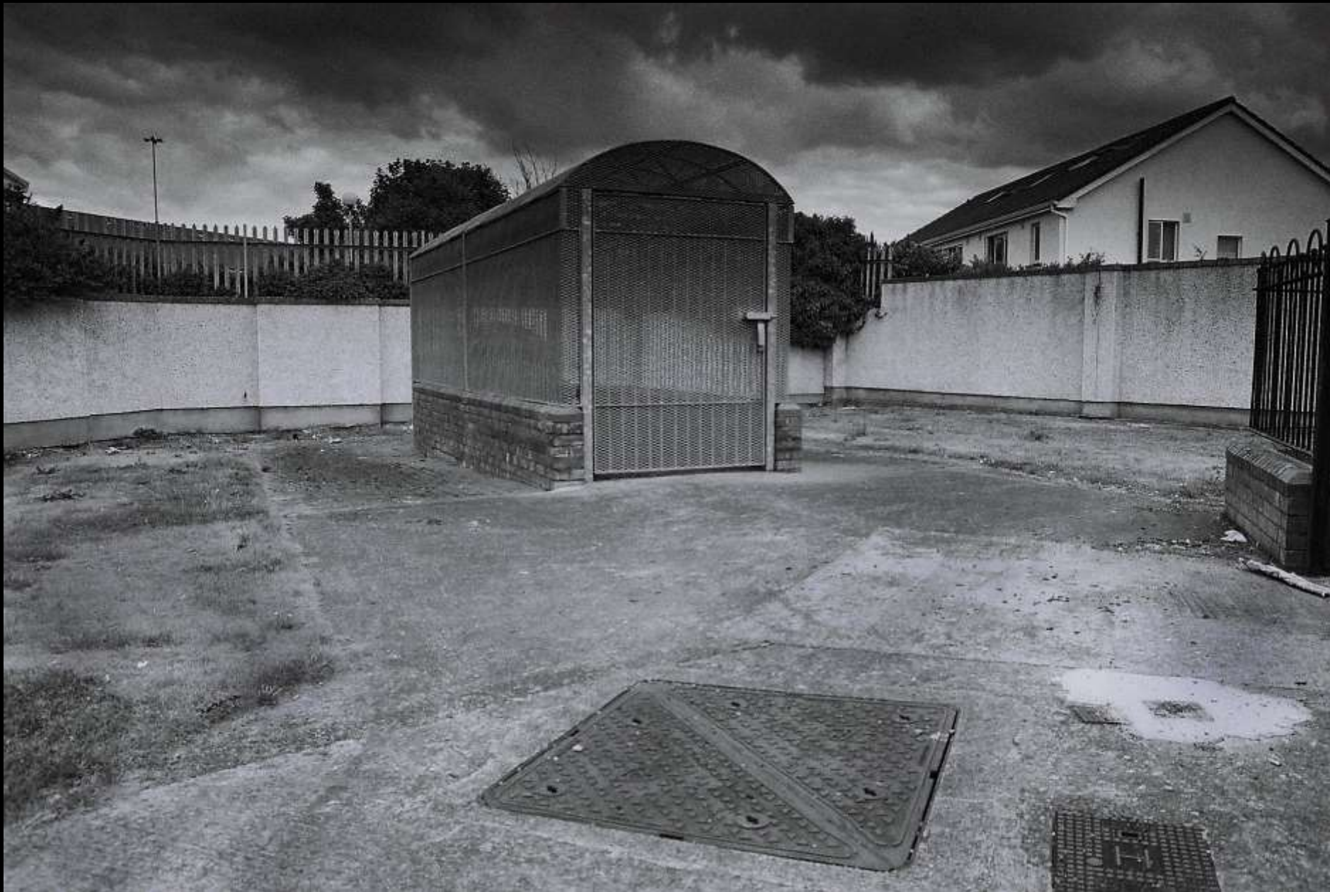
St. Patrick's Well, Finglas, County Dublin