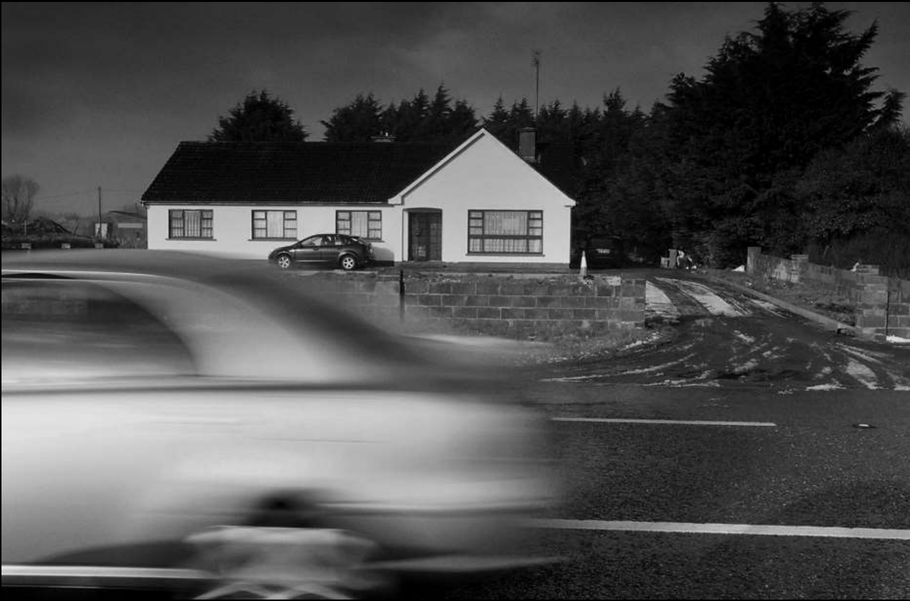
Meeltran burial site on the N17, Knock, County Mayo