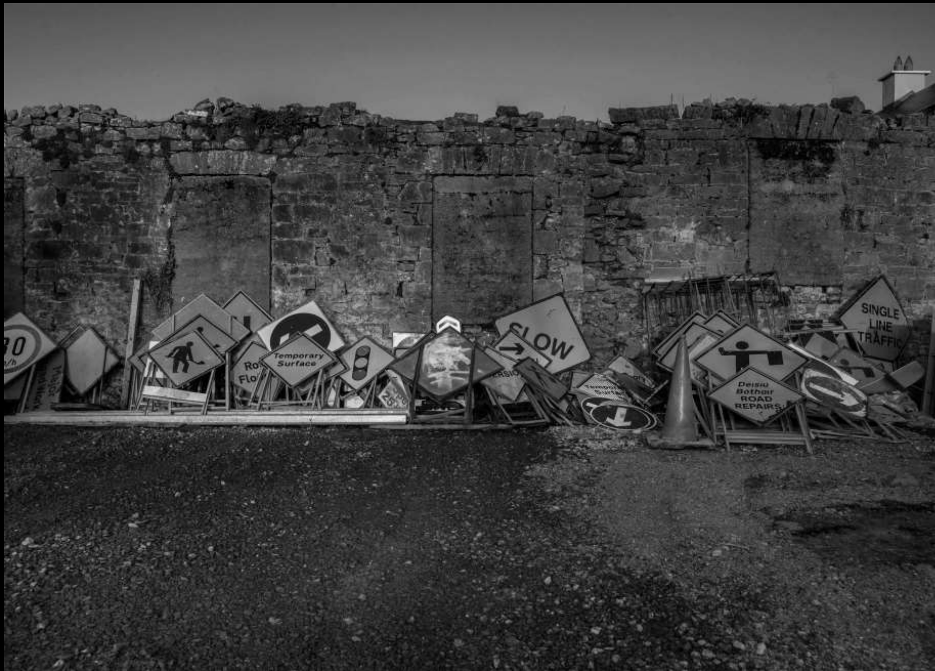
The Gort Workhouse, Gort, County Galway