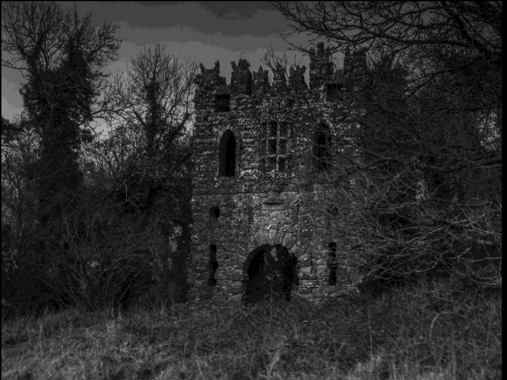
Gothic folly, Belvedere House, County Westmeath