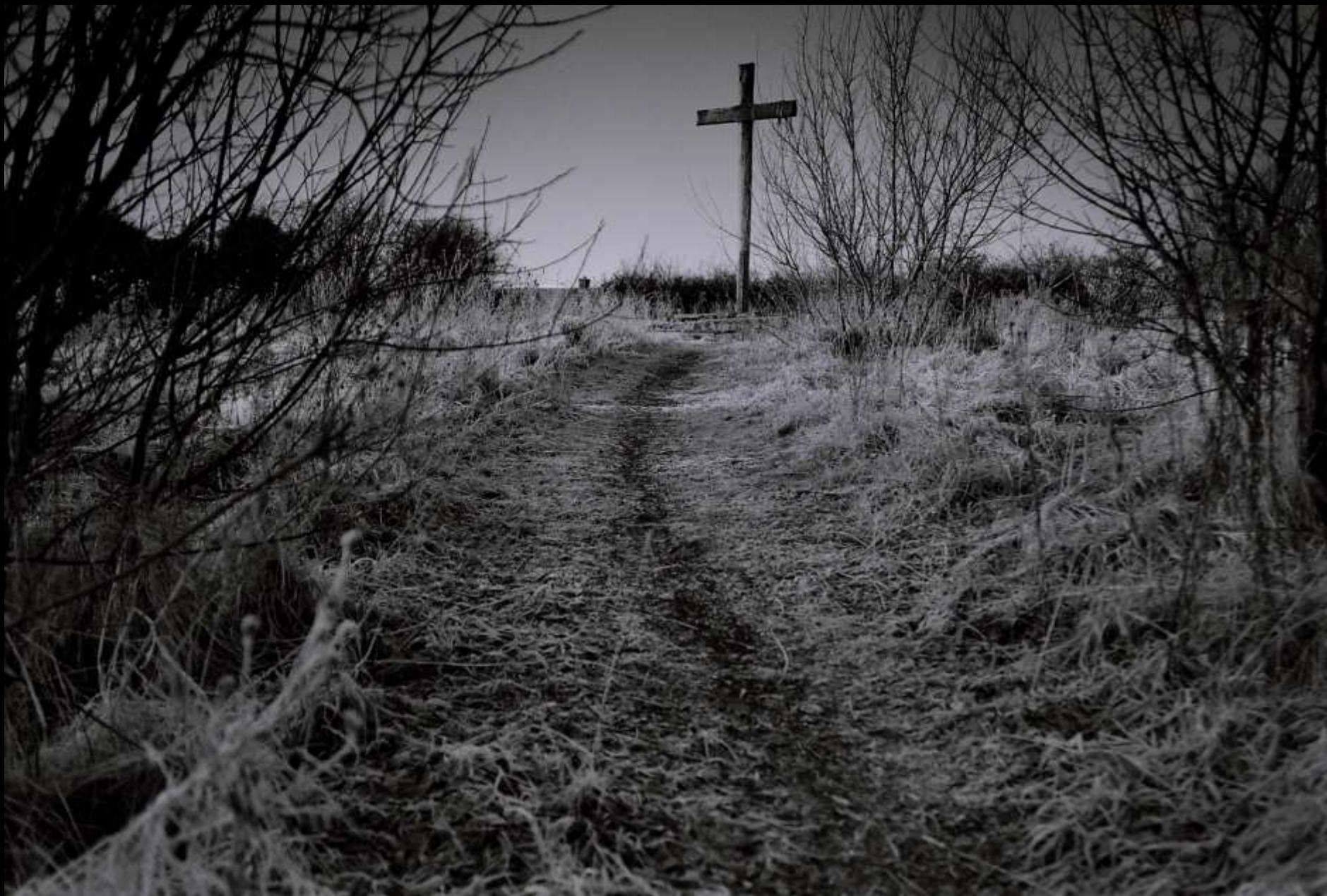
"The Yellow Hole", Cholera and Famine graveyard, Moyross, County Limerick