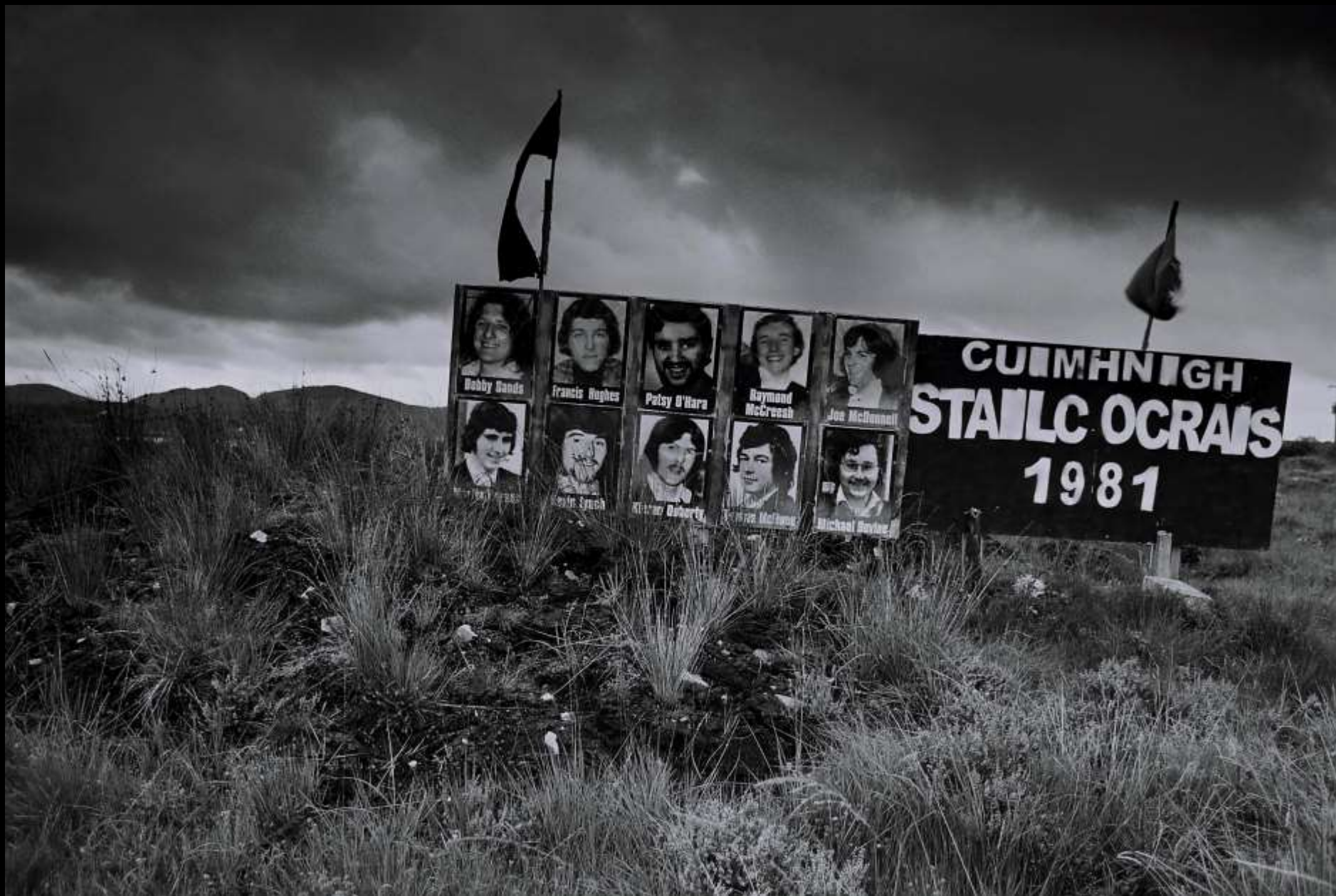
Roadside memorial commemorating the 1981 Hunger Strikes, County Donegal, 1