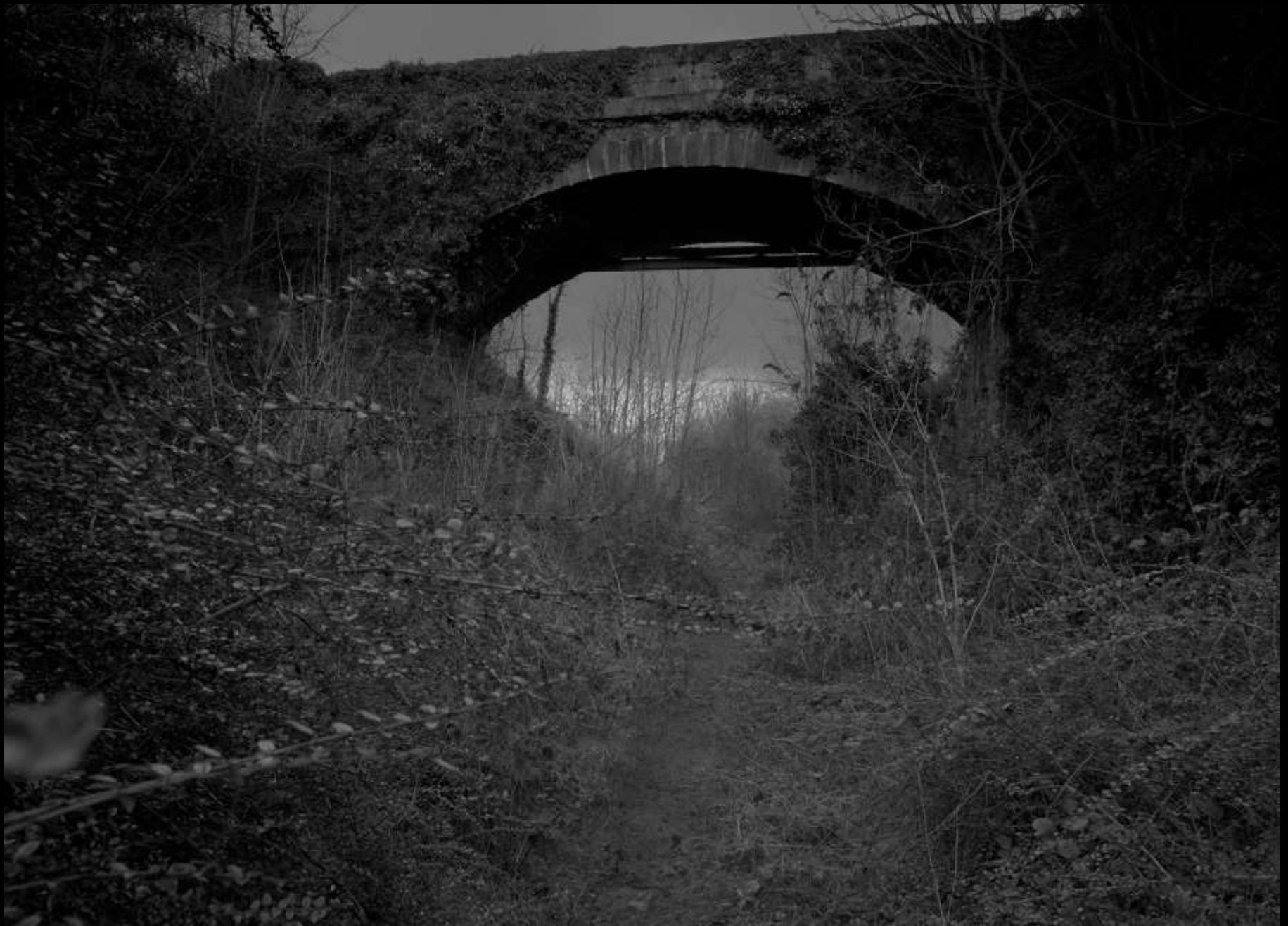
Abandoned Famine Relief Project, Cong, County Mayo, 1