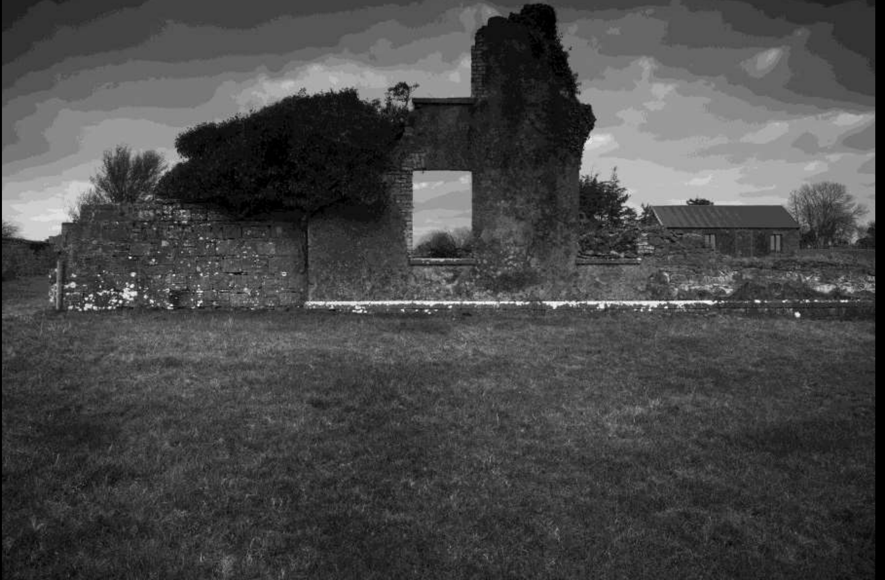
Glenamaddy Workhouse, Glenamaddy, County Galway