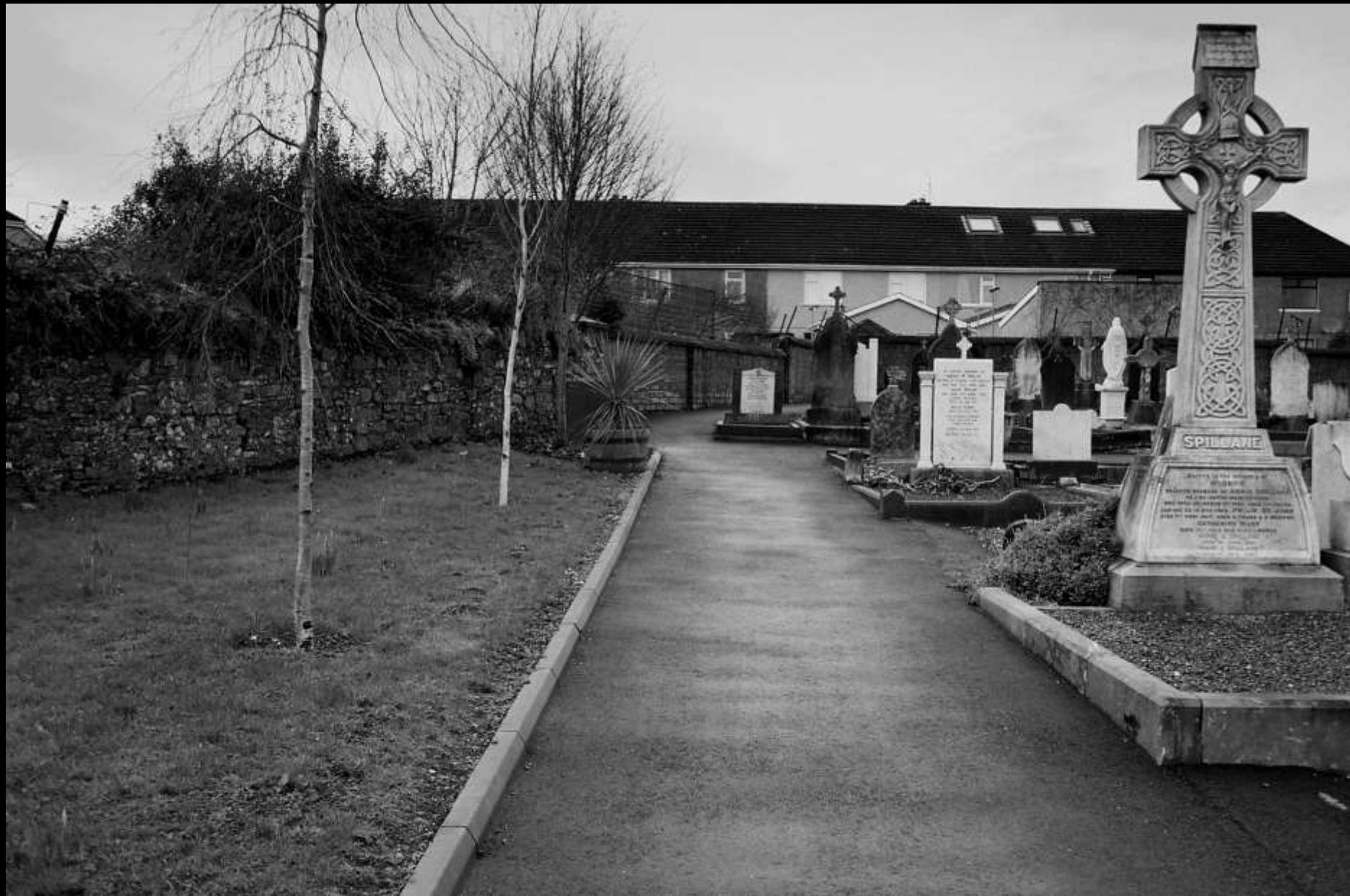
Unmarked Famine plot (left of picture), Saint Joseph's Cemetery, Ballyphehane, County Cork