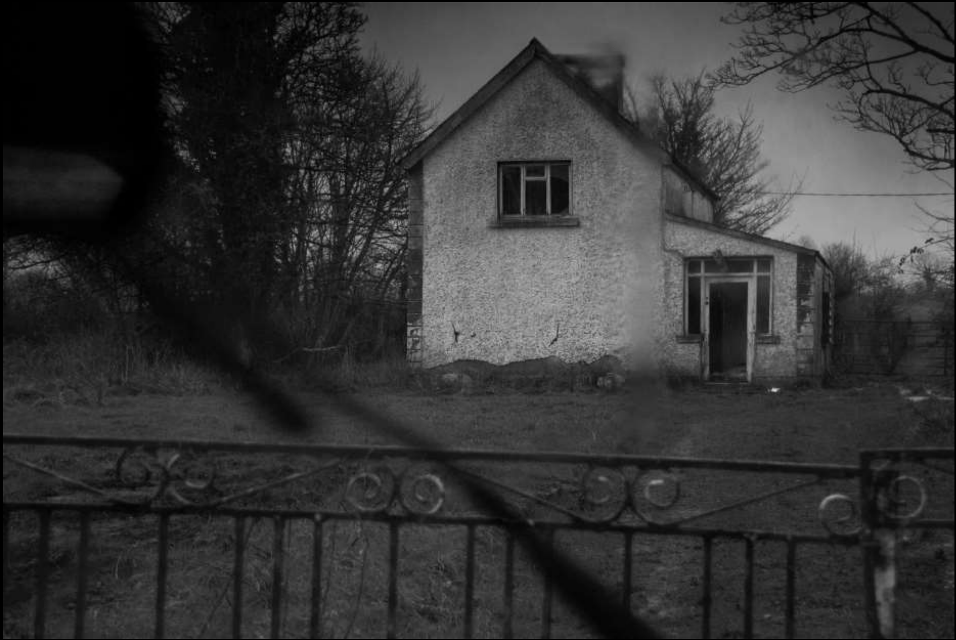
Famine eviction site, Ballinglass, County Galway, 1