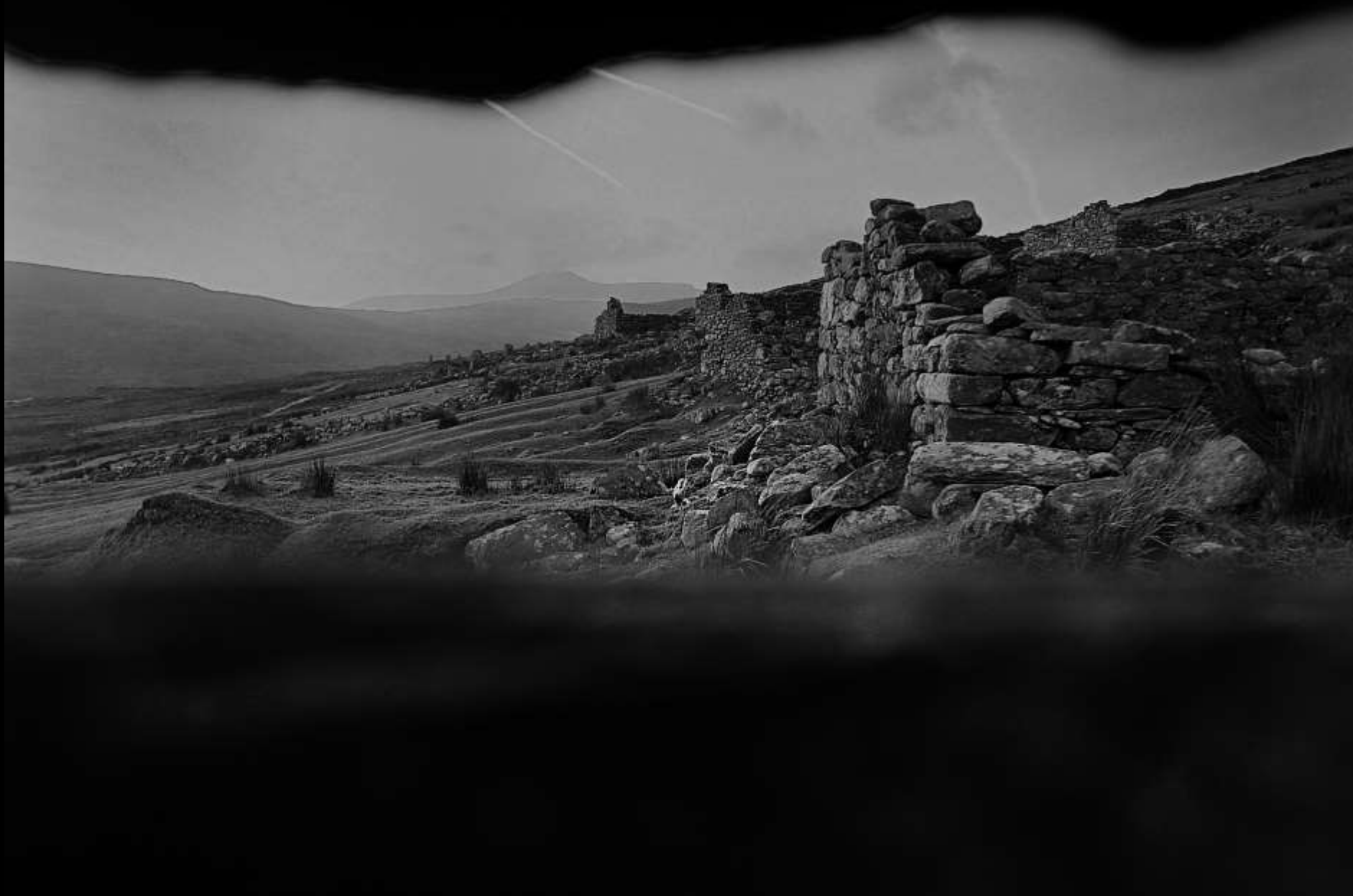
"The Deserted Village", Achill Island, County Mayo, 3