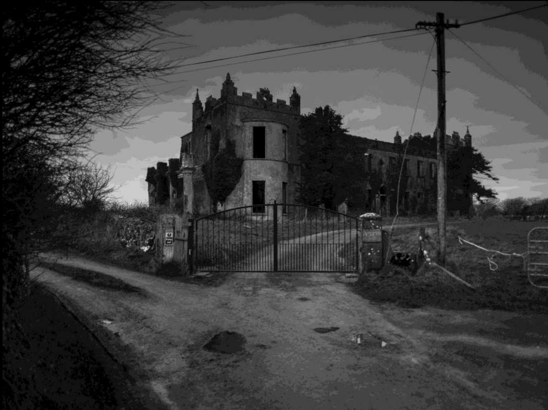
Ardfrý Castle, Oranmore Peninsula, County Galway