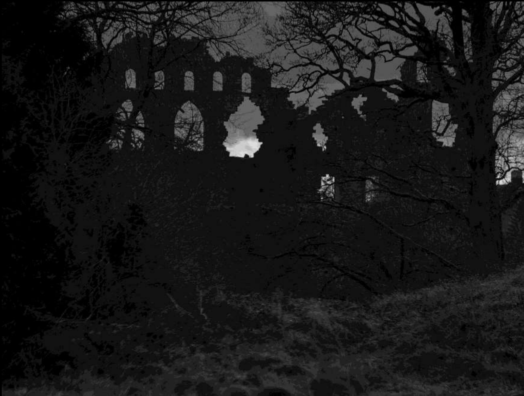
The "Jealous Wall" (Architectural folly), Belvedere House, County Westmeath, 2