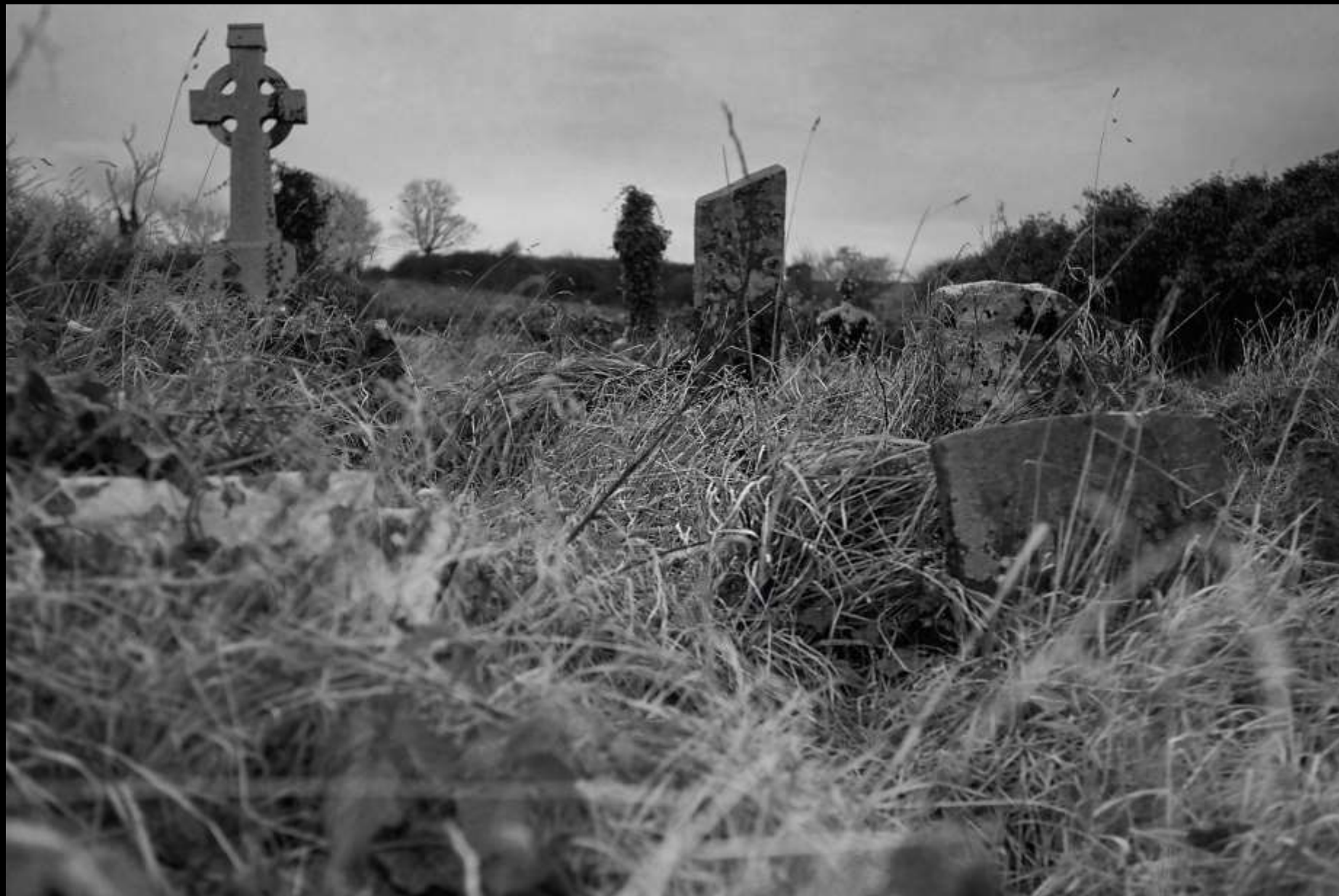
Kilmacshalgan Graveyard (Famine burial site), Dromore West, County Sligo