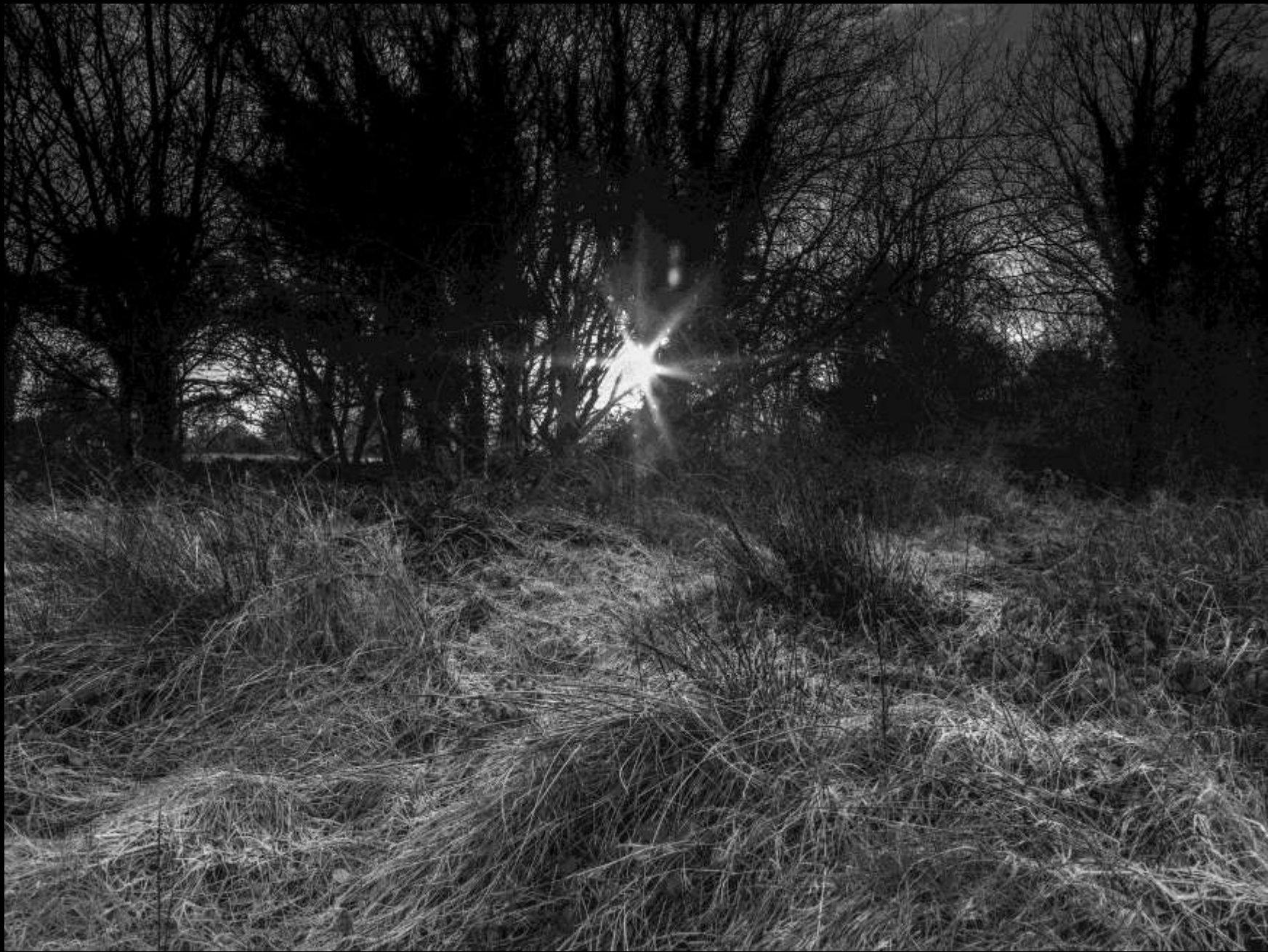
Rossmada Famine burial site, Parteen, County Clare