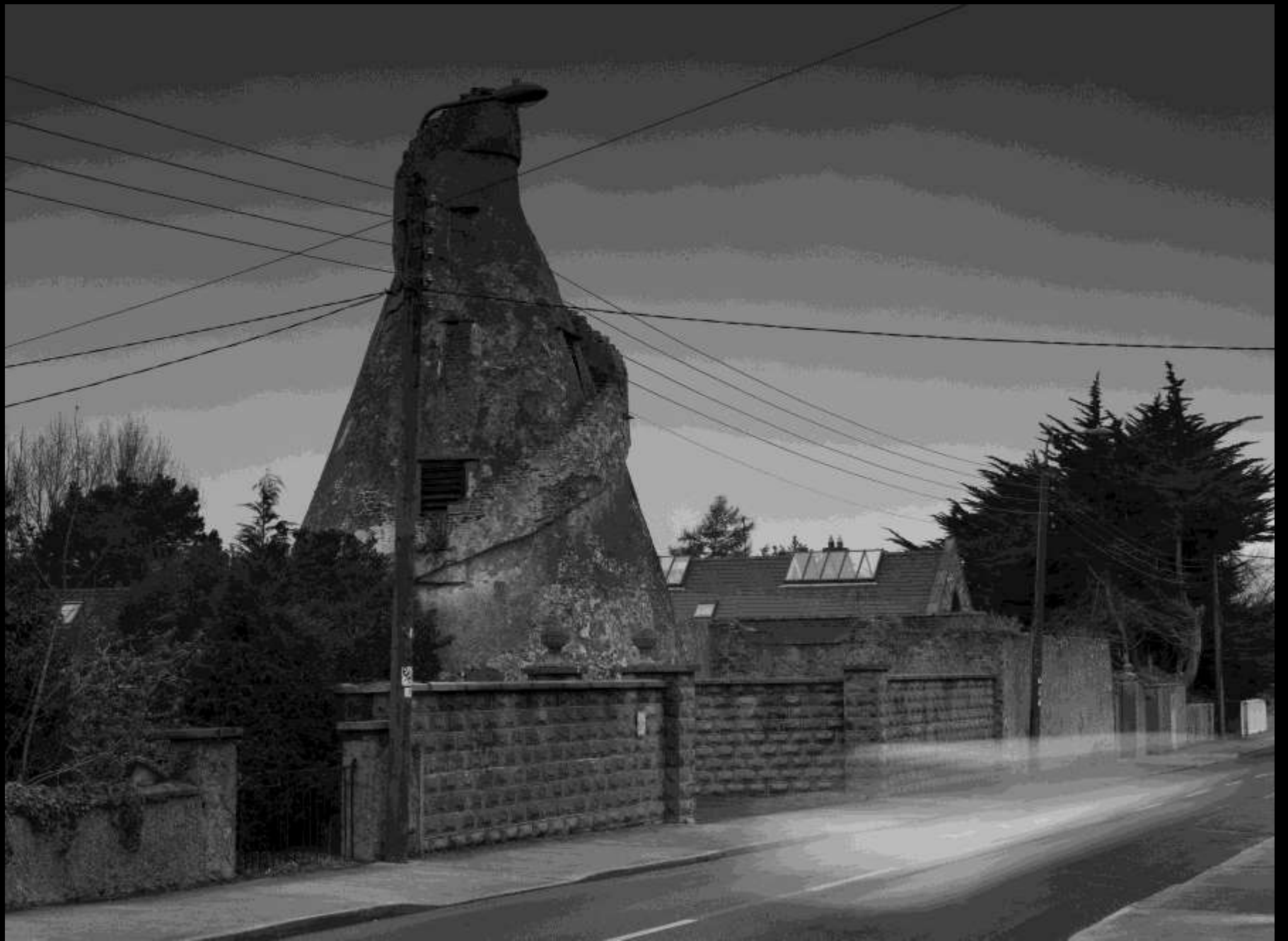
A relic from the famine of 1740-41, Rathfarnham, Dublin