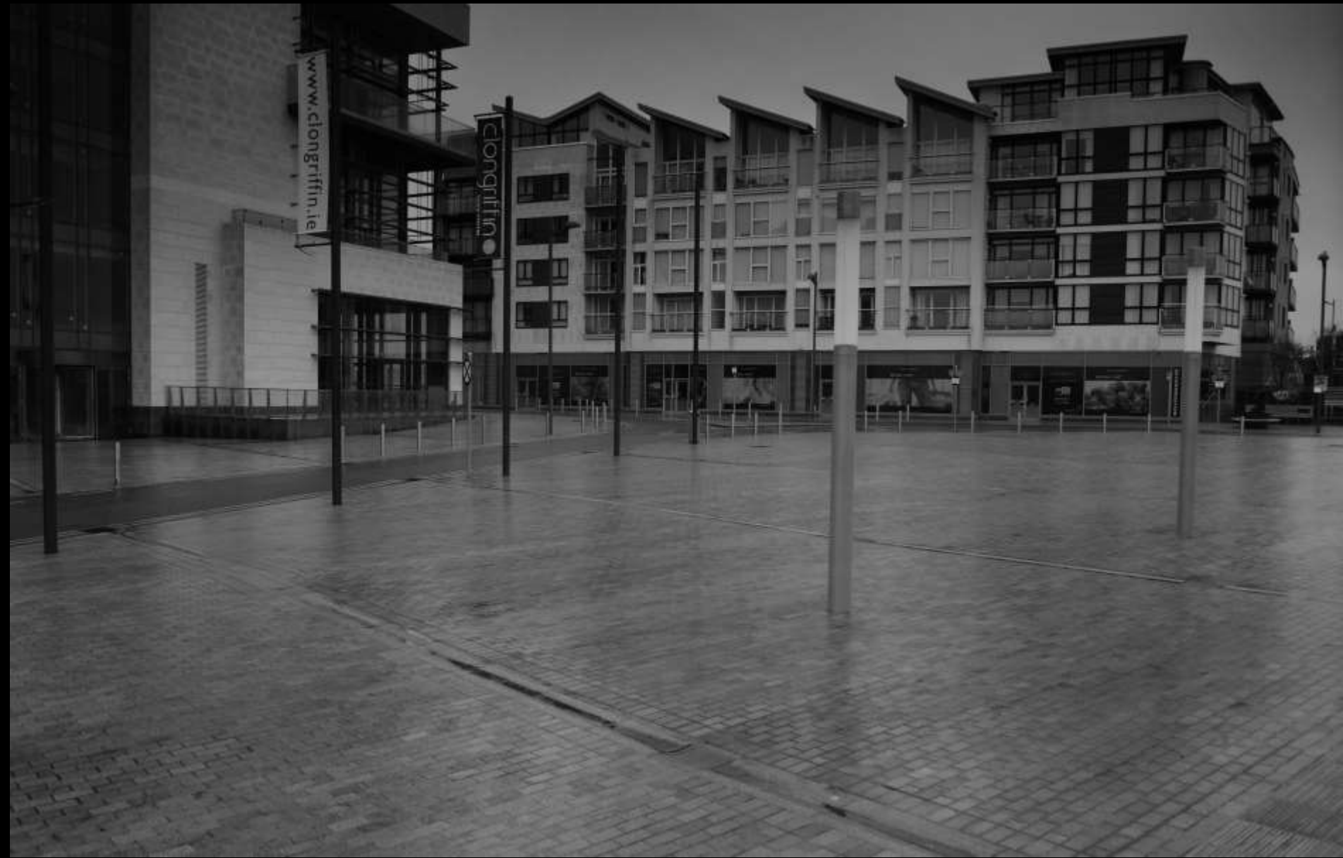
Clongriffin Village Centre (Ghost Estate), Dublin