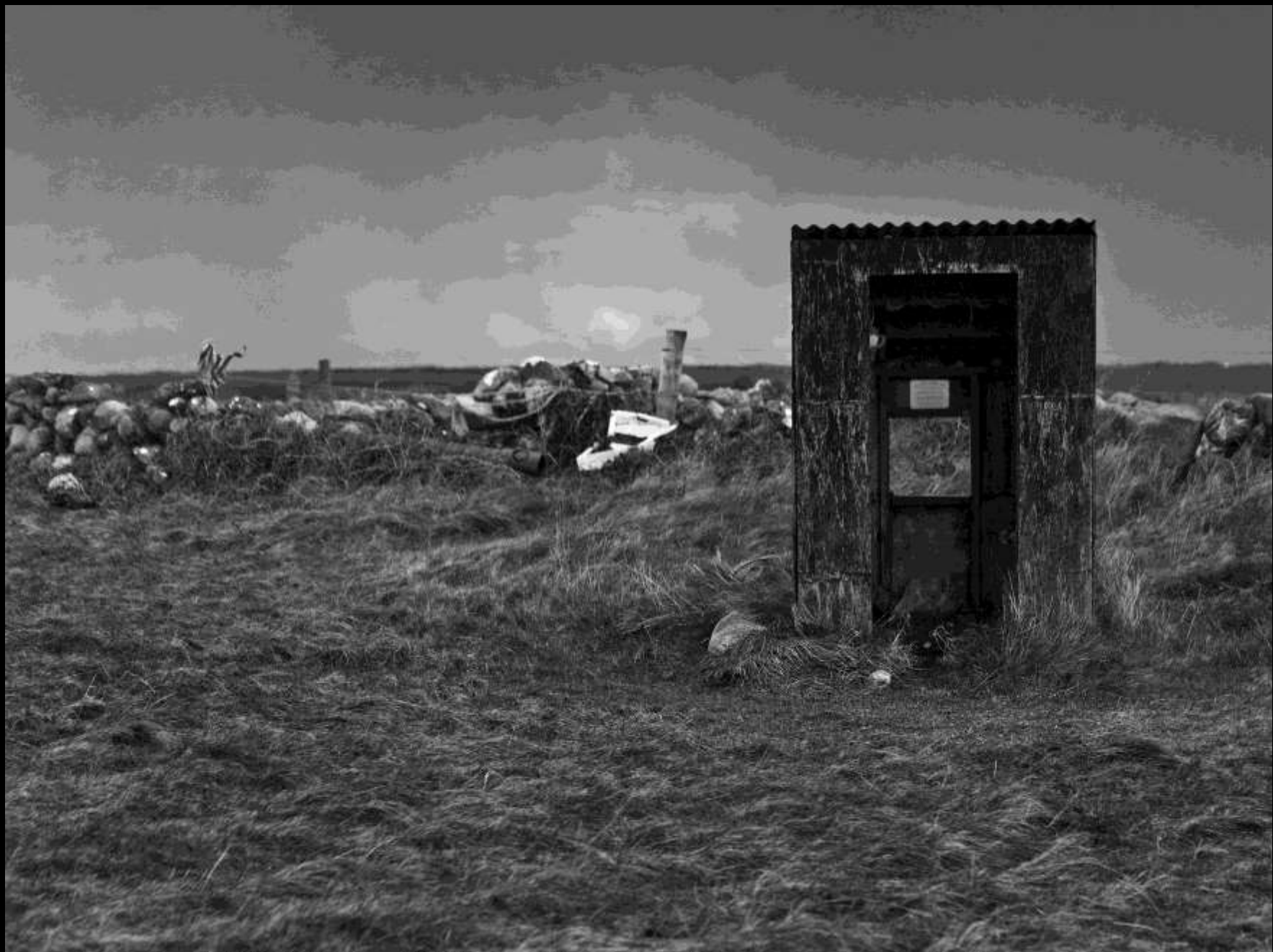
Famine burial site, Aghinish Peninsula, County Clare