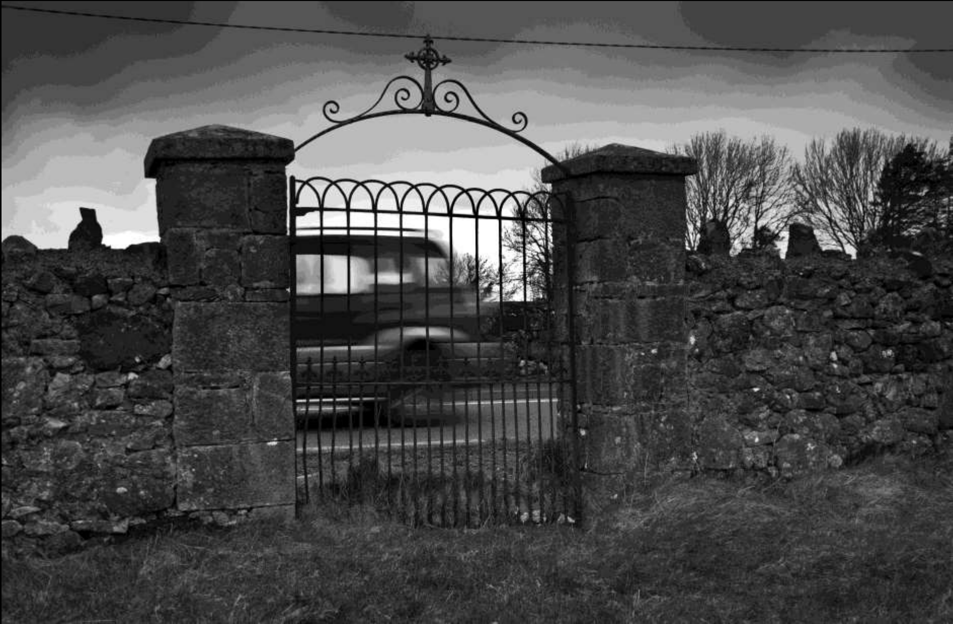
Gort Workhouse and Famine Graveyard, Gort, County Galway