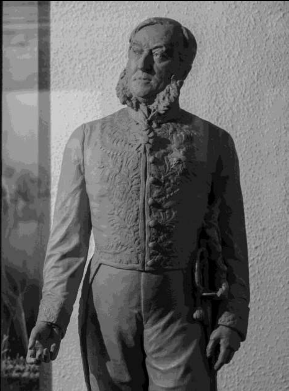
"Quarter Acre Gregory", Gort, County Galway