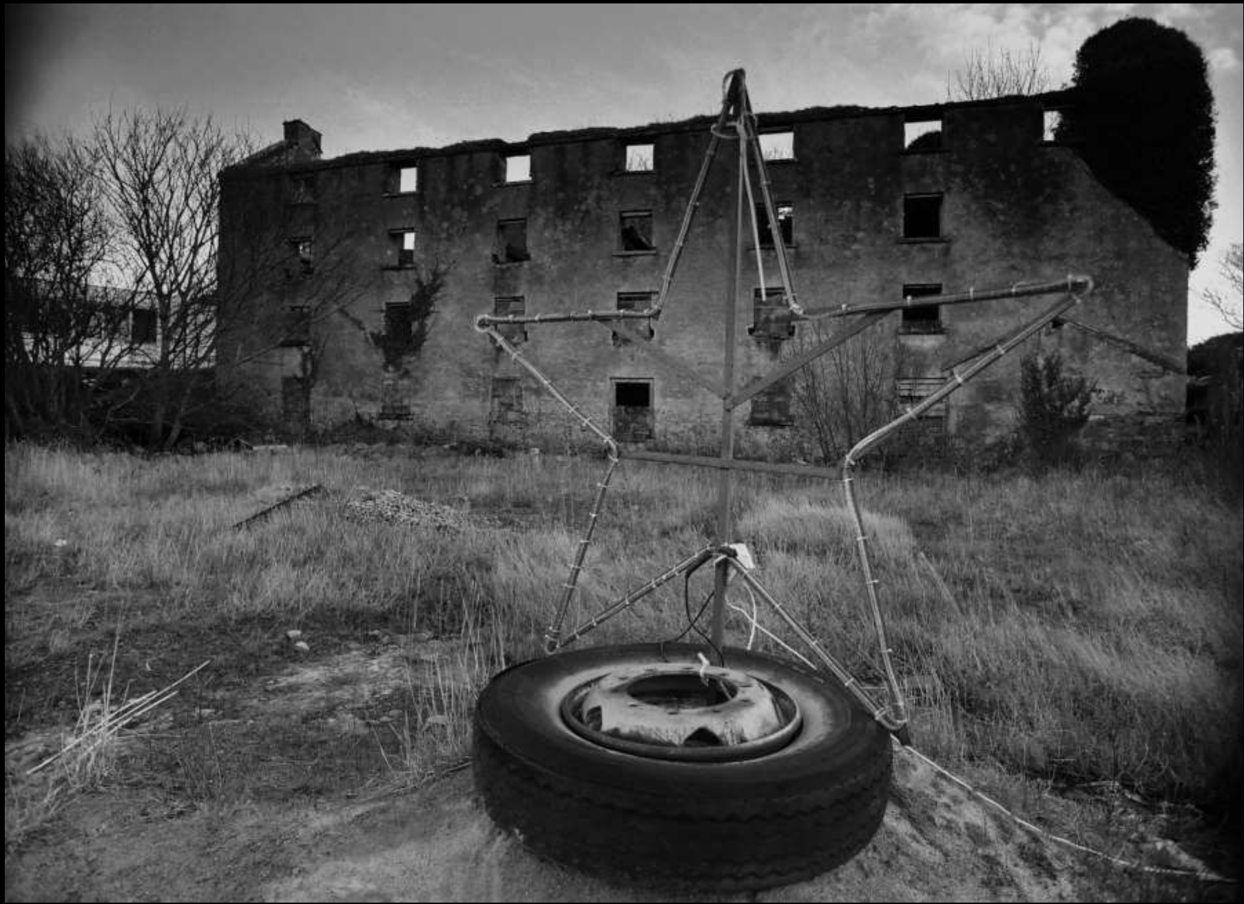
Dungloe Infirmary (Famine burial site), Dungloe, County Donegal