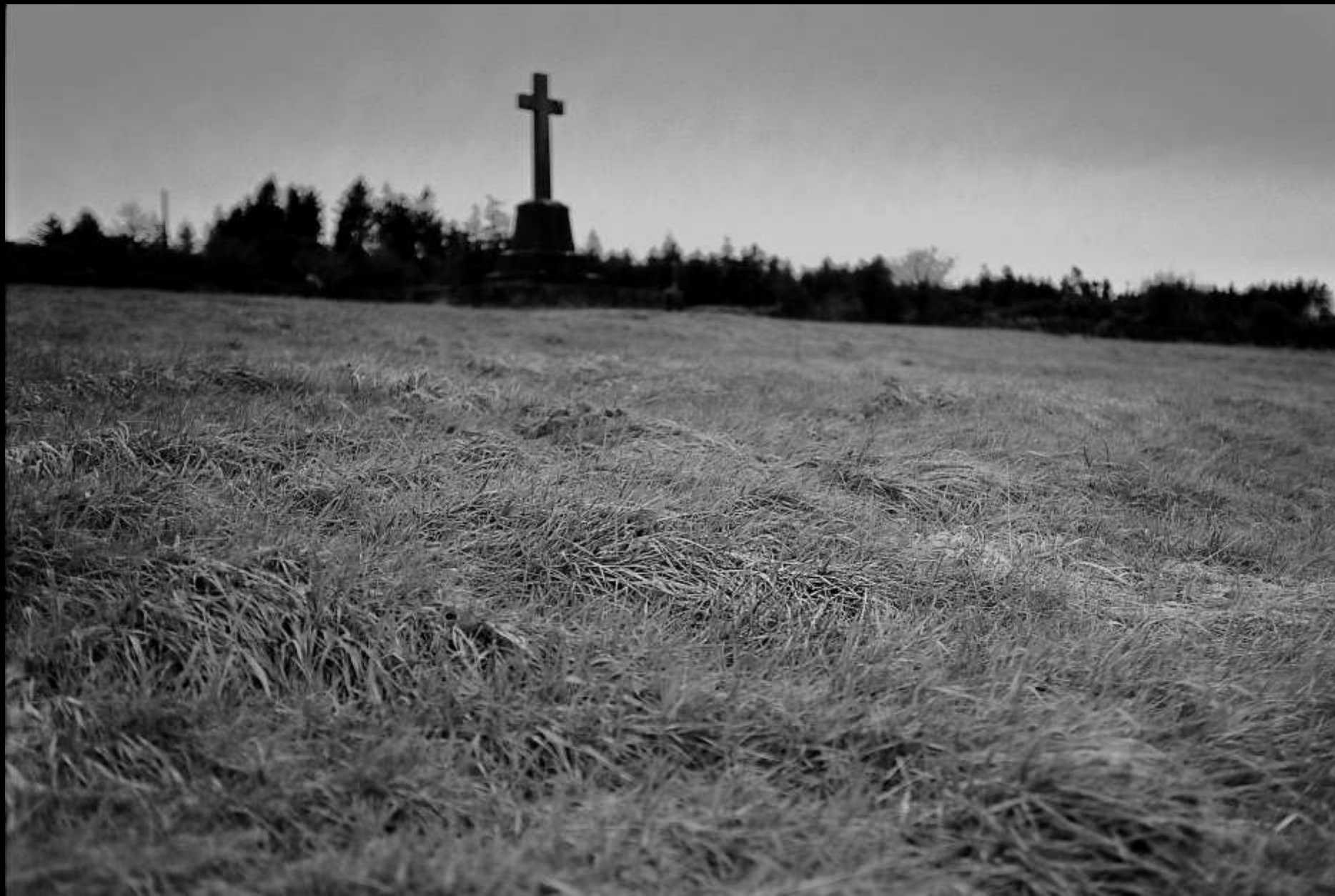
Dungarvan Workhouse and Famine Graveyard, Pulla, County Waterford