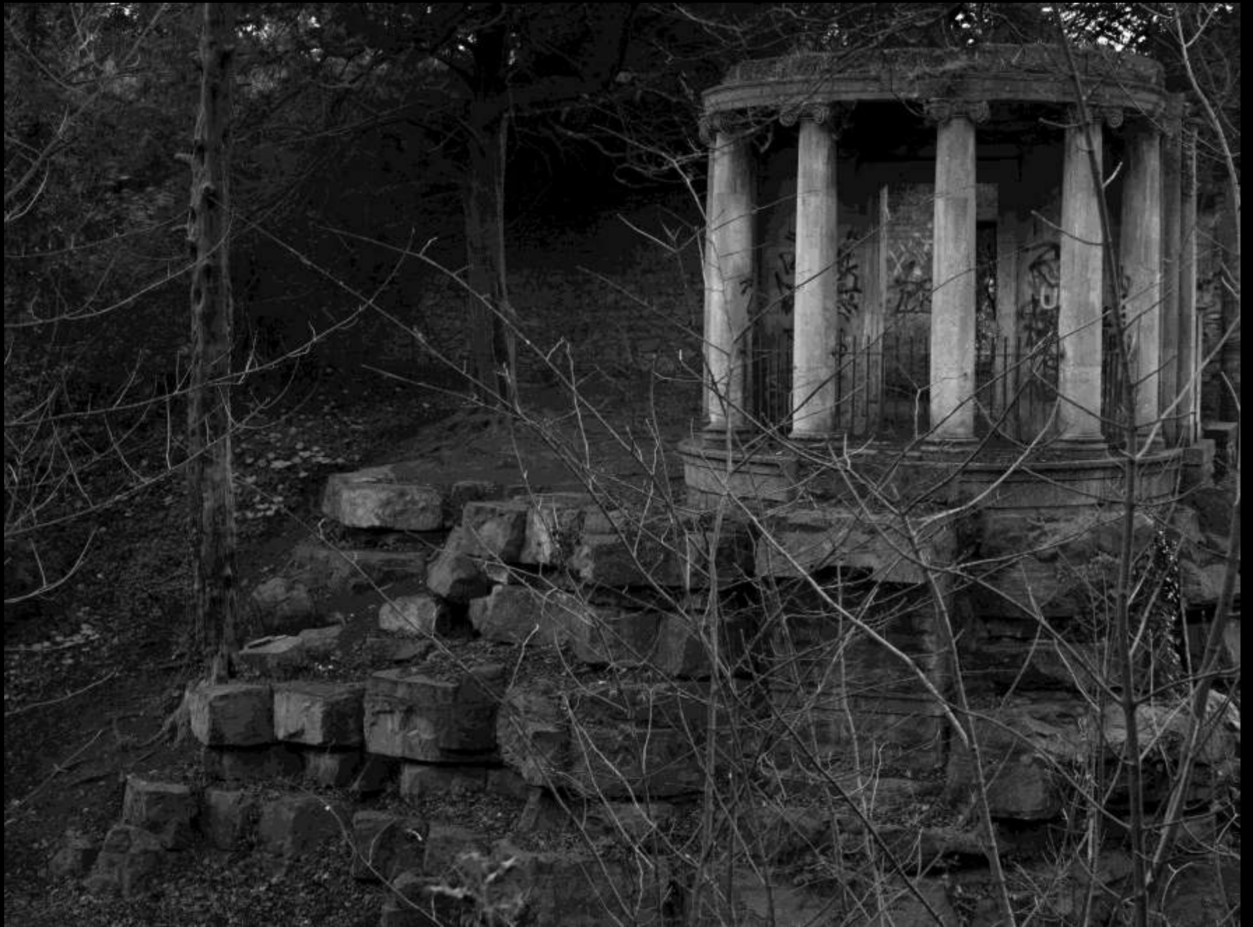
Temple folly, St Anne's Park, Dublin