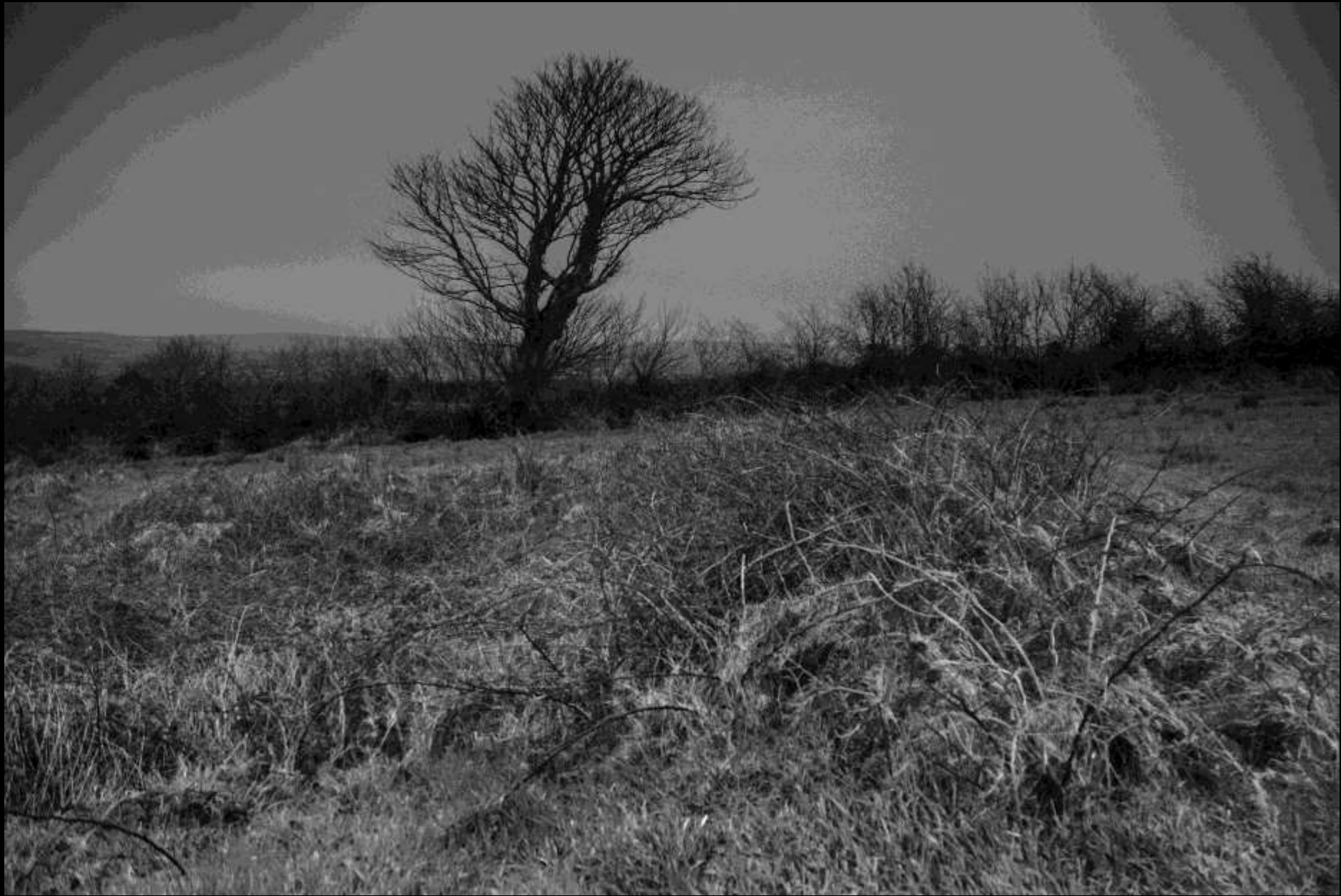
Famine burial site, Athea, County Limerick