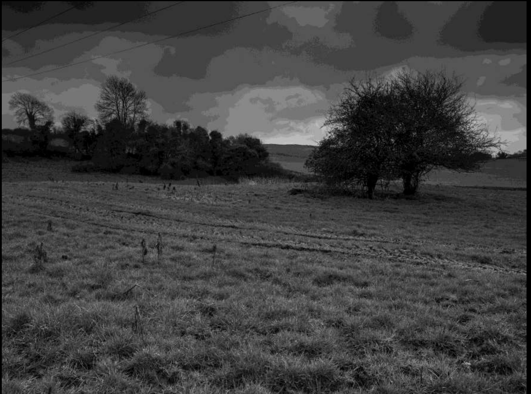
Sixmilebridge Graveyard (Famine burial site), Sixmilebridge, County Clare