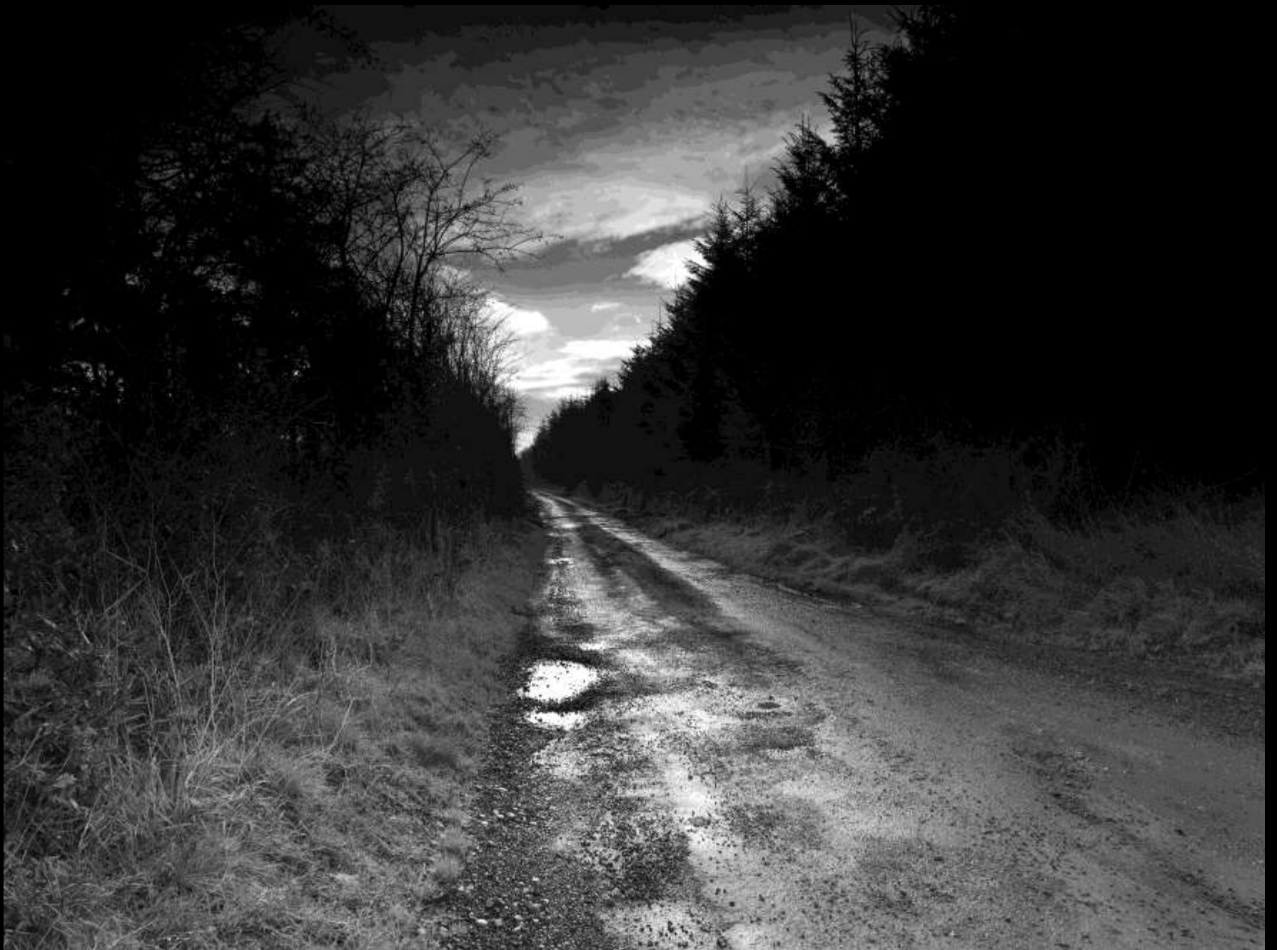
Famine eviction site, Ballinglass, County Galway, 2