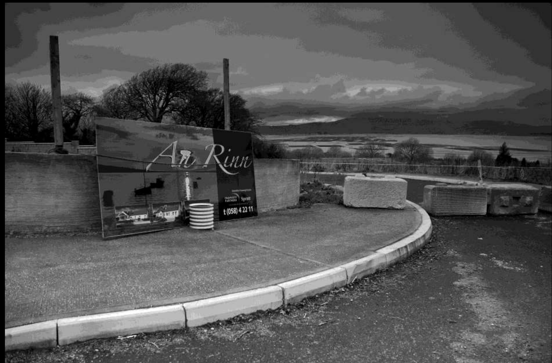
"An Rinn" (Ghost Estate), An Rinn, County Waterford