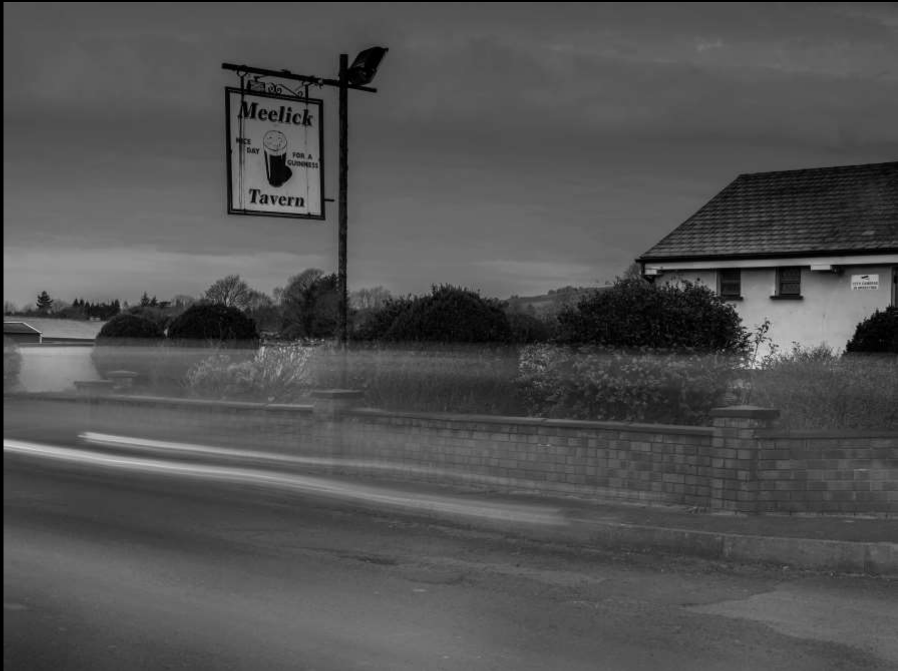
Knocklisheen Graveyard (Famine burial site), Meelick, County Clare