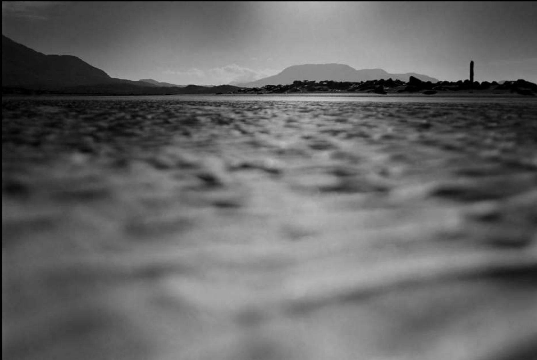
Templedoomore Graveyard, Thallabawn, County Mayo