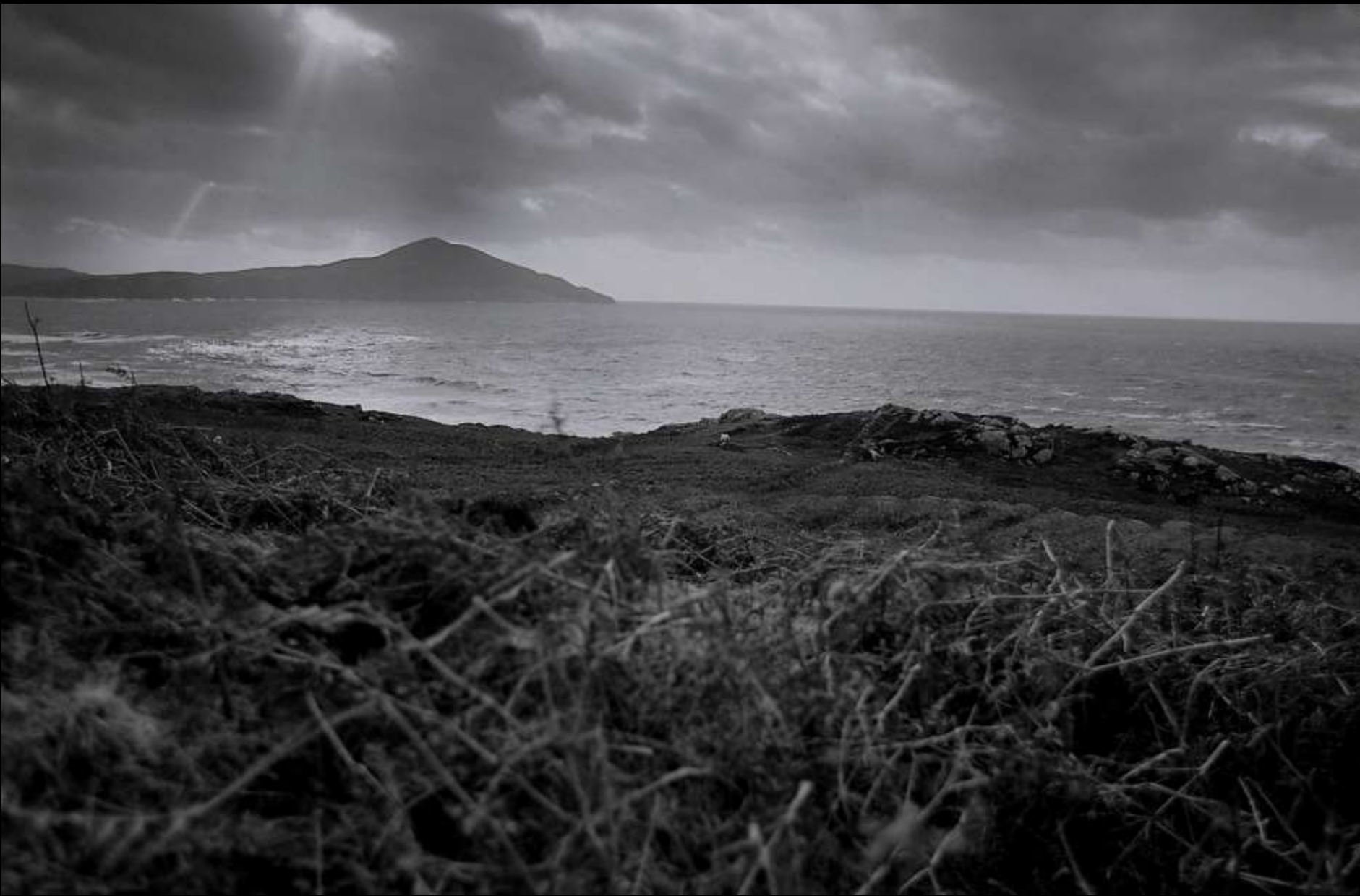
Potato cultivation ridges, Carrowgarve, Achill Island, County Mayo