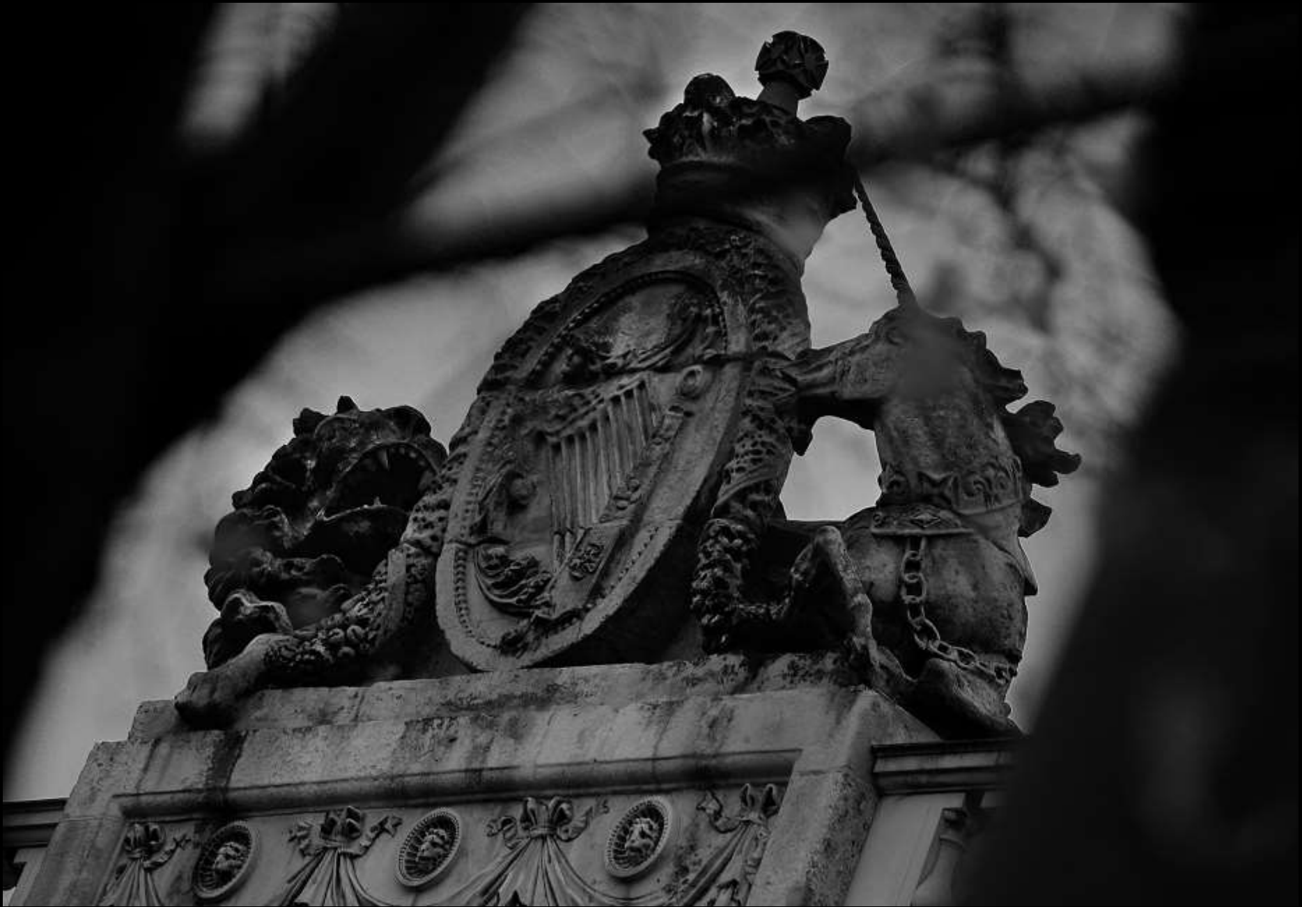
Colonial heraldry, Custom House, Dublin