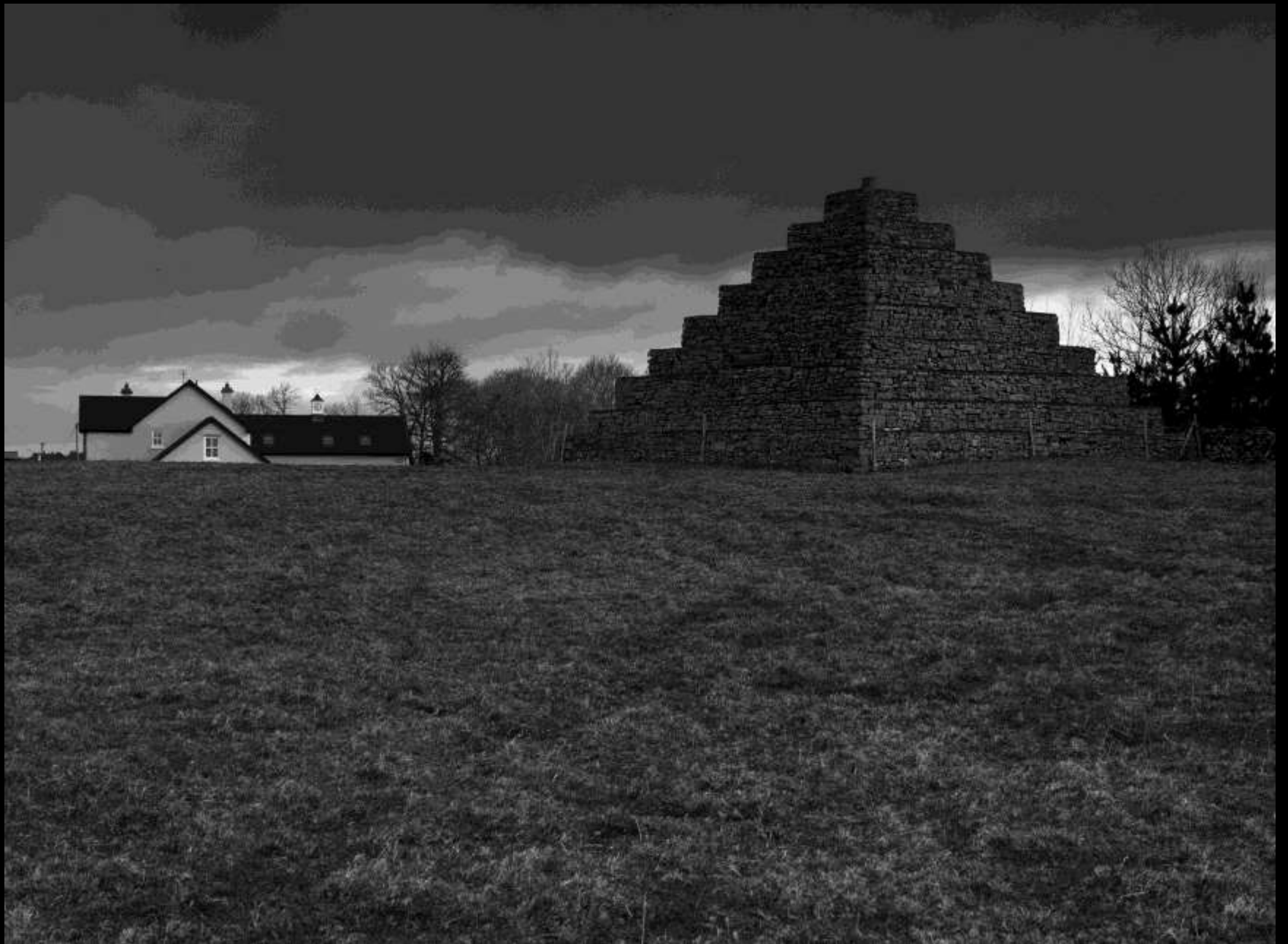
"The Pyramid of The Neale" (Architectural folly), Cong, County Mayo