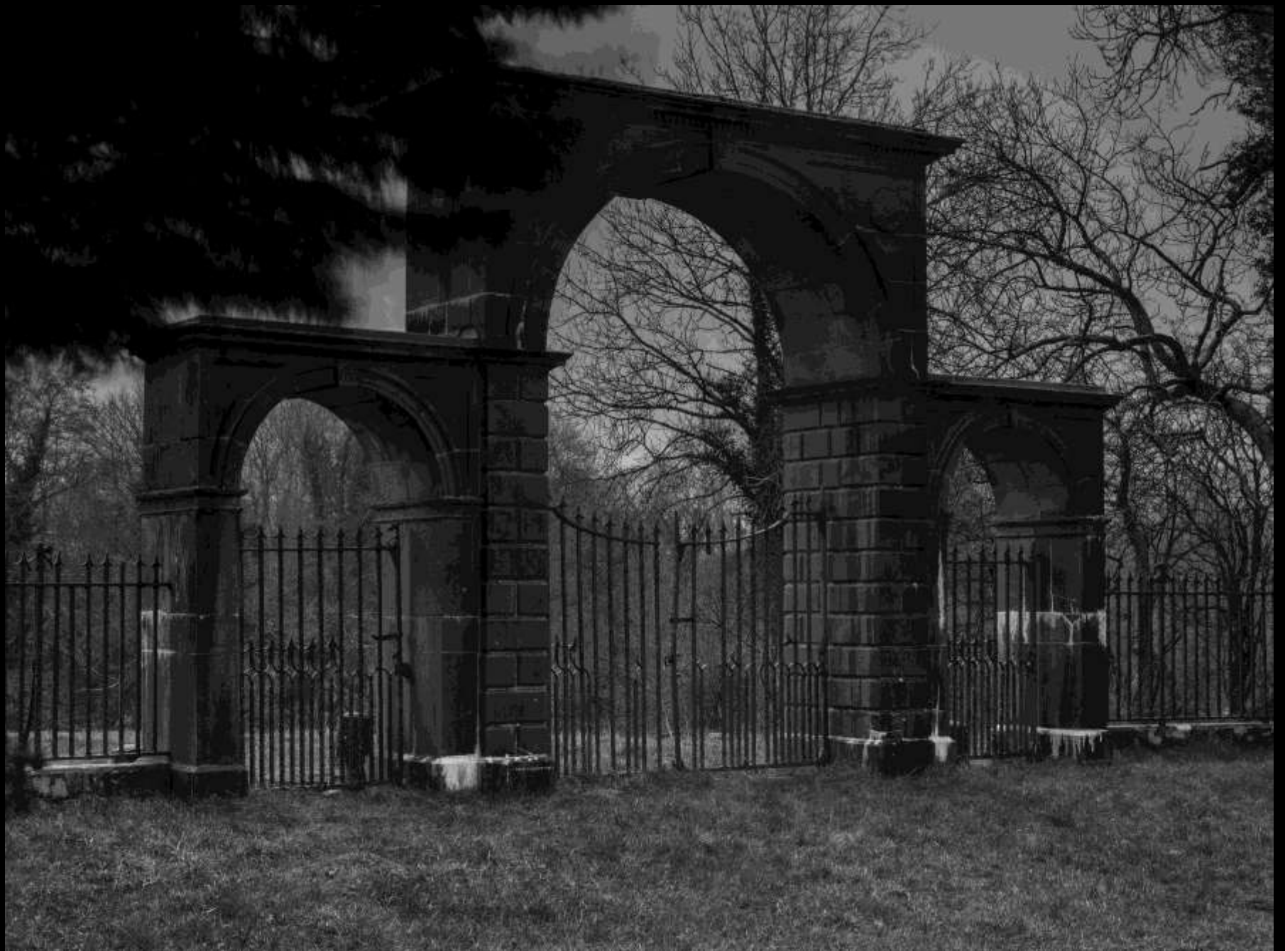
Northbrook Demesne gateway, Northbrook, County Galway