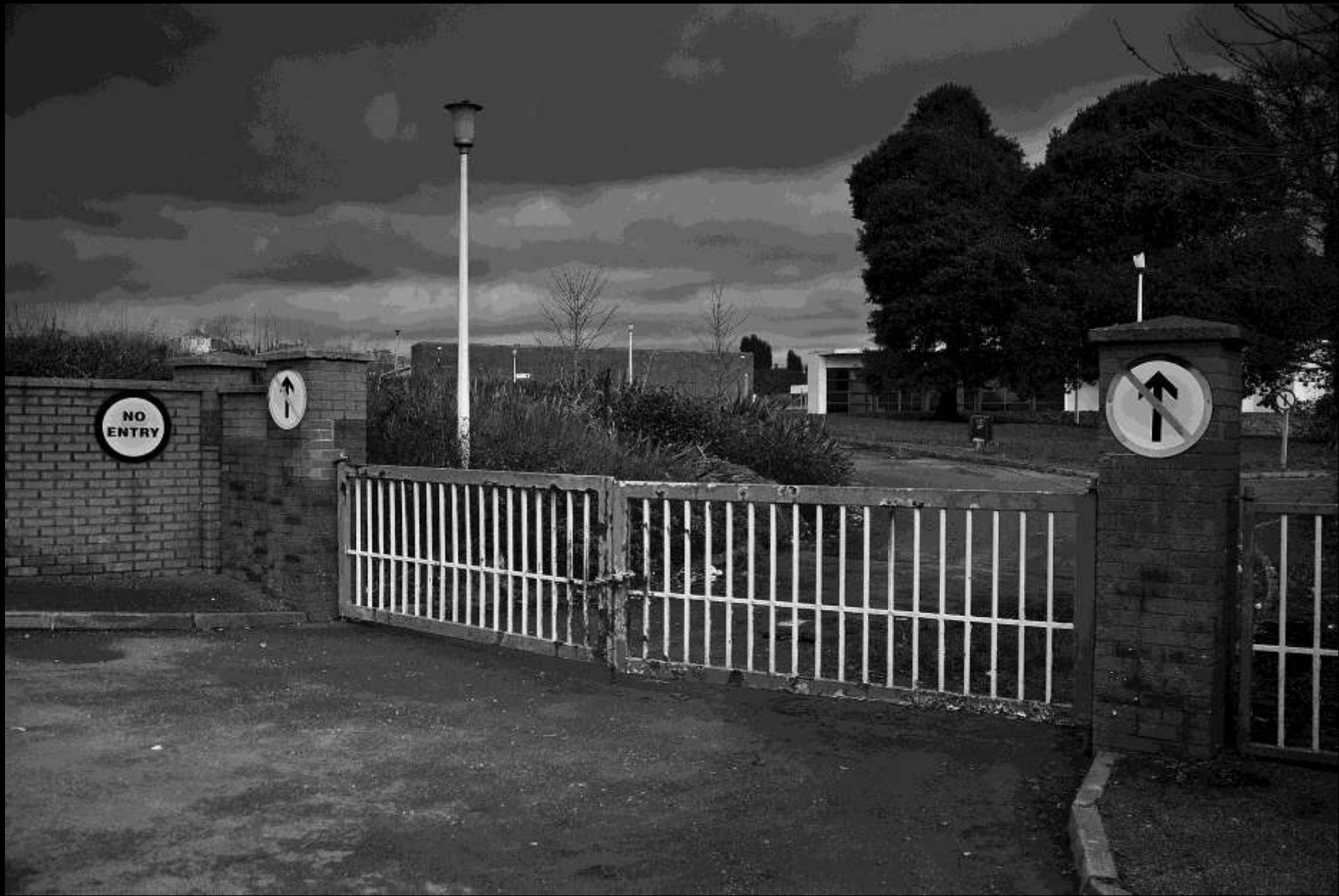
The abandoned Waterford Crystal Factory, County Waterford