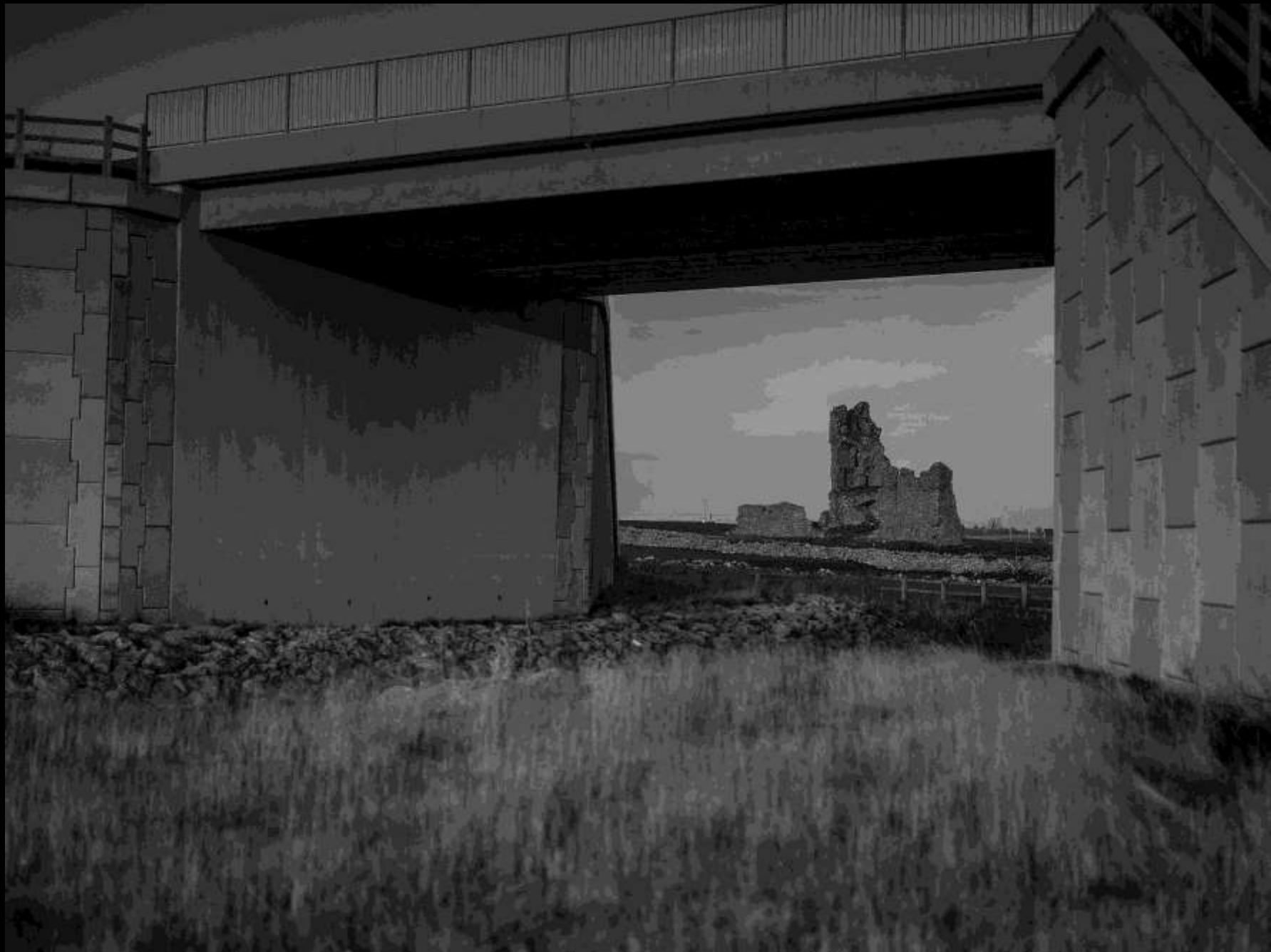
Kiltullagh Castle, Kiltullagh, County Galway