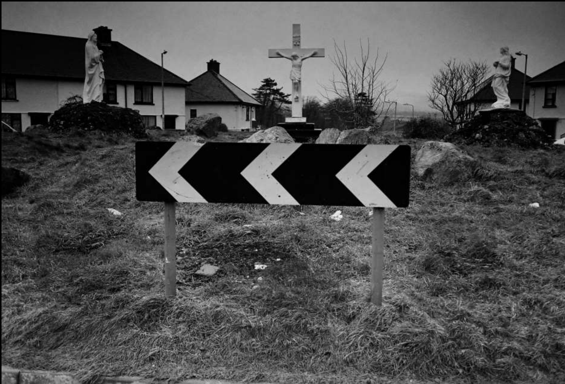
Passage tomb and Calvary scene, Garavogue Roundabout, Sligo Town, County Sligo