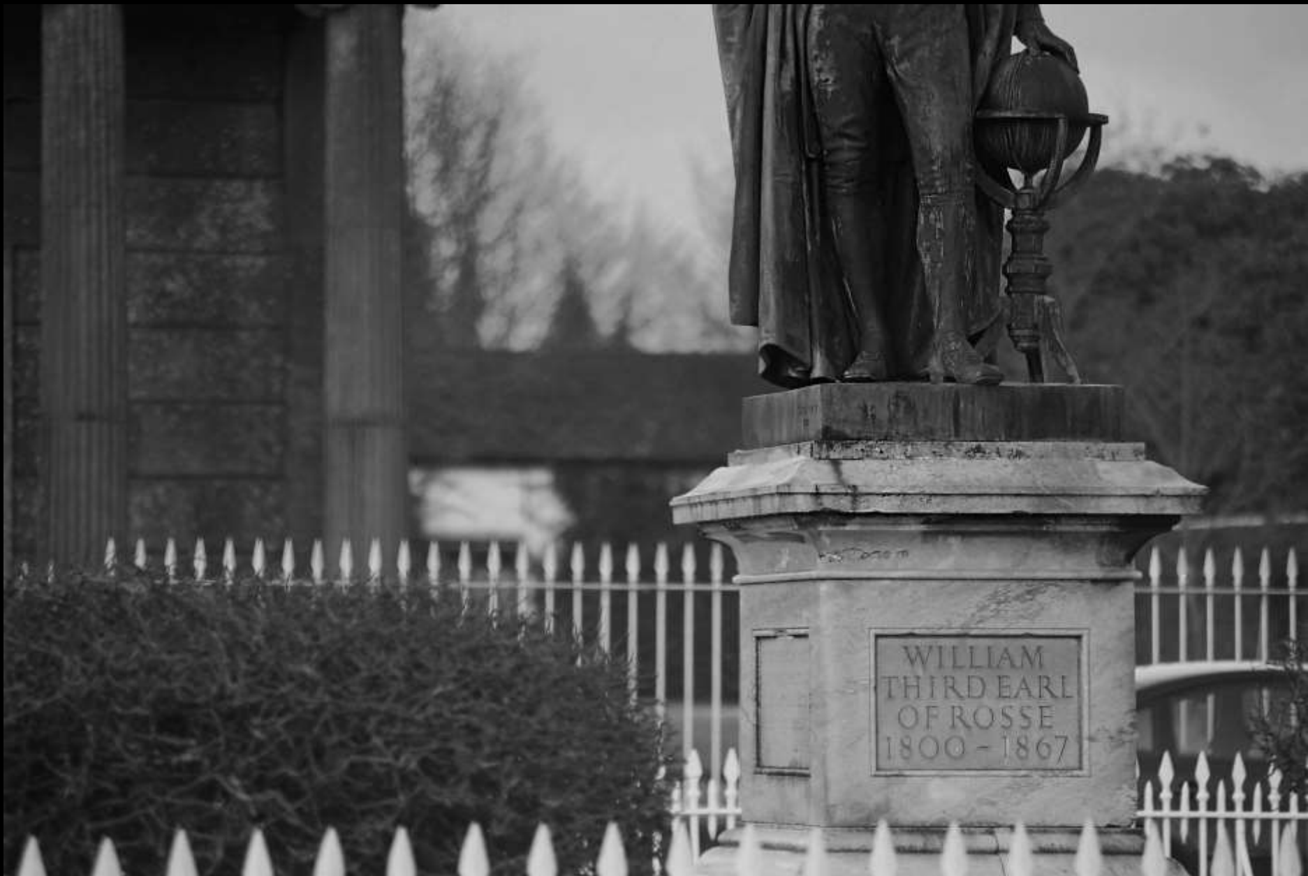
Lord Rosse, Birr, County Offaly