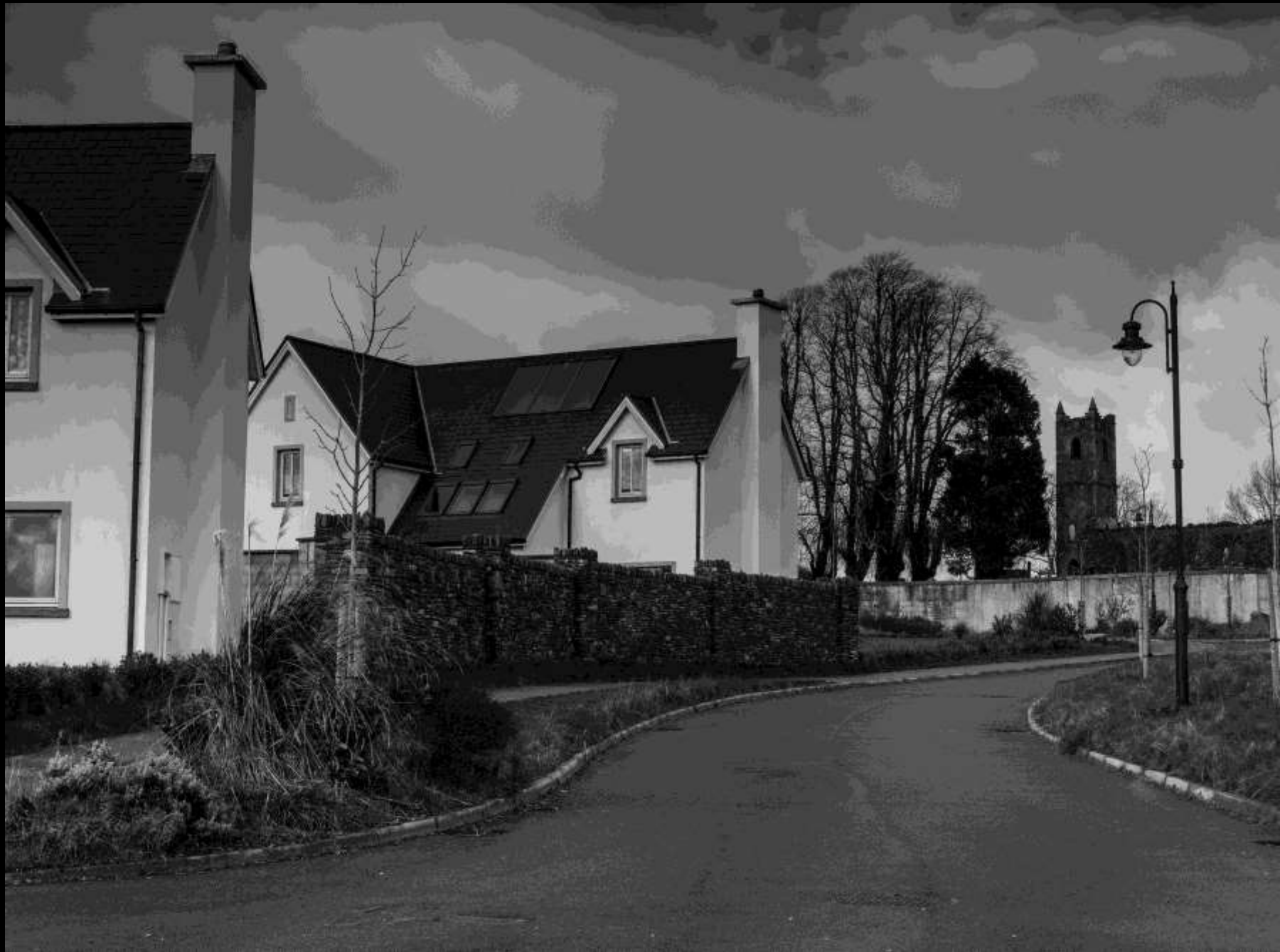
"The Lodges" (Ghost Estate), Kenmare, County Kerry