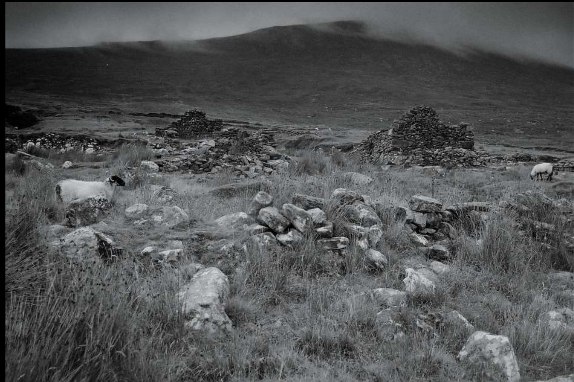
"The Deserted Village", Achill Island, County Mayo, 6