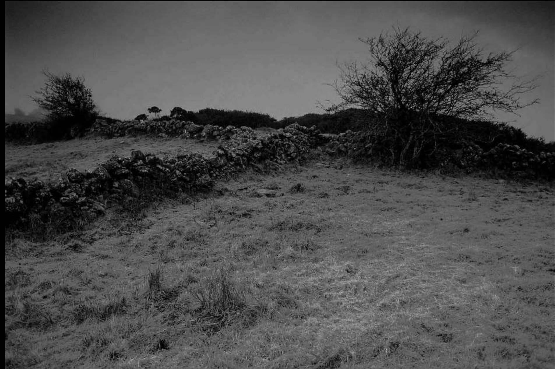
Famine eviction site, Tonabrocky, County Galway