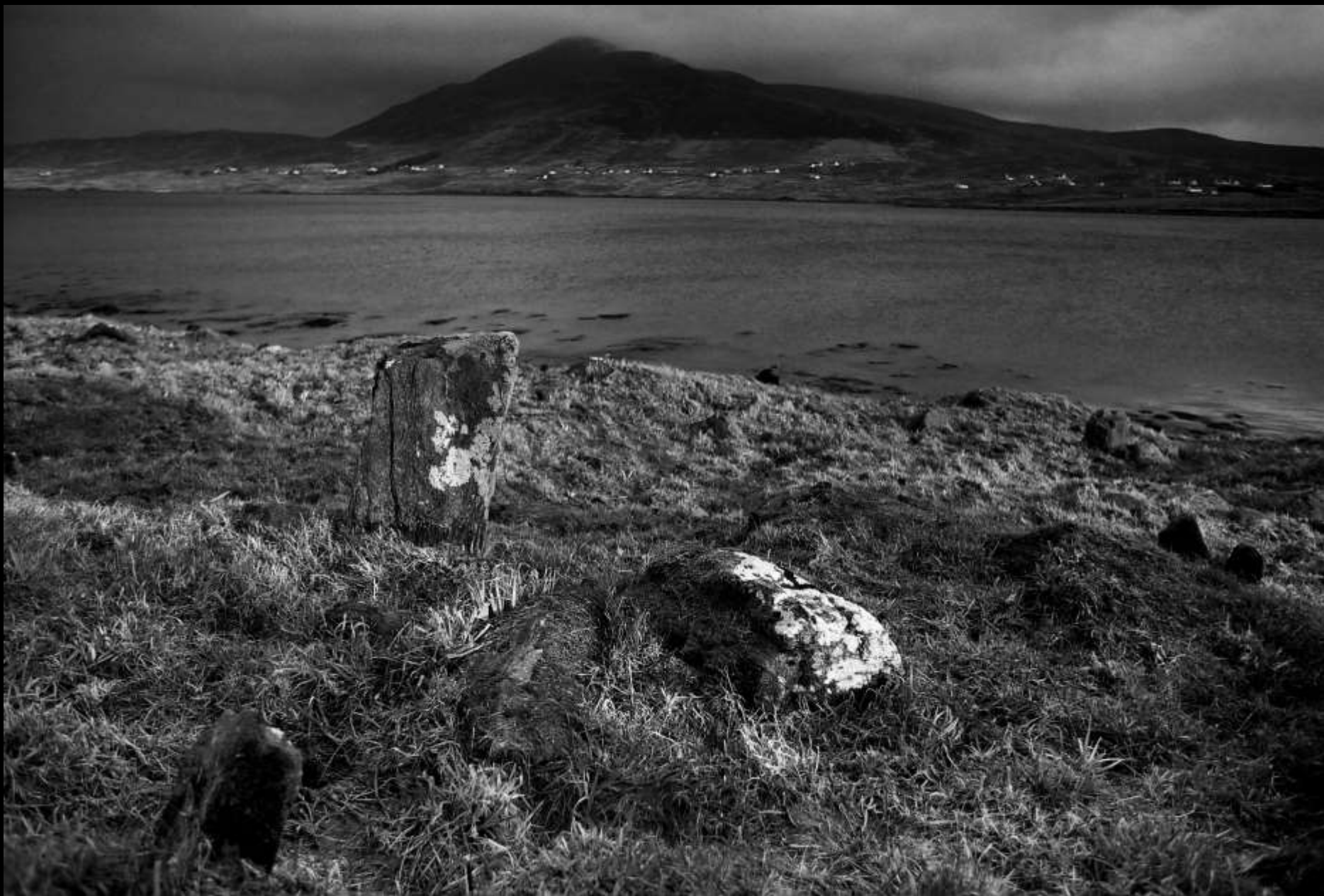
Famine graves, Old Kildownet Cemetery, Achill Island, County Mayo