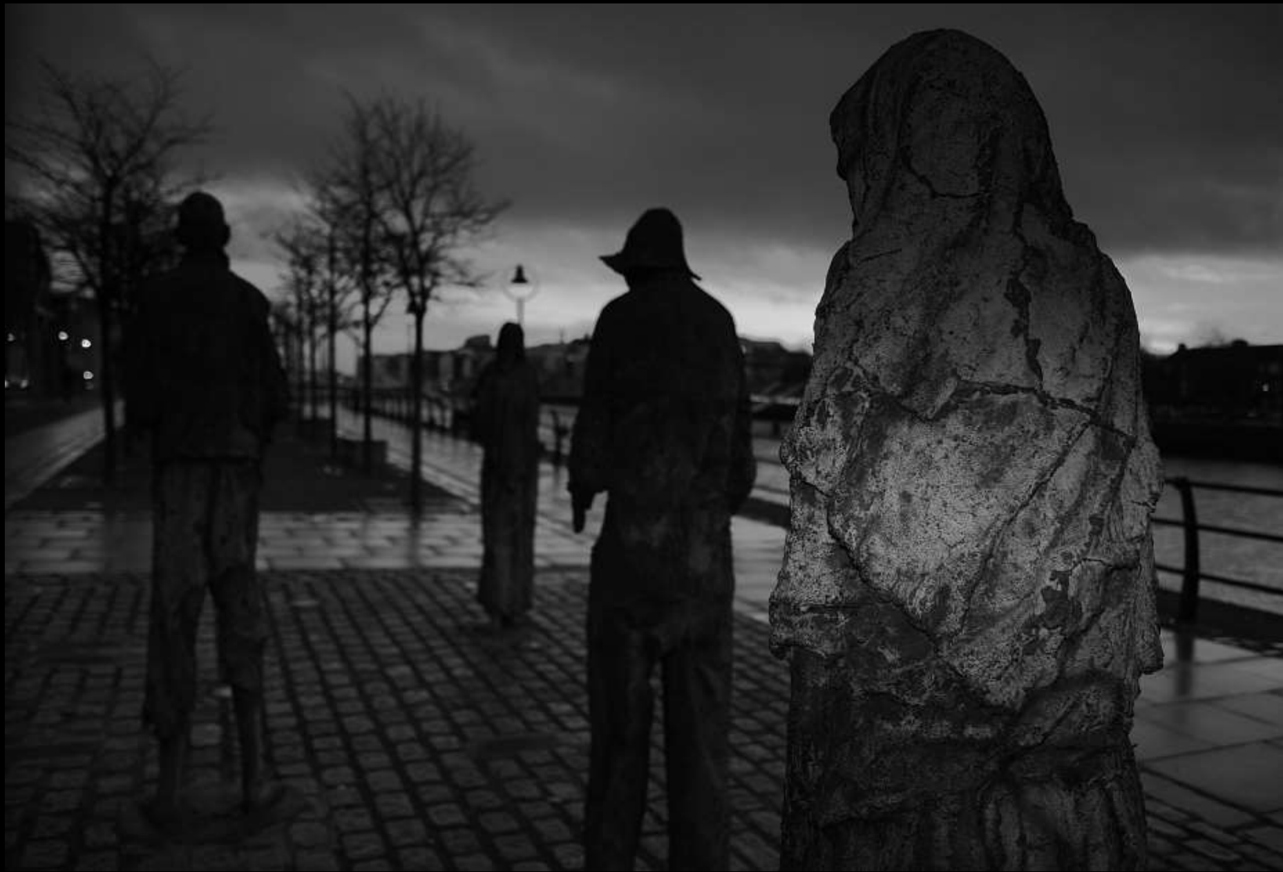
Famine memorial, Custom House Quay, Dublin