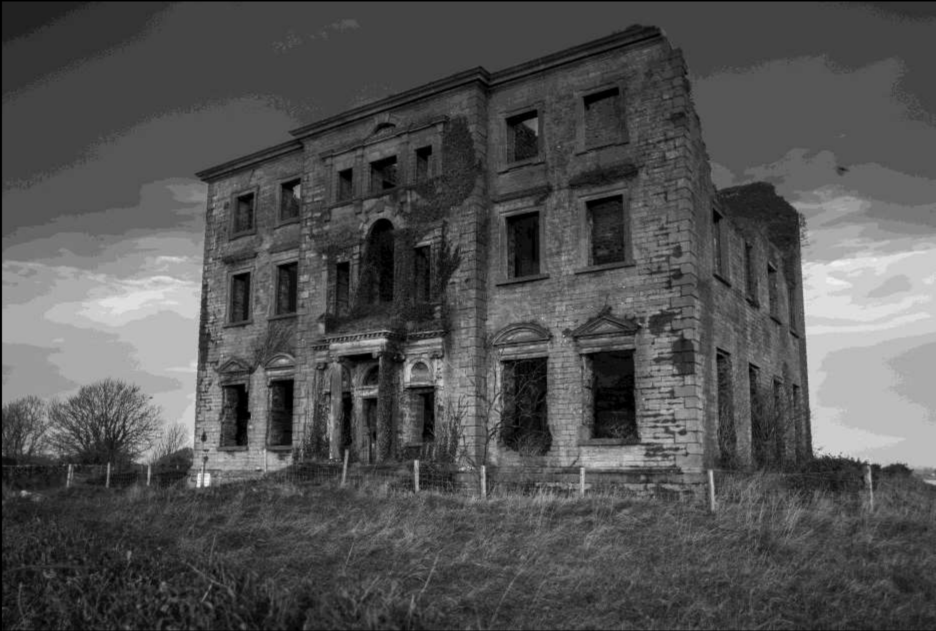
Tyrone House, Kilcolgan, County Galway