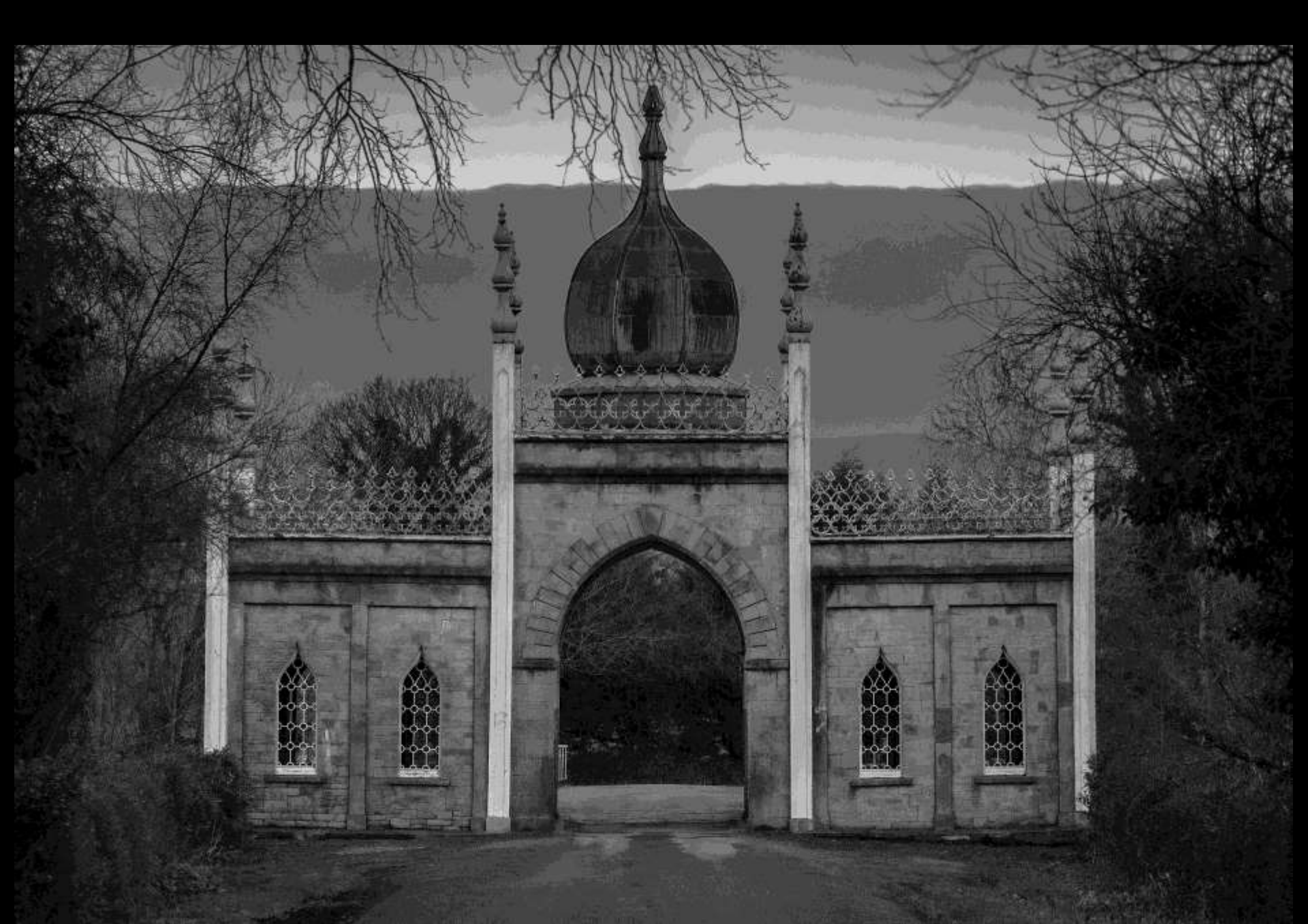
Dromana Gate, Villierstown, County Waterford