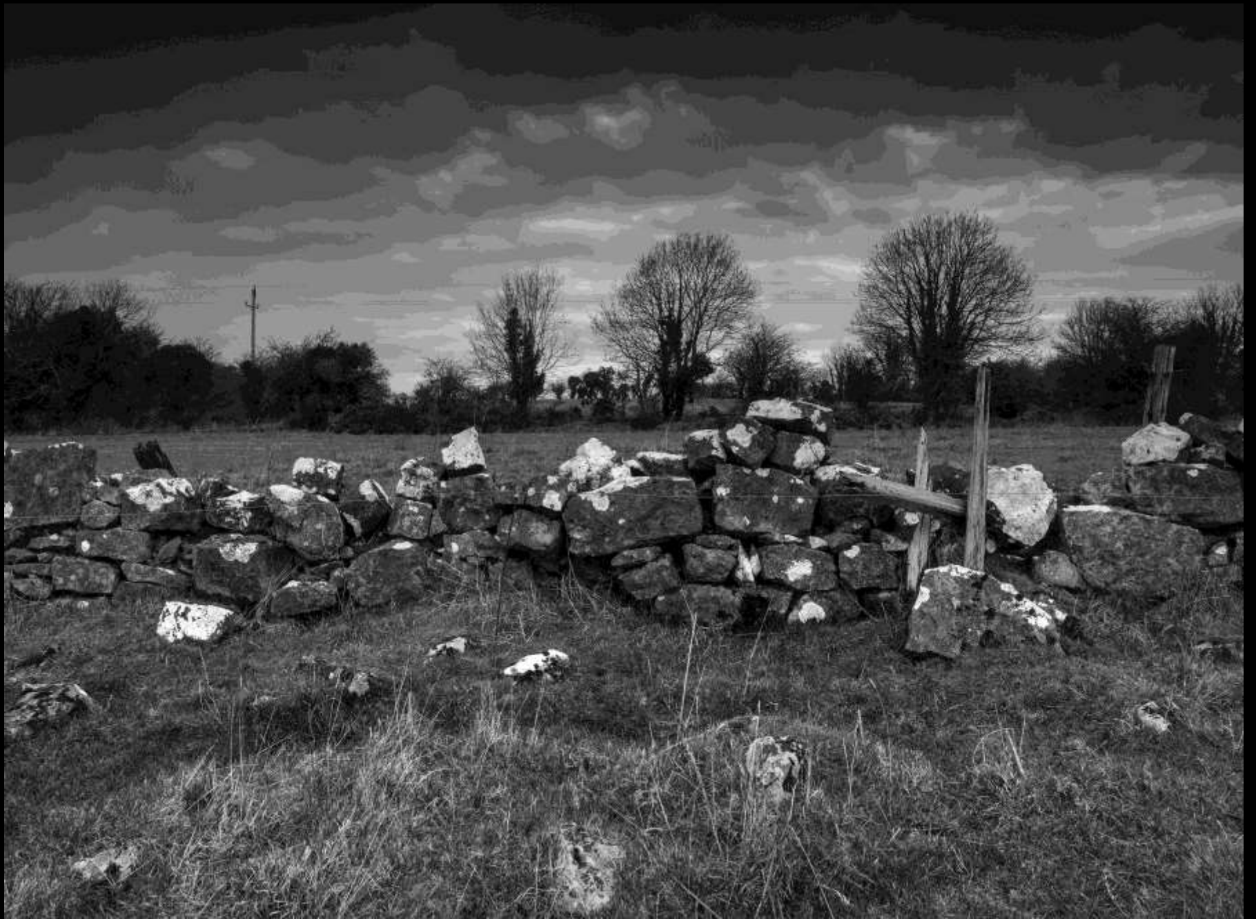
Glenamaddy Workhouse and Famine Graveyard, Glenamaddy, County Galway