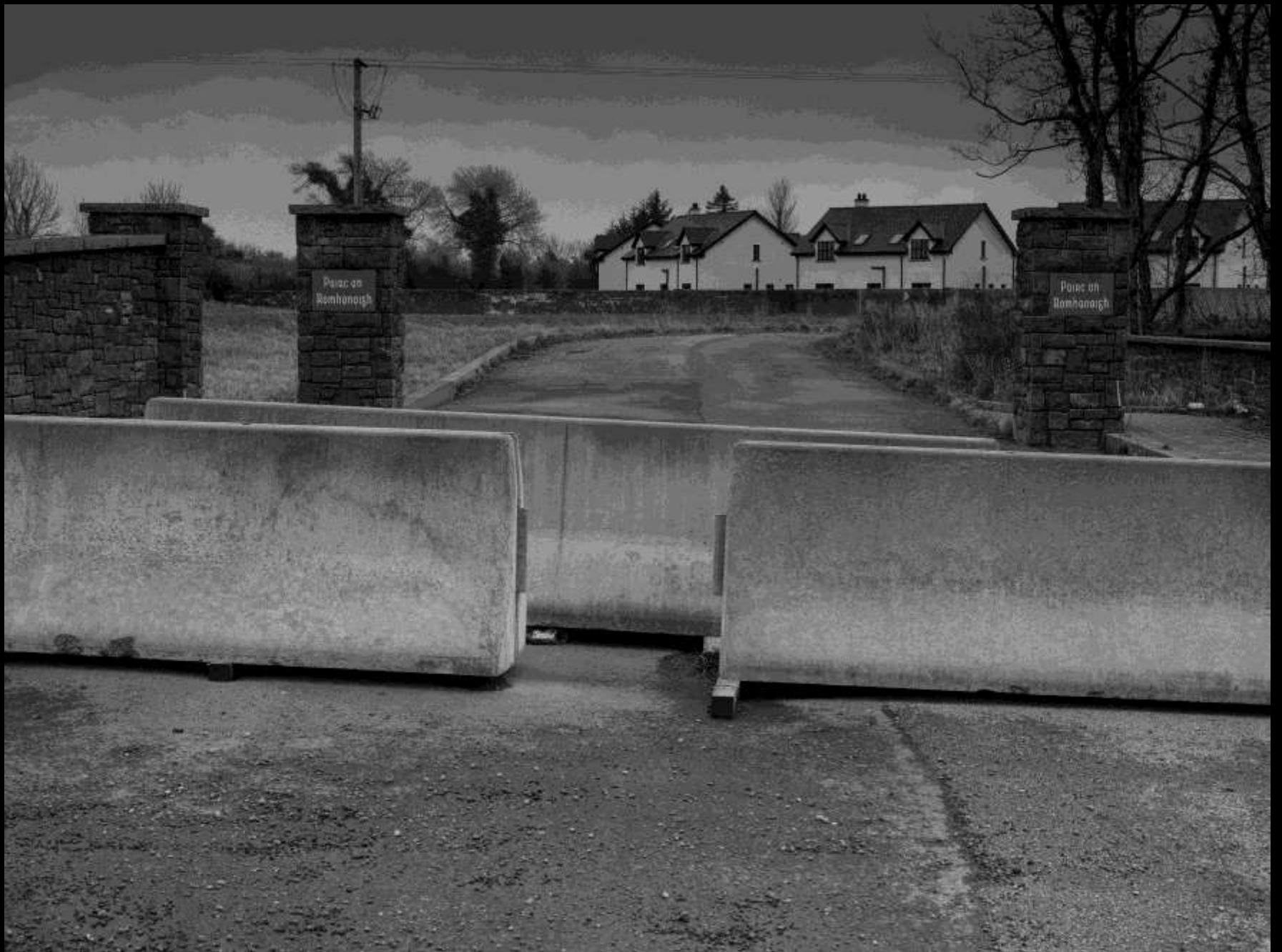
"Páirc an Romhonaigh" (Ghost Estate), Kiltullagh, County Galway