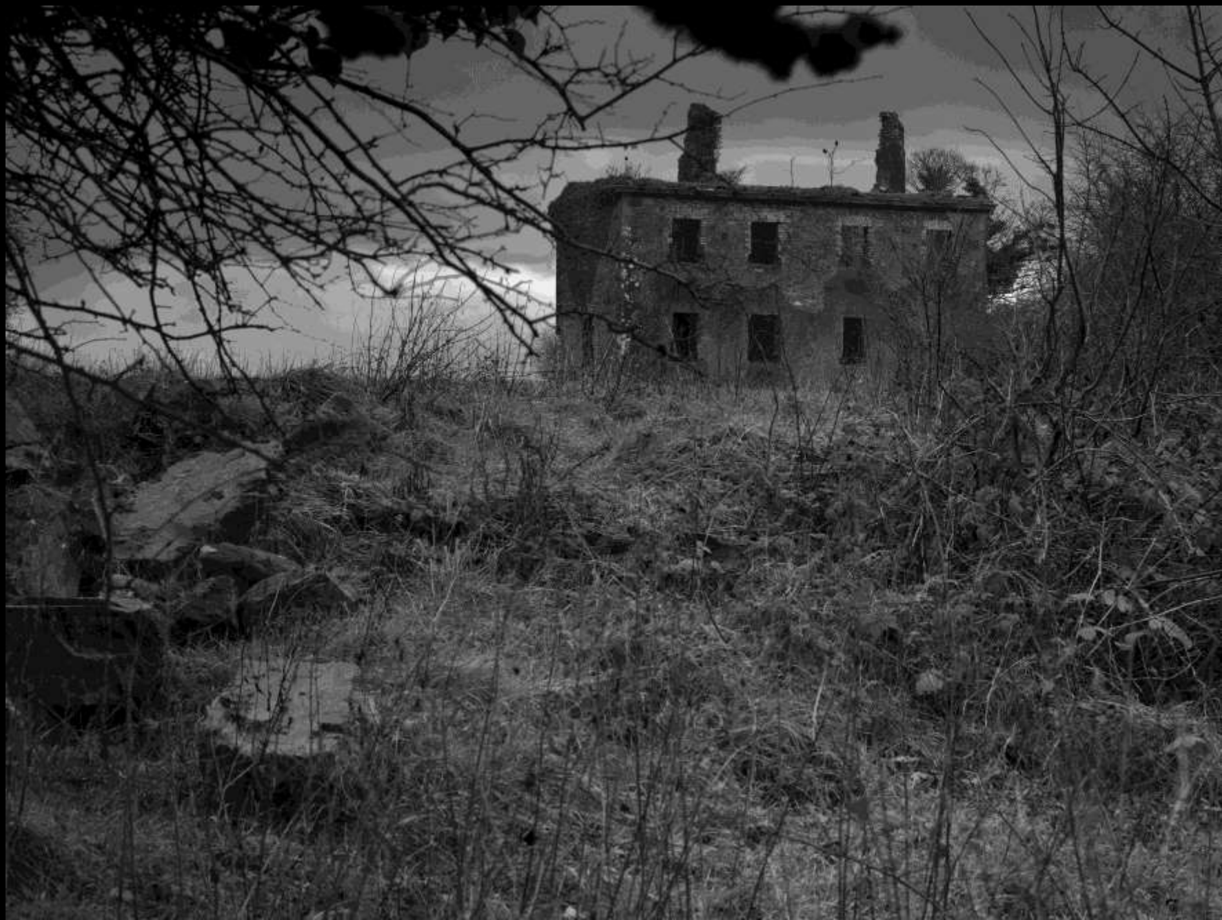
Neale House, Cong, County Mayo