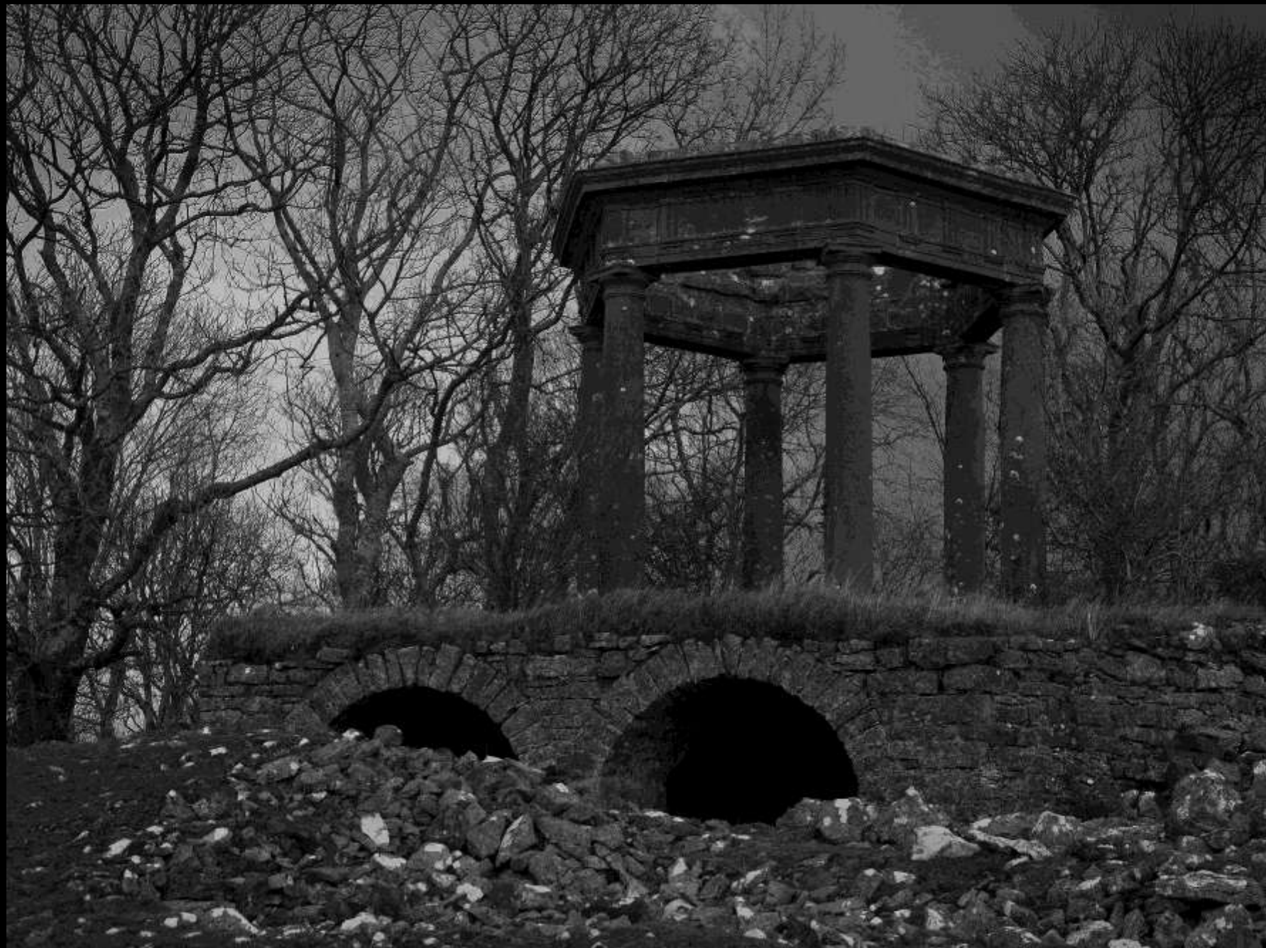
"The Temple" (Architectural folly), Cong, County Mayo