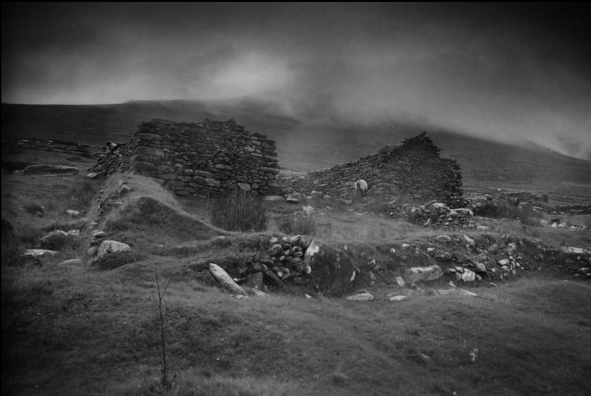
"The Deserted Village", Achill Island, County Mayo, 5