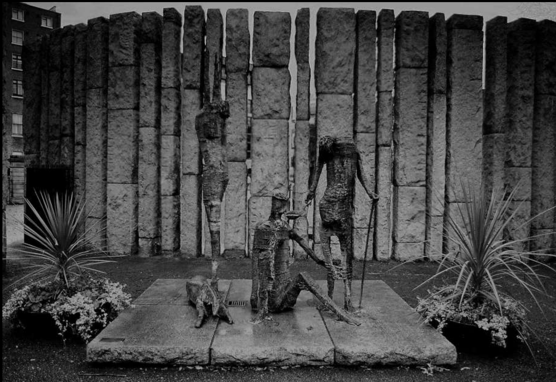
Famine memorial, St Stephen's Green, Dublin