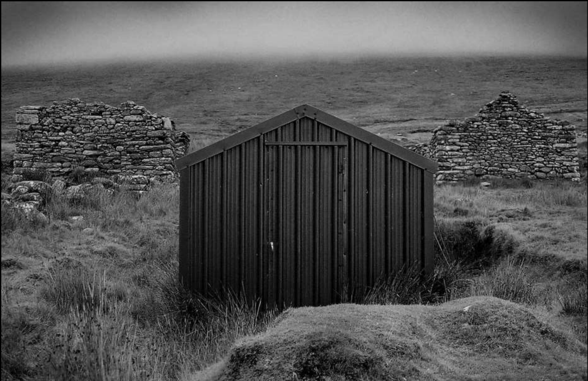
"The Deserted Village", Achill Island, County Mayo, 2