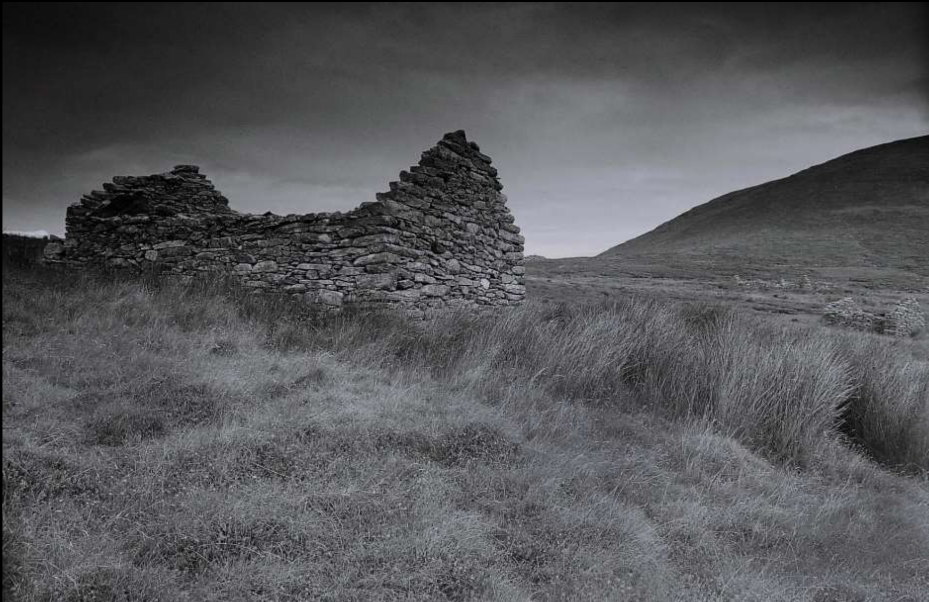
"The Deserted Village", Achill Island, County Mayo, 8