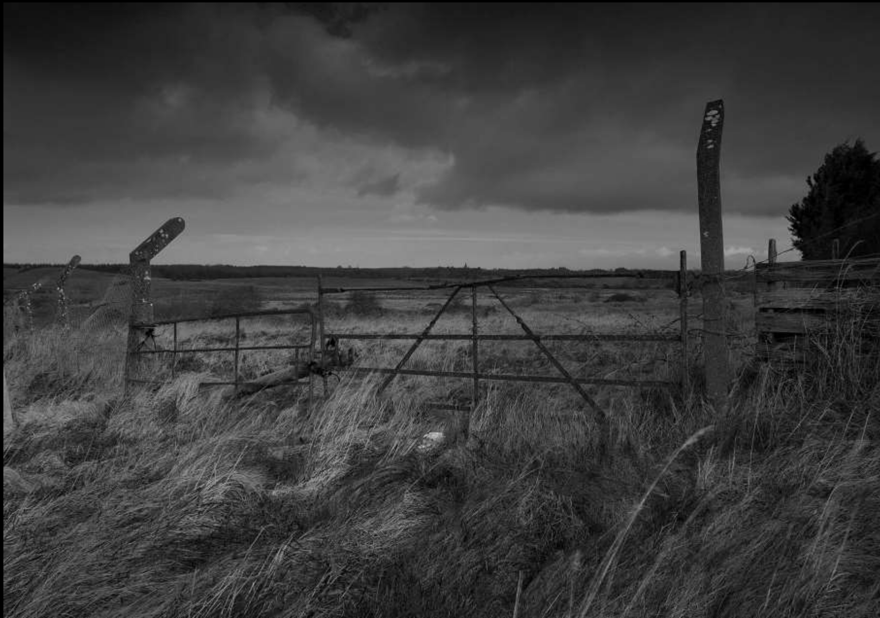
Famine burial site, New Inn, County Galway