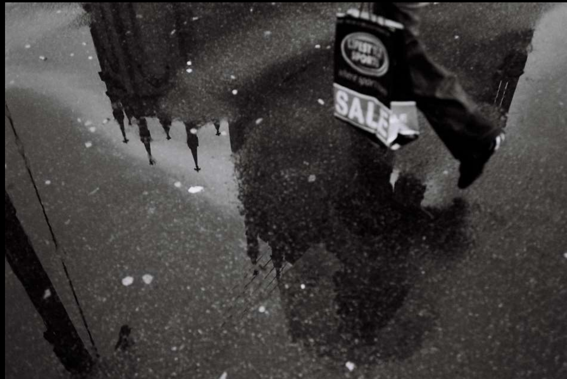
St. Mary's Cathedral, Kilkenny Town, County Kilkenny