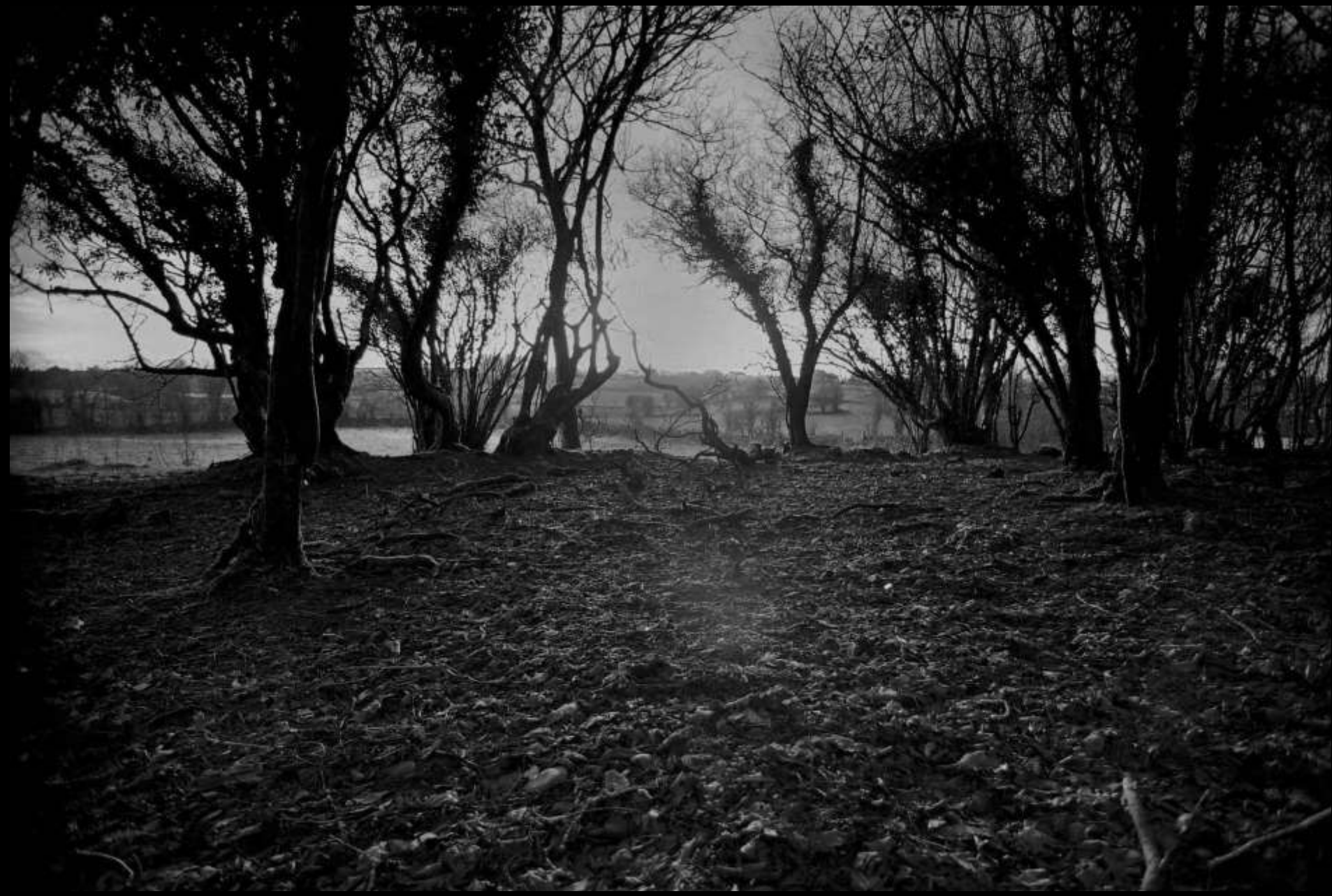
Shanvaghera burial site, Knock, County Mayo, 2