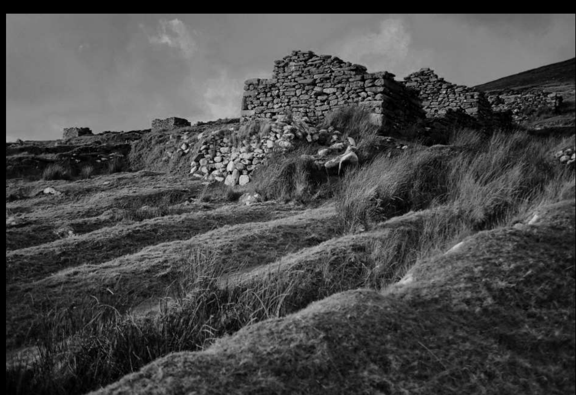
"The Deserted Village", Achill Island, County Mayo, 4