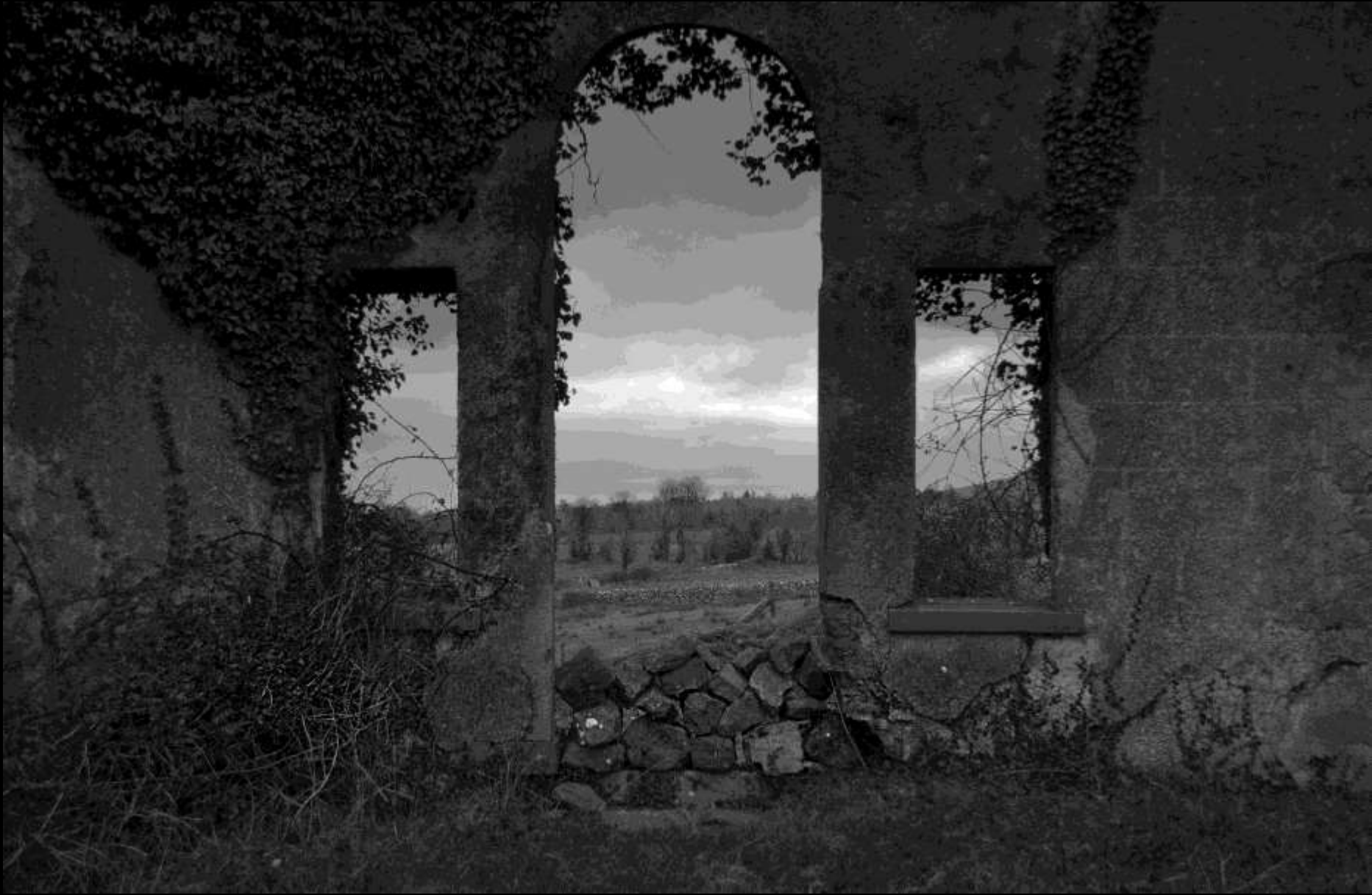
Casteldaly Castle, Casteldaly, County Galway