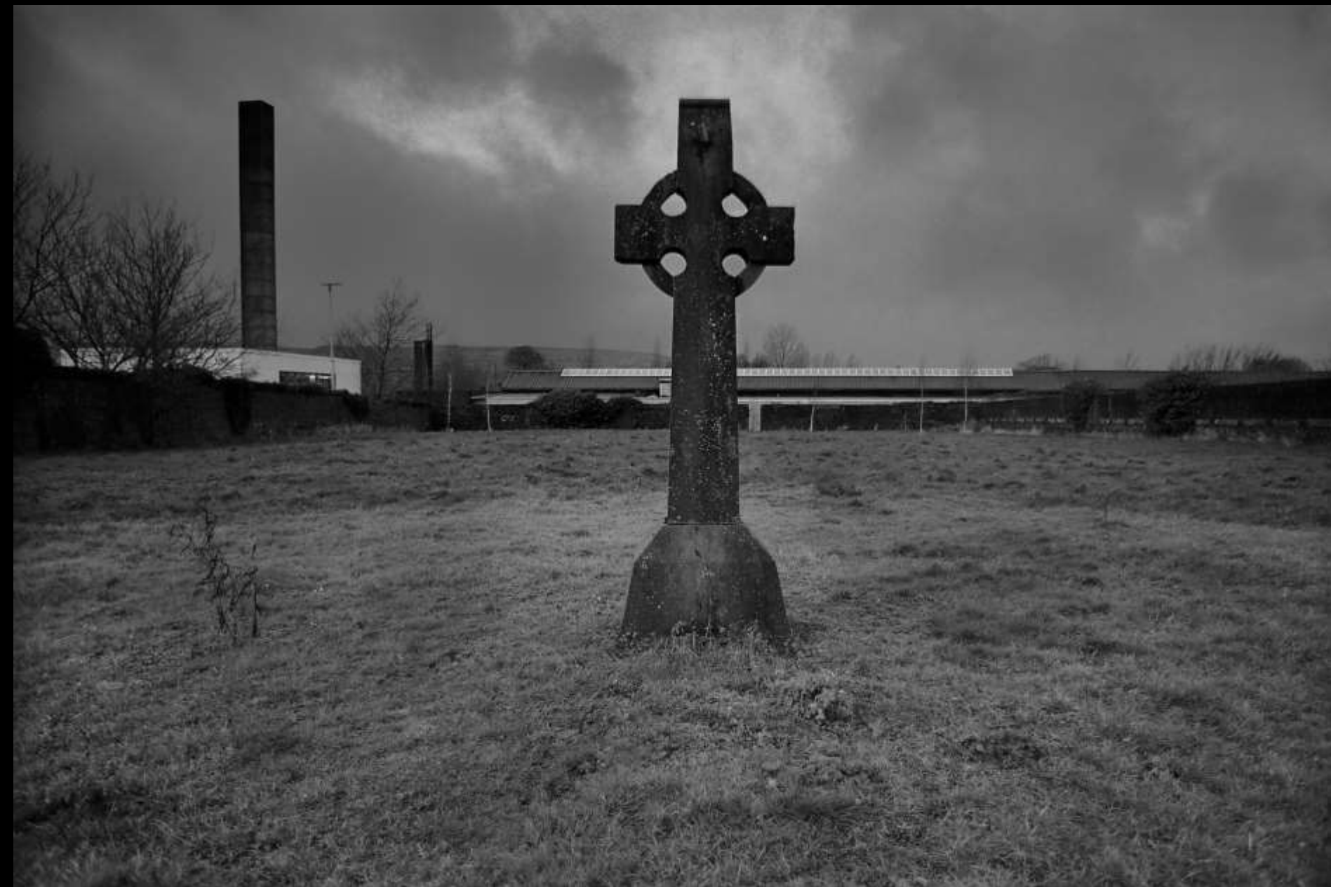
Carlow Workhouse and Famine Graveyard, Carlow Town, County Carlow