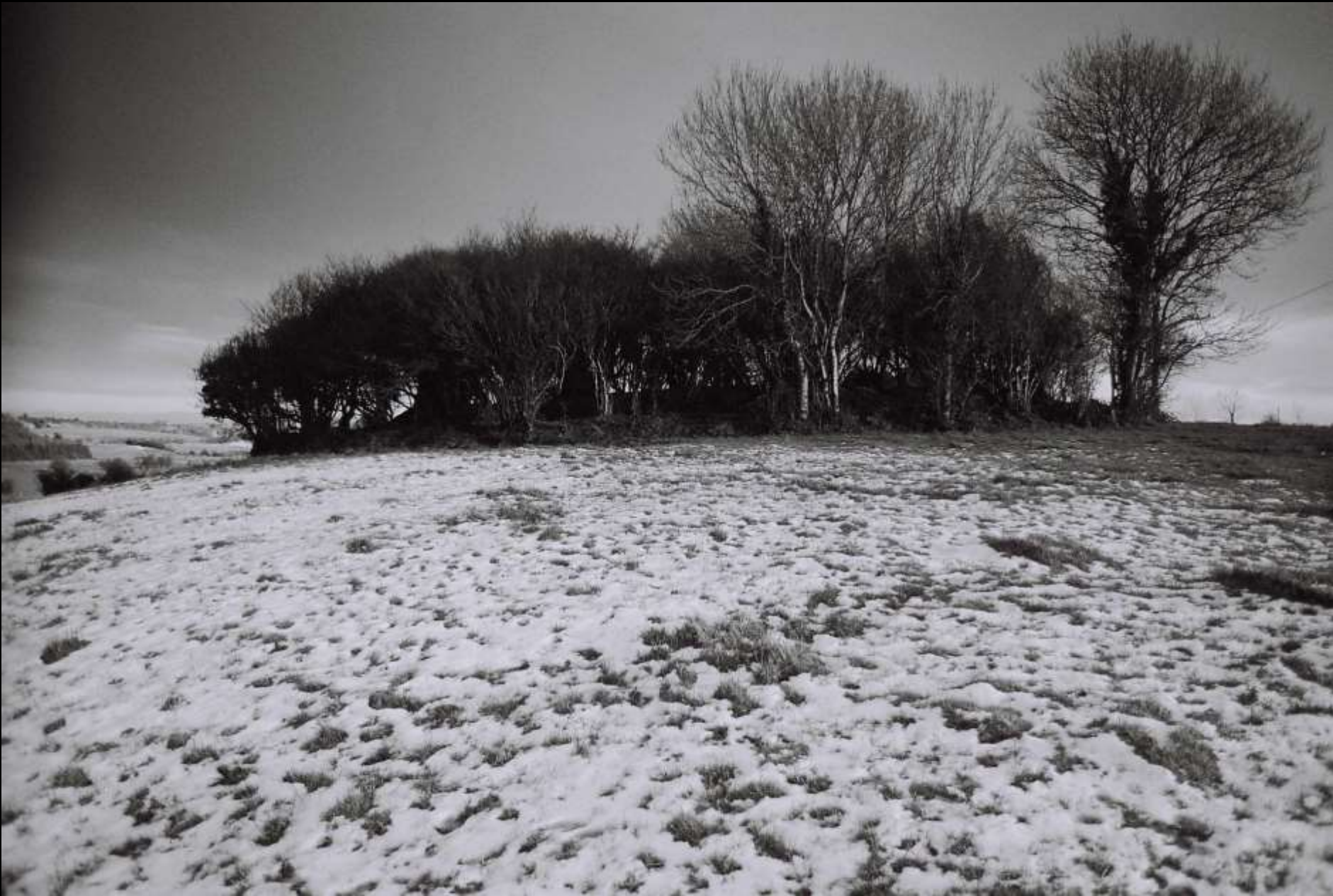
Shanvaghera burial site, Knock, County Mayo, 1