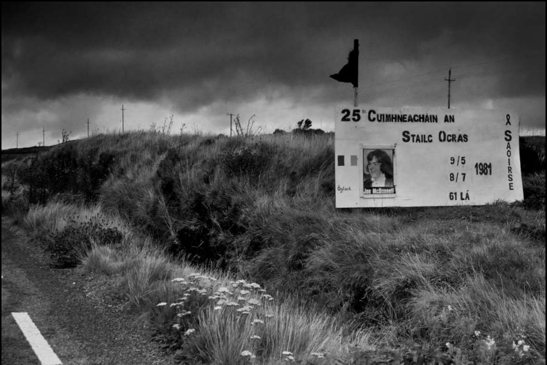
Roadside memorial commemorating the 1981 Hunger Strikes, County Donegal, 2