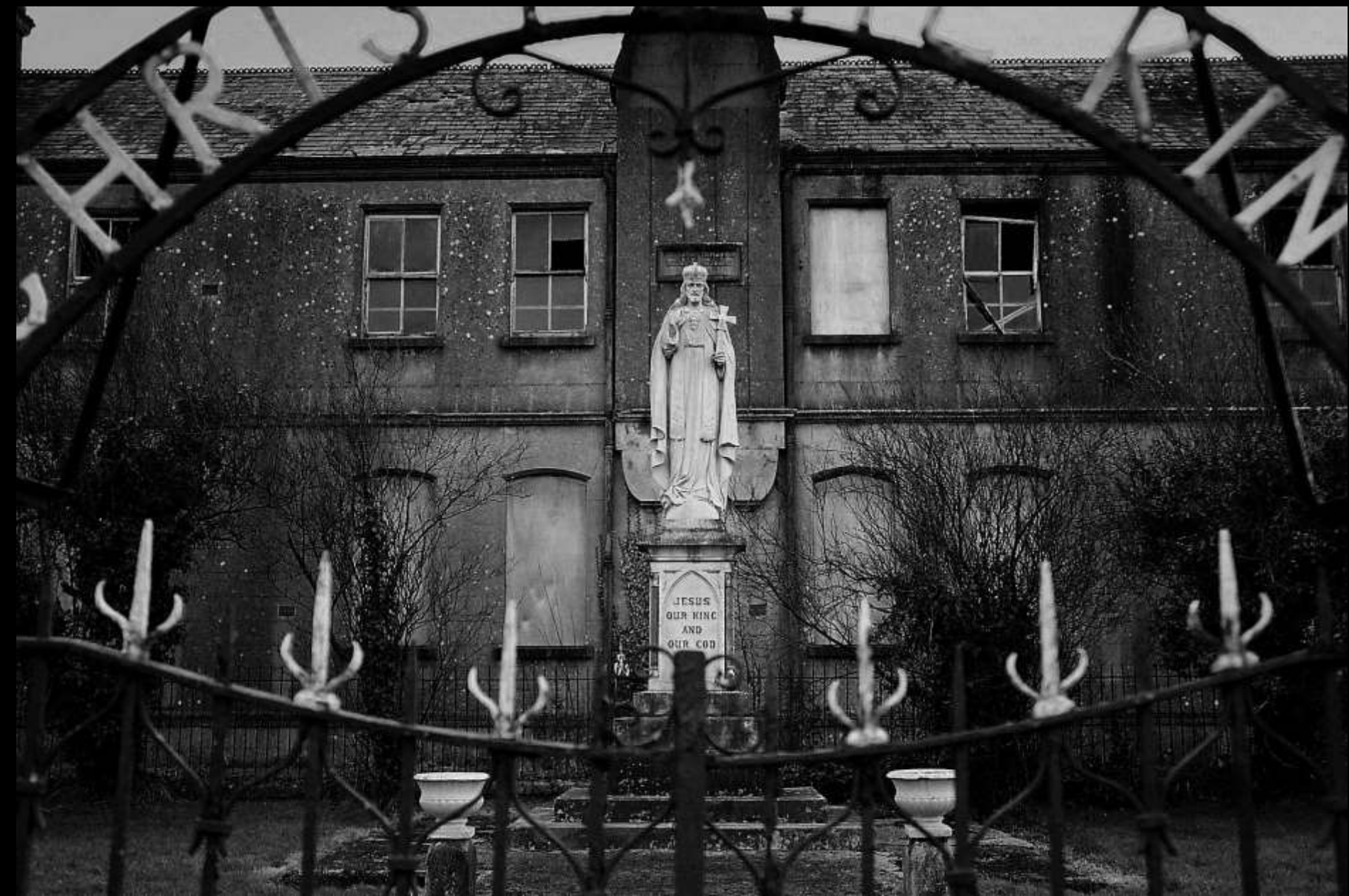
Abandoned school, Castlerea, County Roscommon