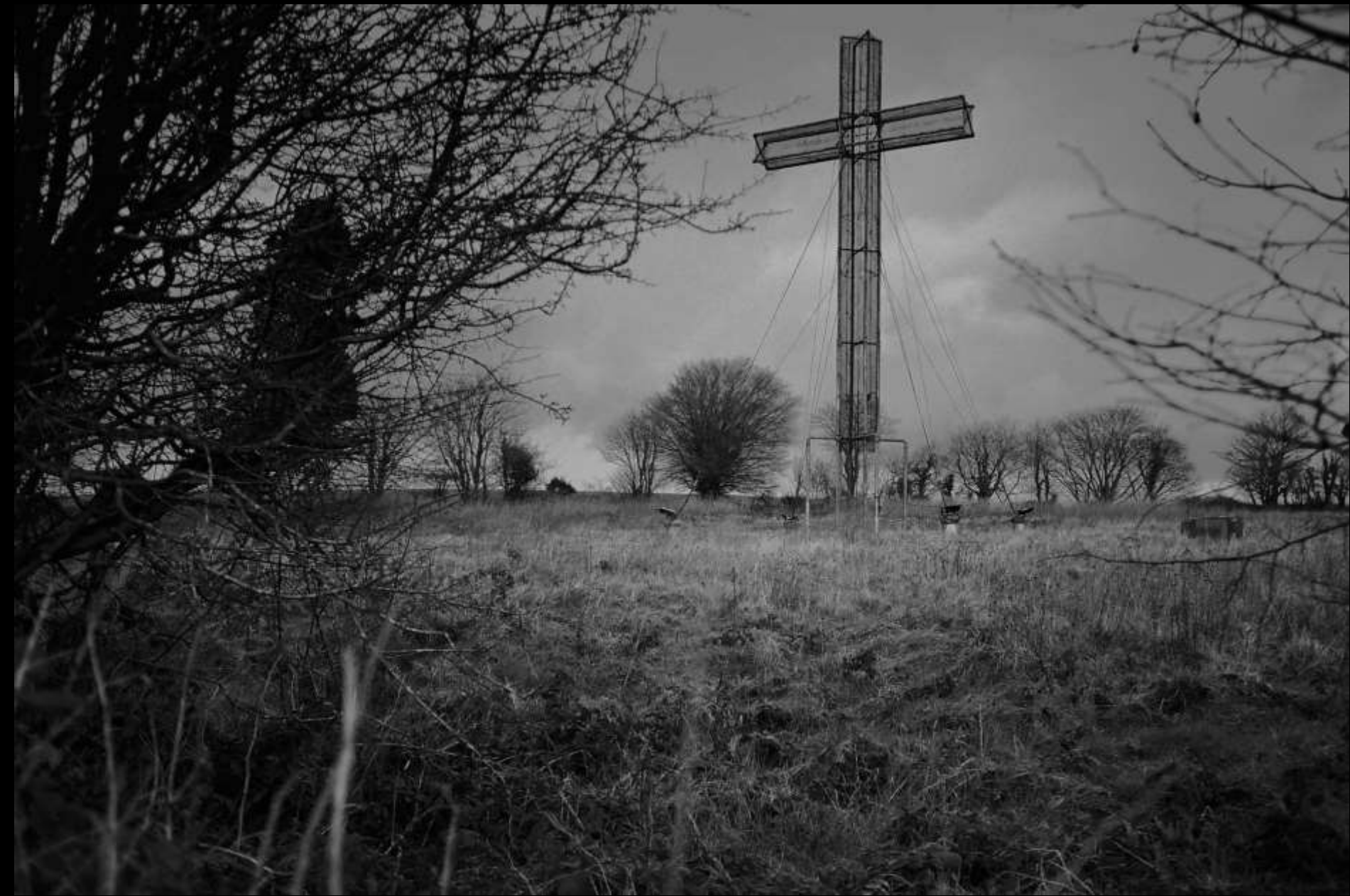
Carr's Hill Famine Graveyard, Moneygurney, County Cork