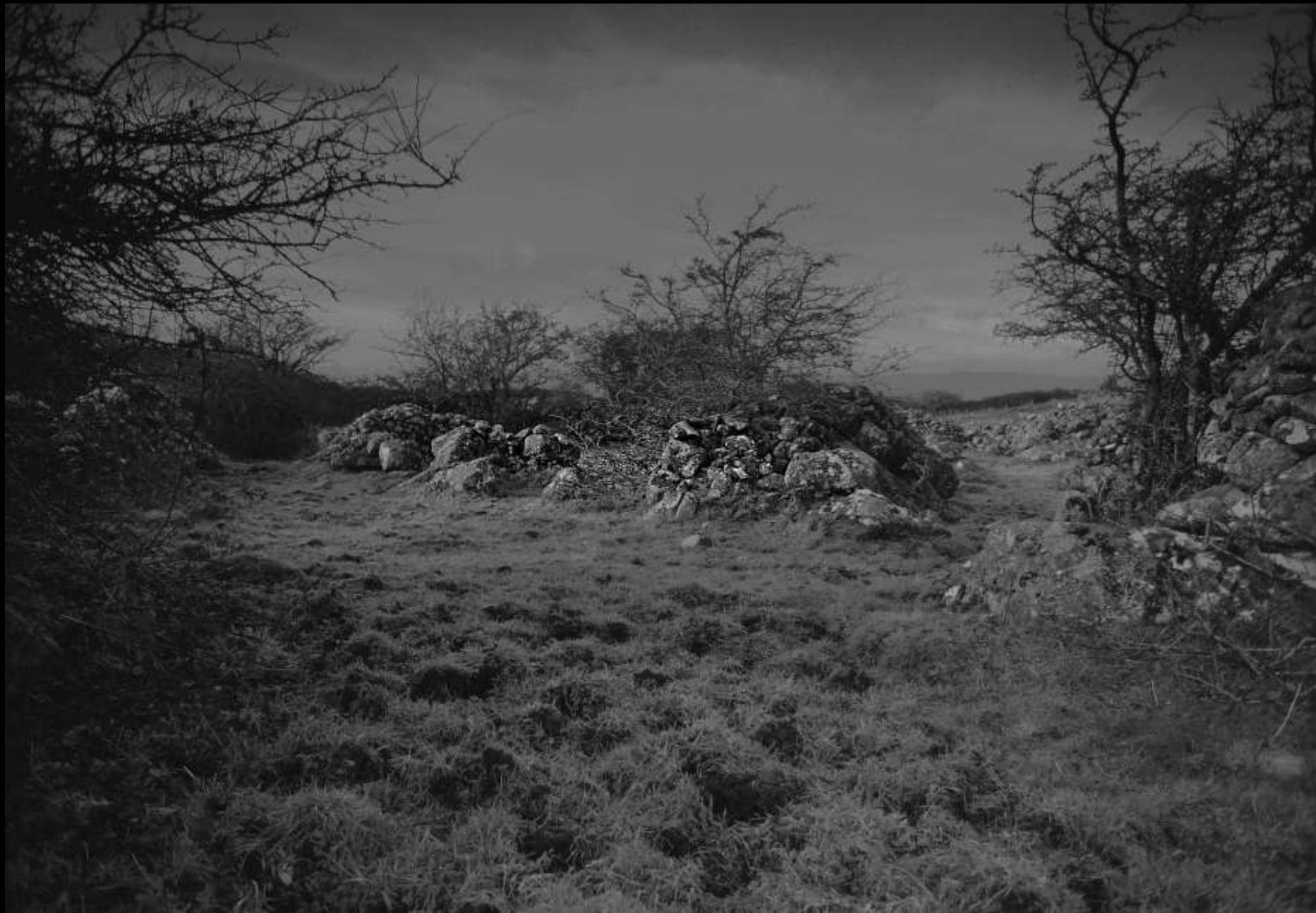
Famine eviction site (cottiers cabin), Tonabrocky, County Galway