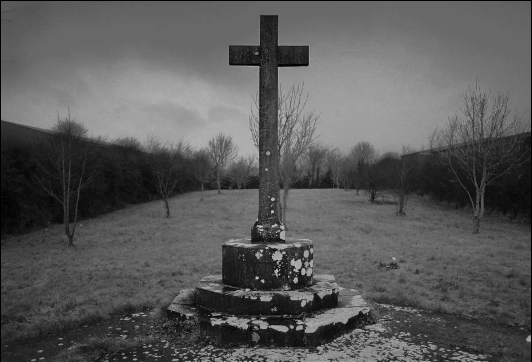
Newcastle West Workhouse and Famine Graveyard, Newcastle West, County Limerick