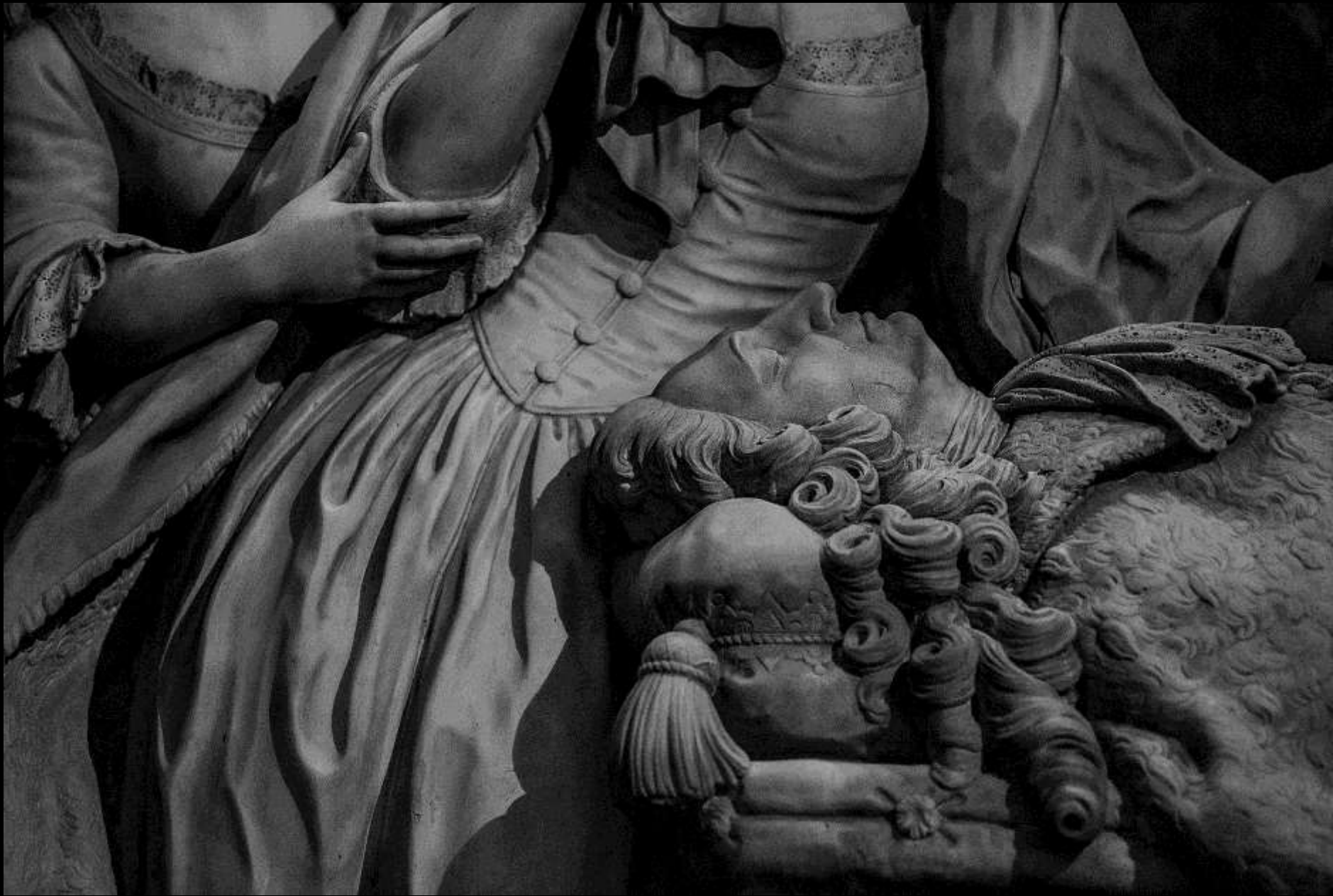
Robert 19th Earl of Kildare, Christchurch Cathedral, Dublin