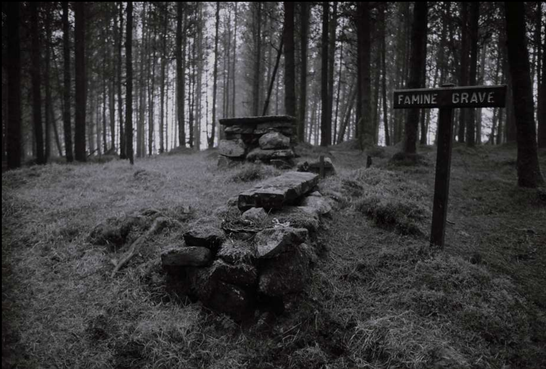
Famine grave, Kilronan Mountain, County Roscommon, 2