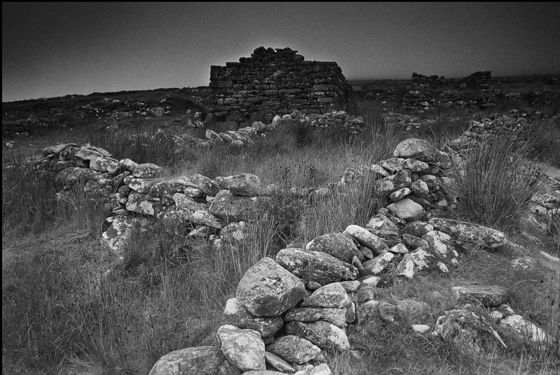
"The Deserted Village", Achill Island, County Mayo, 7