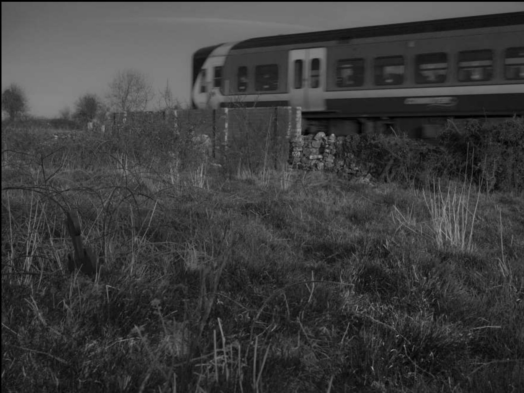
Lavallylisheen Graveyard (Famine burial site), Gort, County Galway