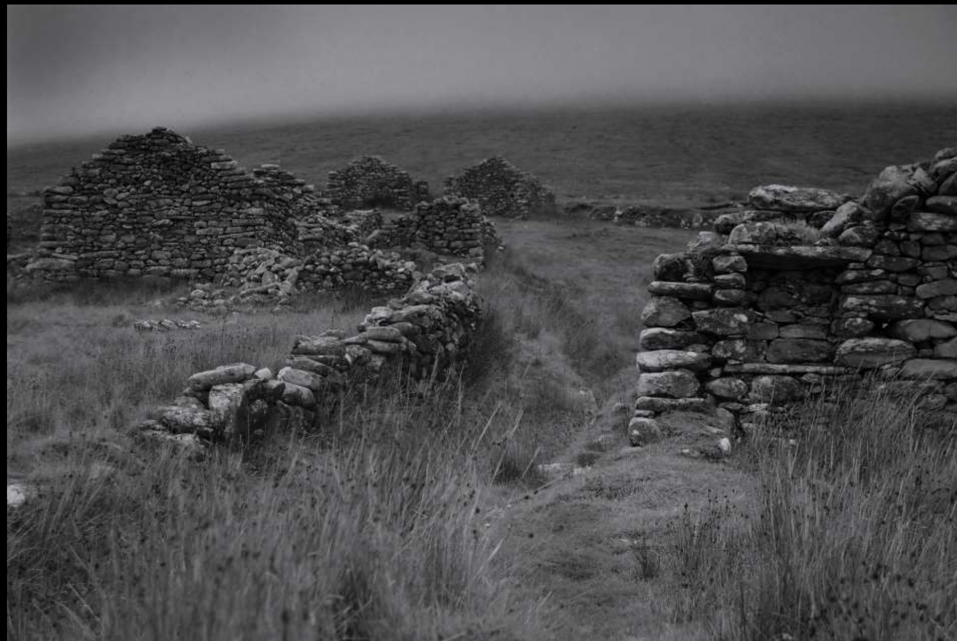
"The Deserted Village", Achill Island, County Mayo, 1