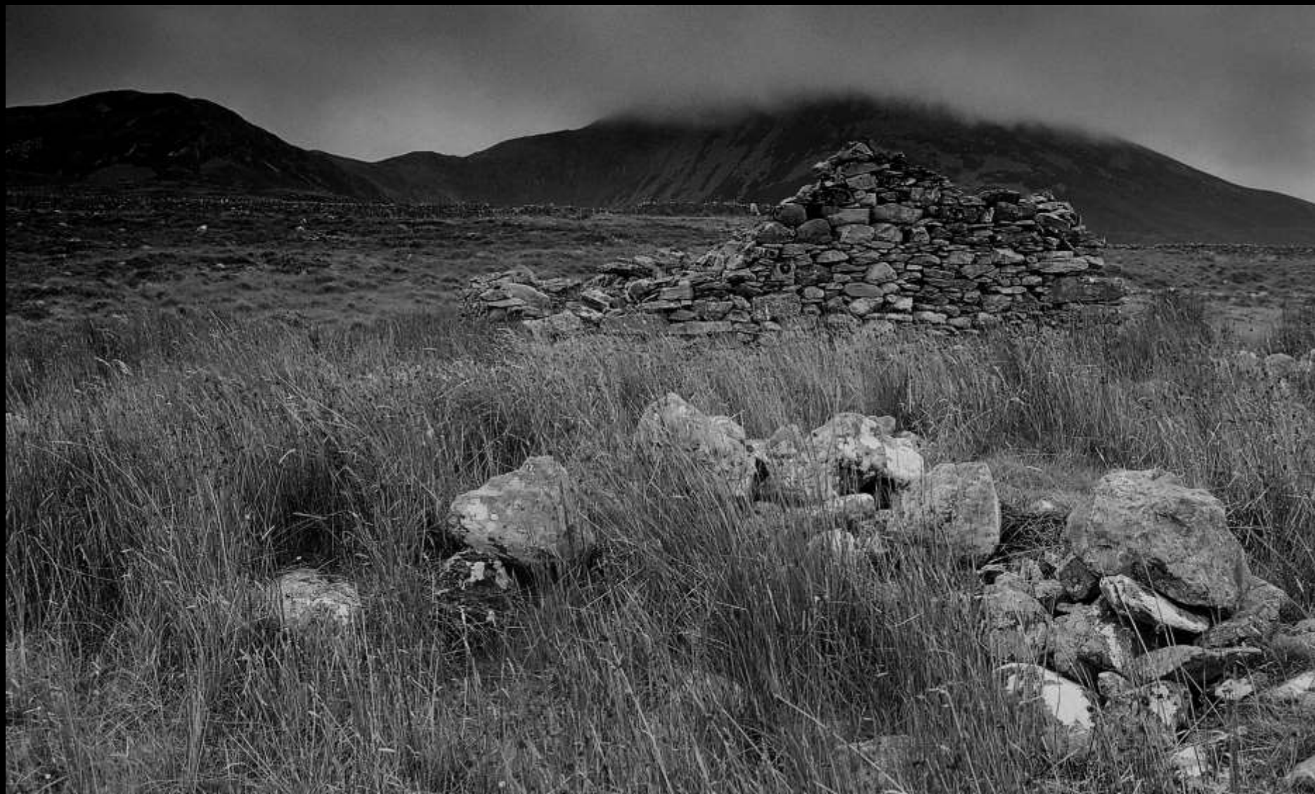
Cabin ruin, Croagh Patrick, County Mayo