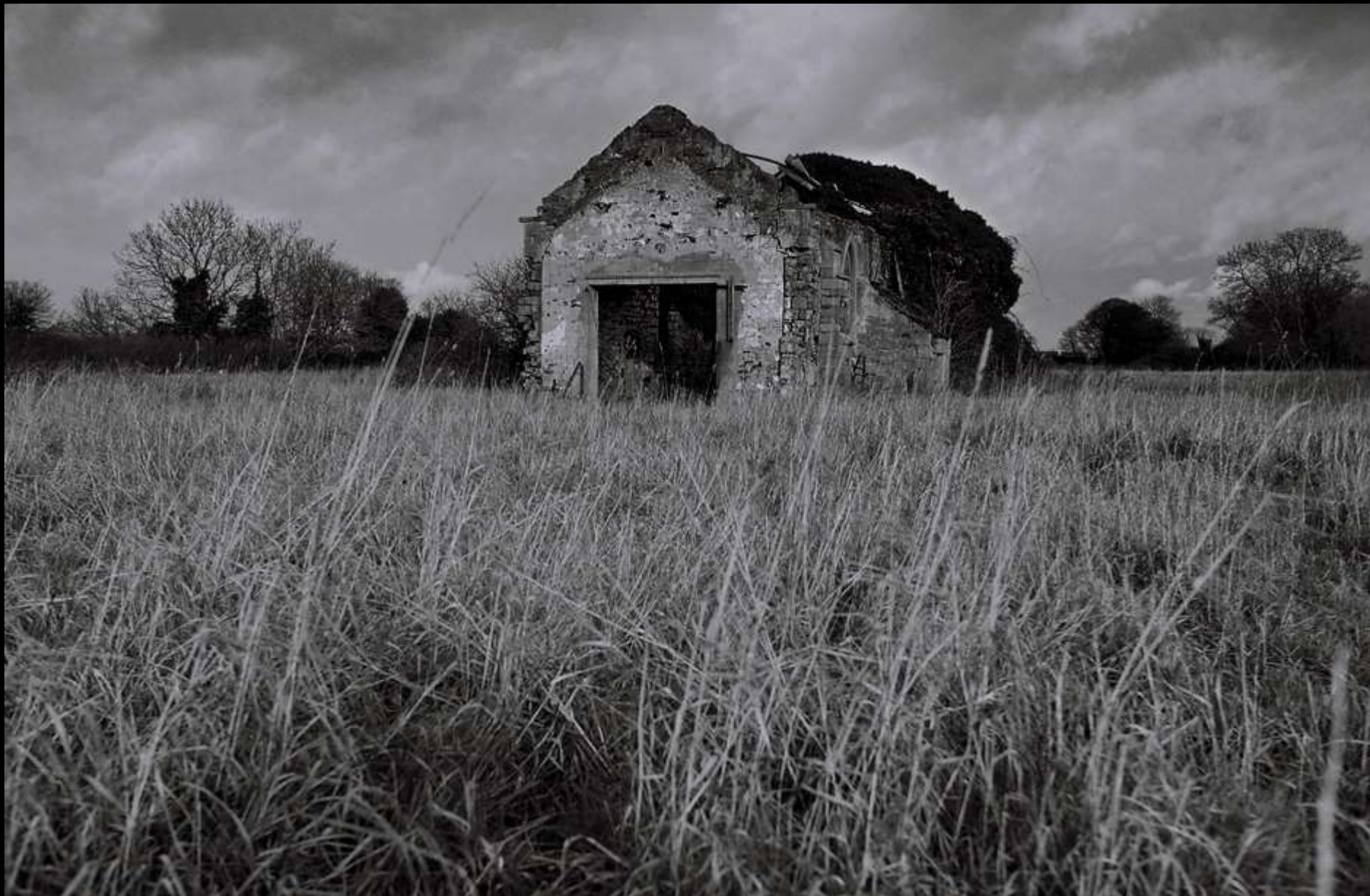
Balrothery Workhouse, County Dublin, 1