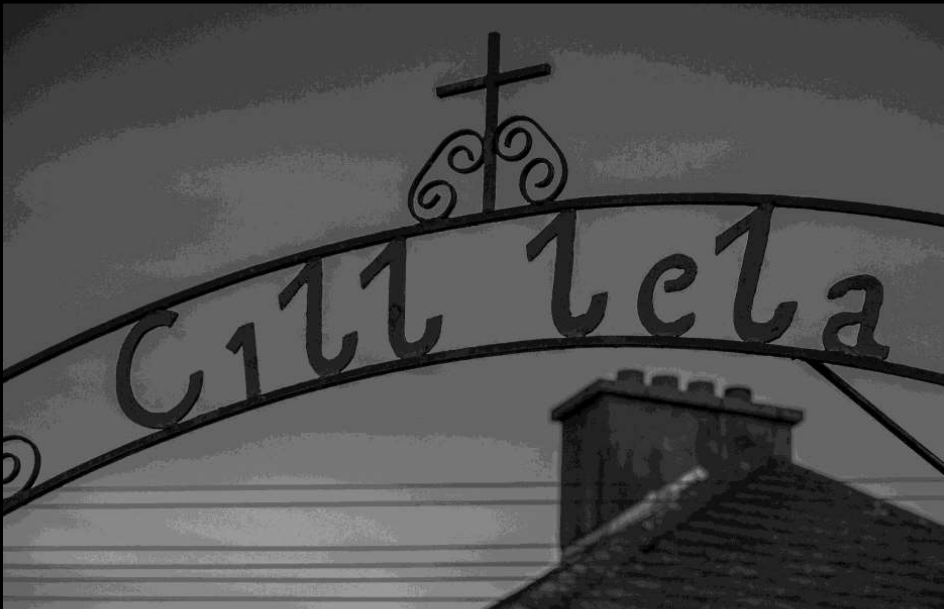
Kileely Graveyard (Famine burial site), Moyross, County Limerick