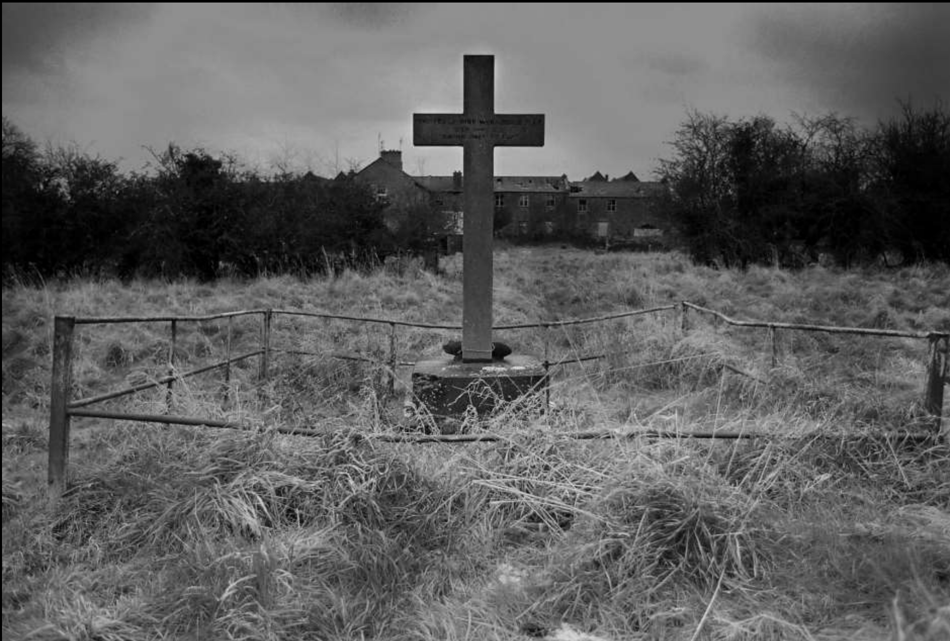
Birr Workhouse and Famine Graveyard, Birr, County Offaly