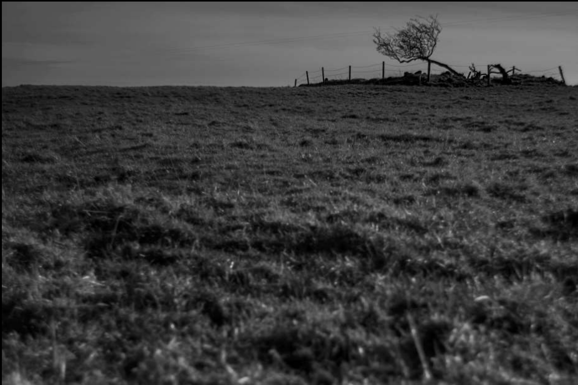
Famine burial site, Stonepark South, County Roscommon