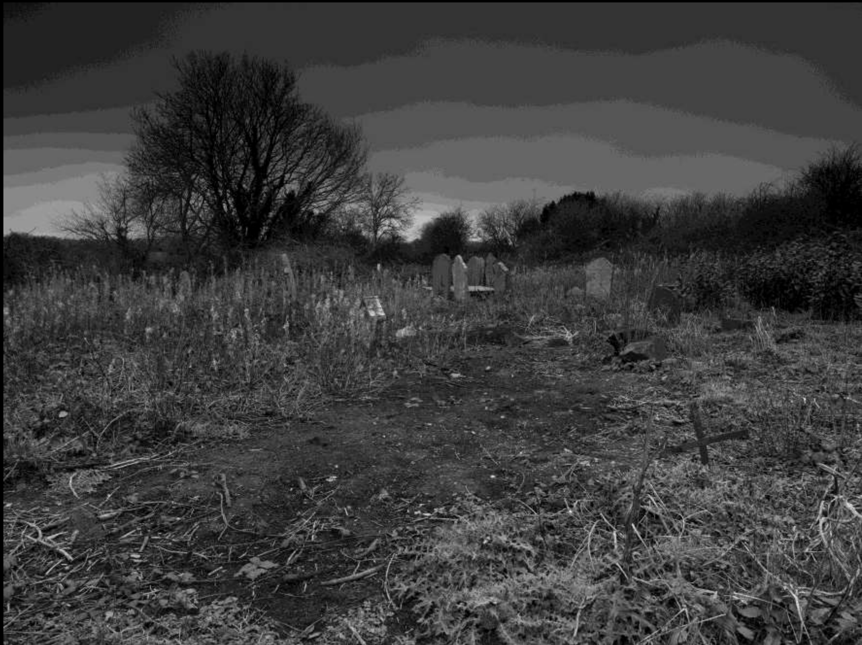
Clonattin Graveyard (Famine burial site), Gorey, County Wexford