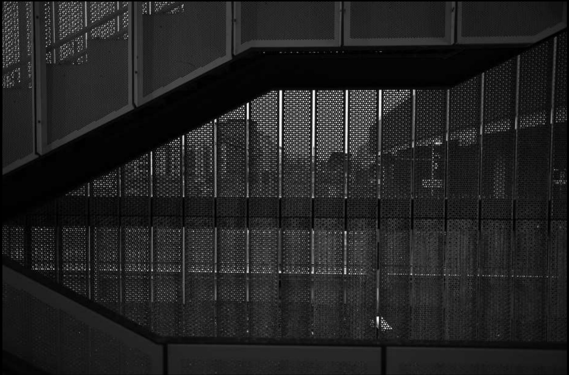
Dart Station, Clongriffin Village Centre (Ghost Estate), Dublin