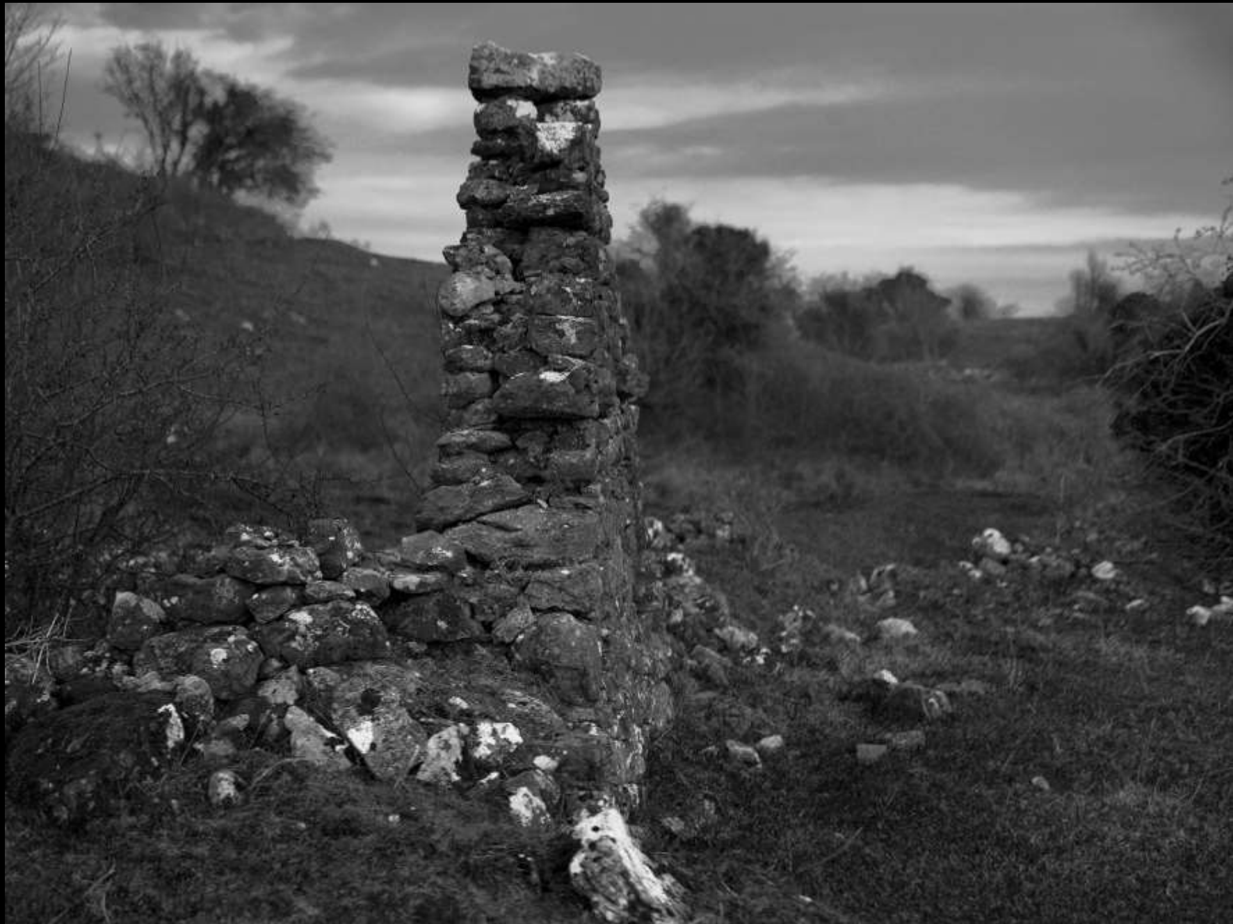
Famine eviction site, Carn, Killare, County Westmeath, 1