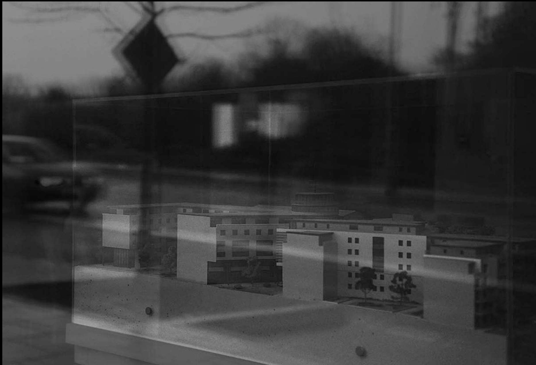
Abandoned real estate office, Clongriffin Village Centre (Ghost Estate), Dublin