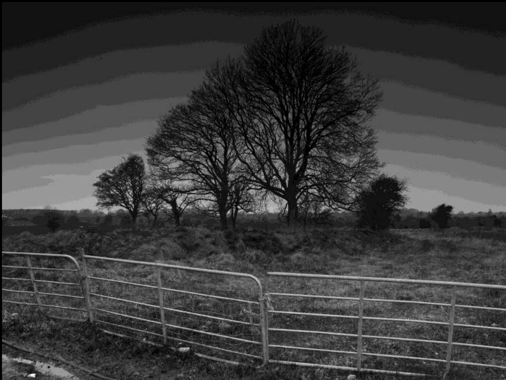
Famine burial site, Brooke Lodge, County Galway