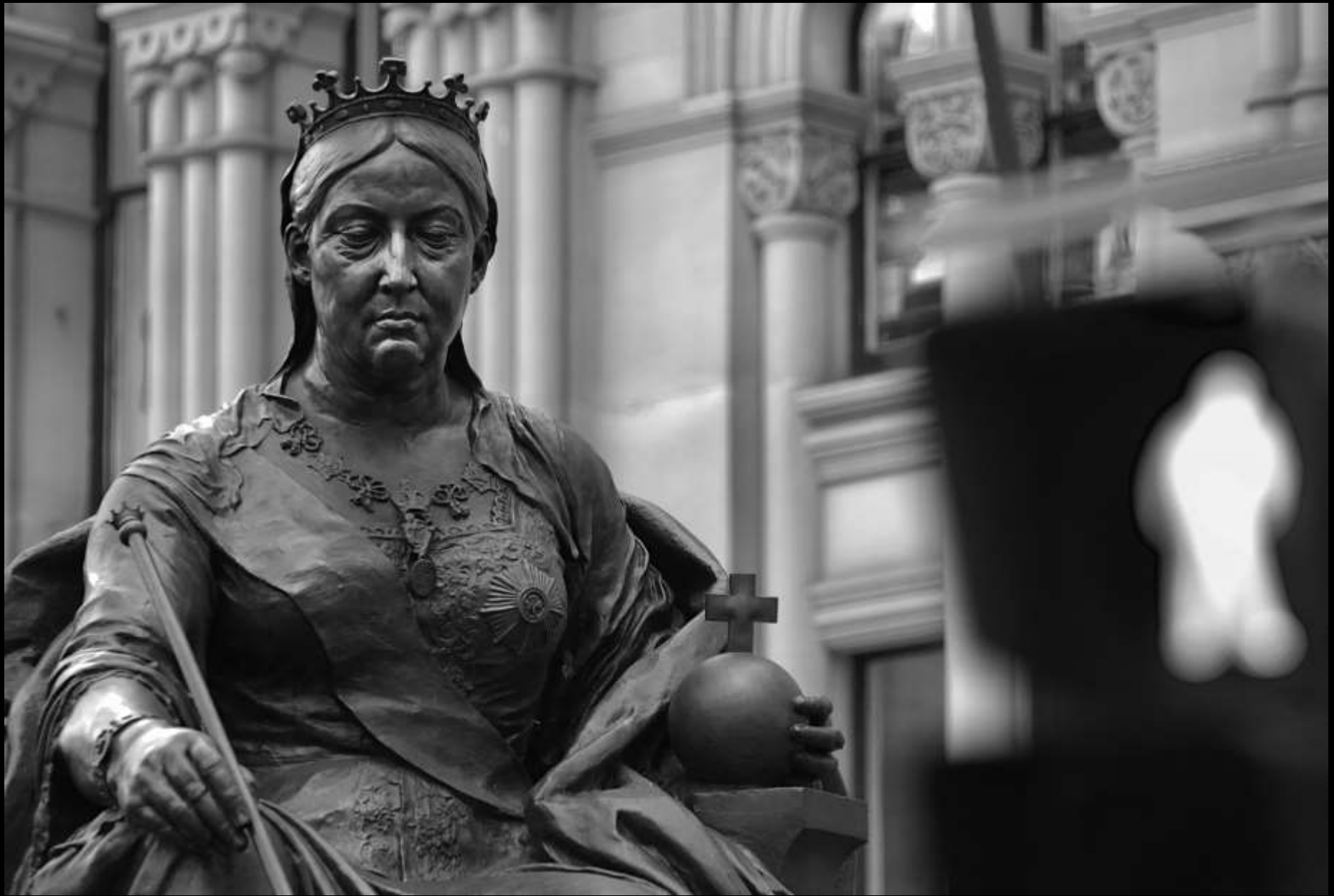
Pax Victoriana (formerly at Leinster House in Dublin), Sydney, New South Wales