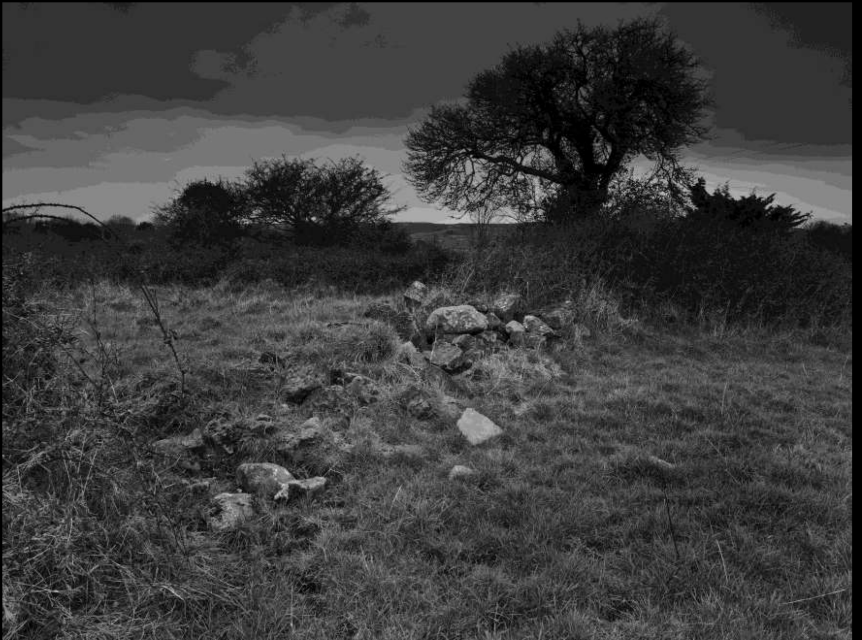
The Crag Graveyard (Famine burial site), Clonconnane, County Limerick