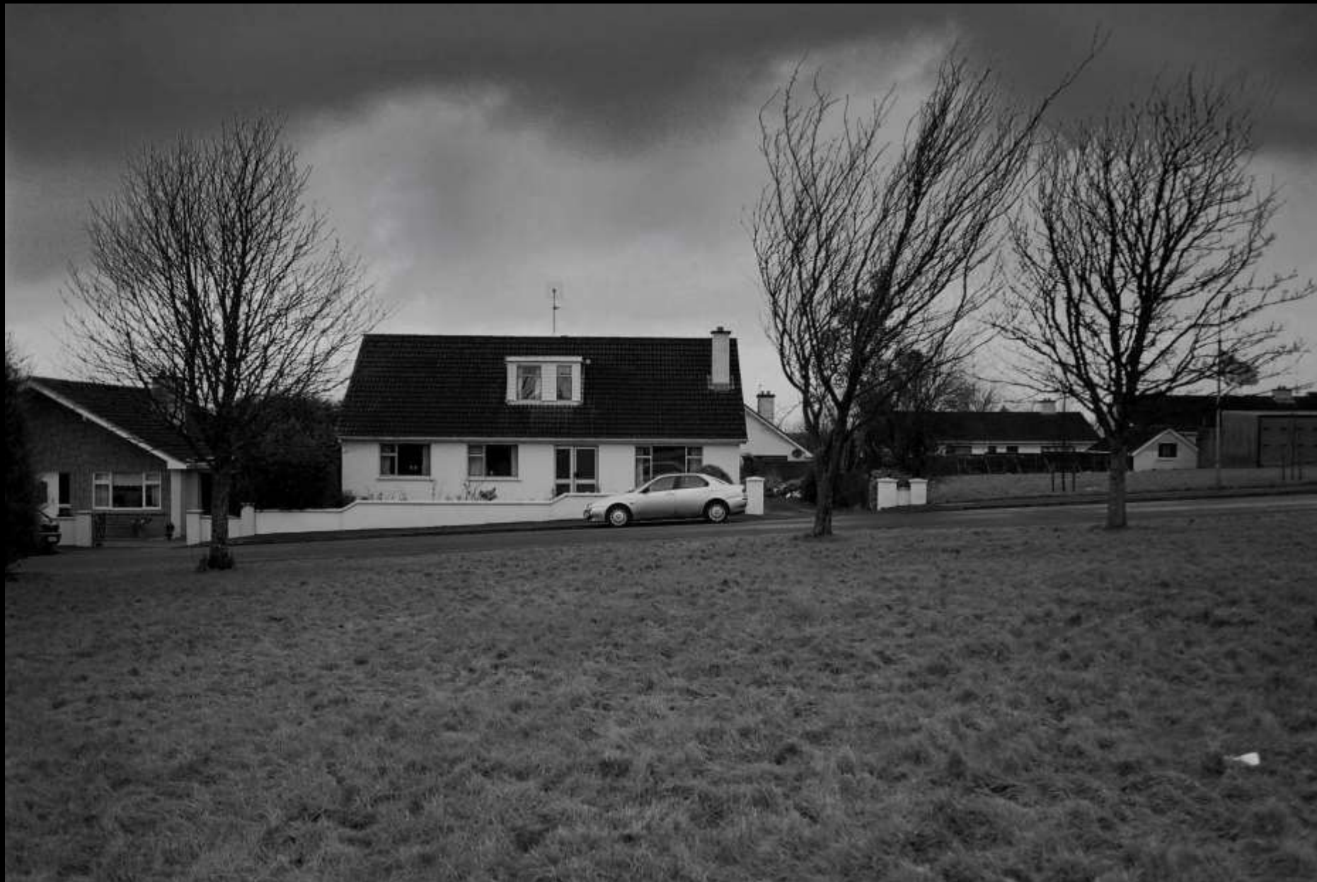
Castlerea Workhouse and Famine Graveyard, Castlerea, County Roscommon