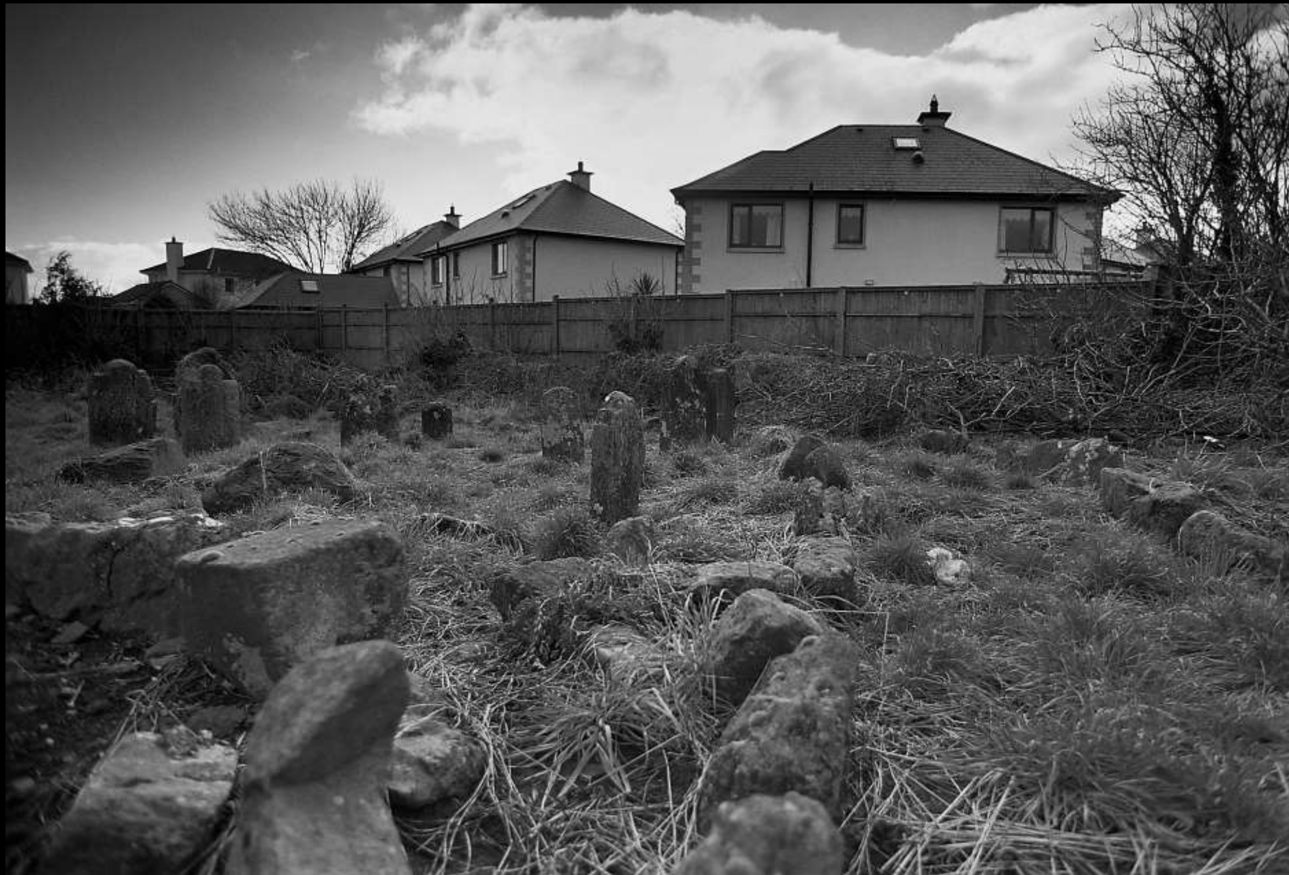
Kilrush Famine Graveyard, Dungarvan, County Waterford