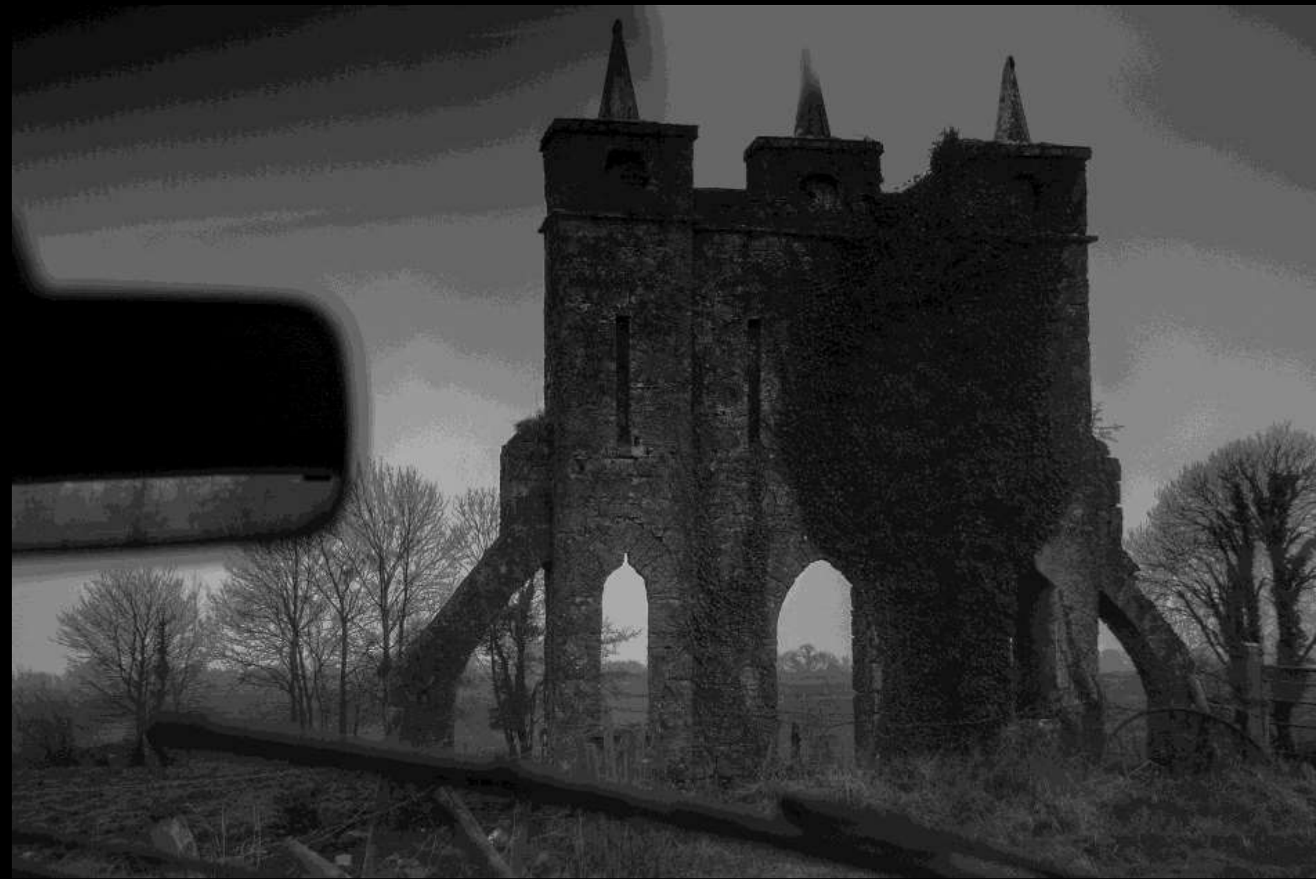
The Bellevue Folly (eye-catcher), Lawrencetown, County Galway