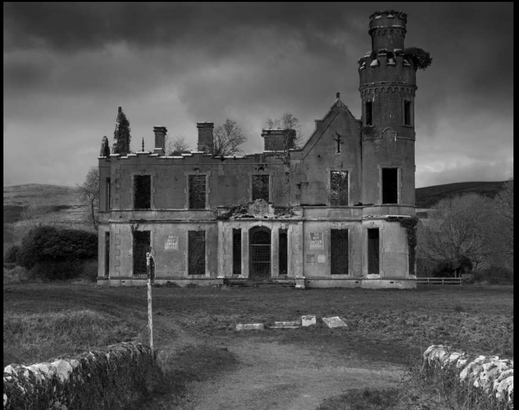
Ardtully Castle, Ardtully Demesne, County Kerry