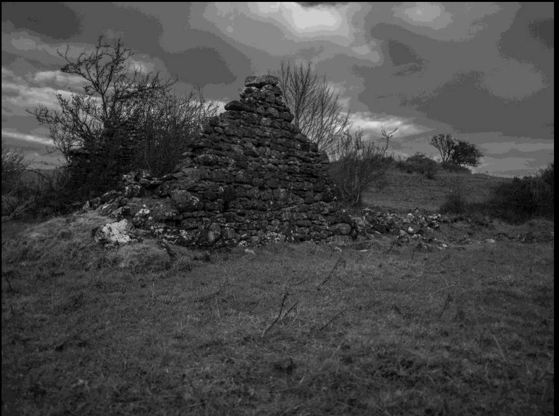
Famine eviction site, Carn, Killare, County Westmeath, 2