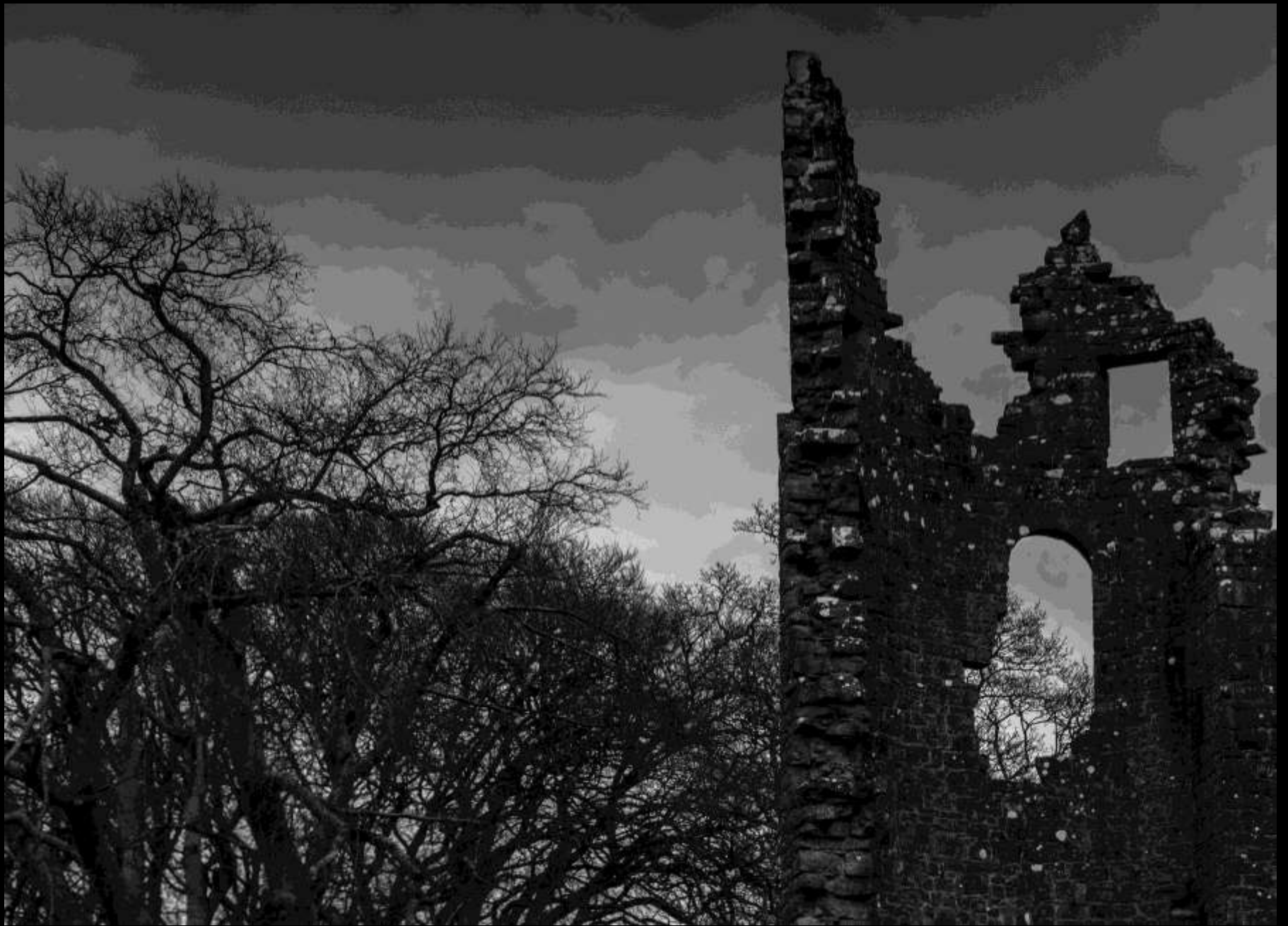
The "Jealous Wall" (Architectural folly), Belvedere House, County Westmeath, 1