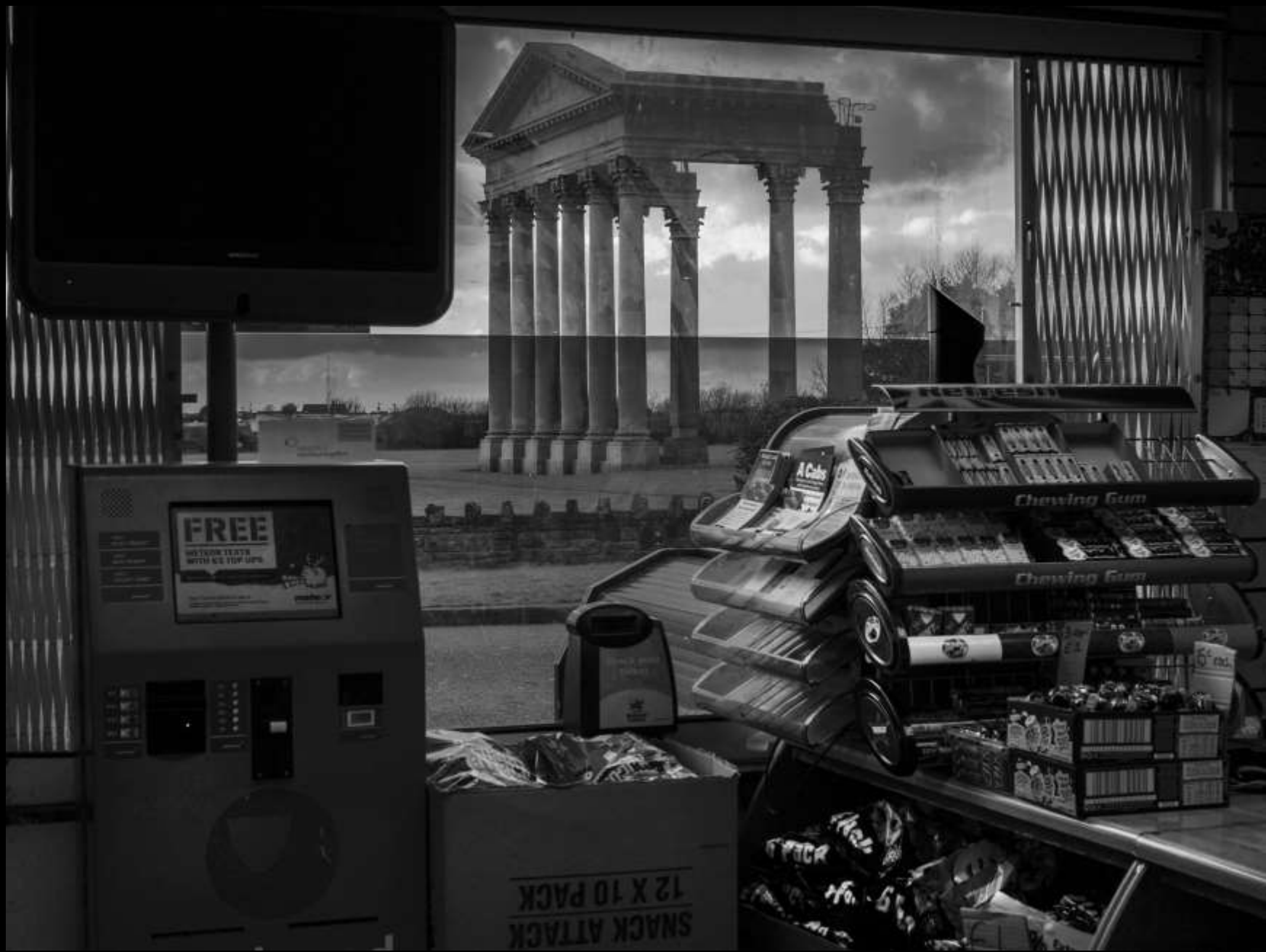
Kenure House through the window of Rickard's Delicatessen, Rush, County Dublin