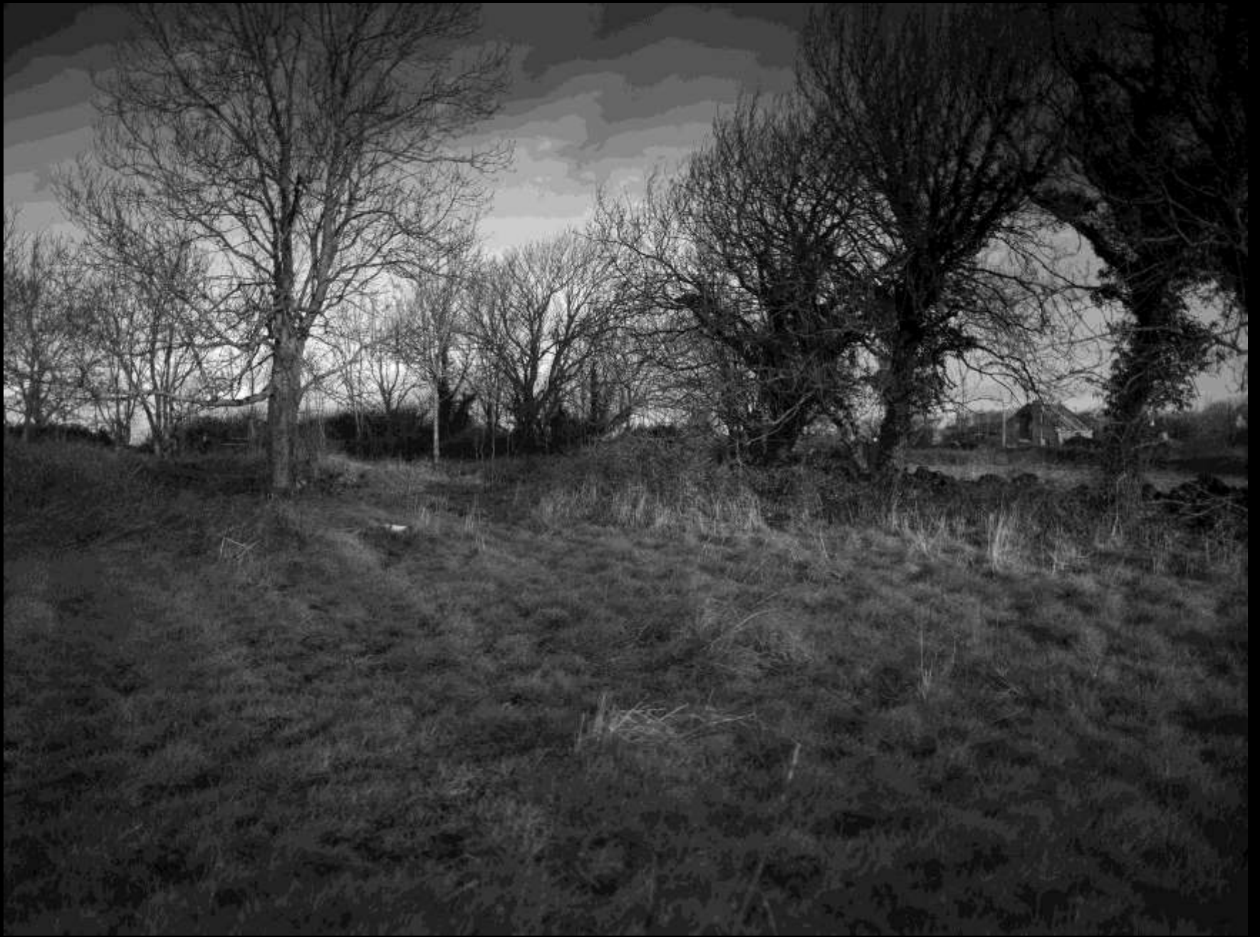
Killeen Graveyard (Famine burial site), Killeenaran, County Galway