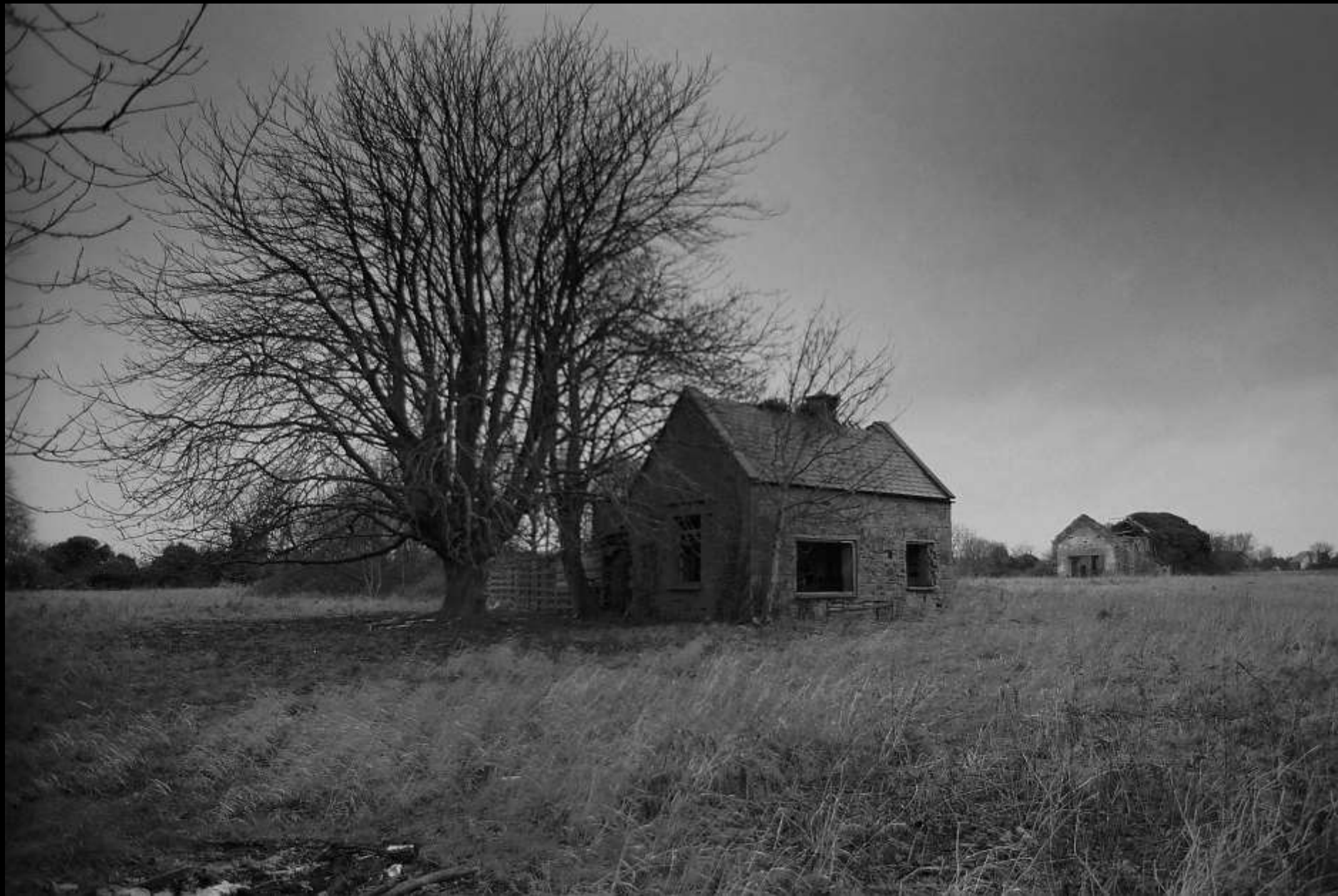
Balrothery Workhouse, County Dublin, 2