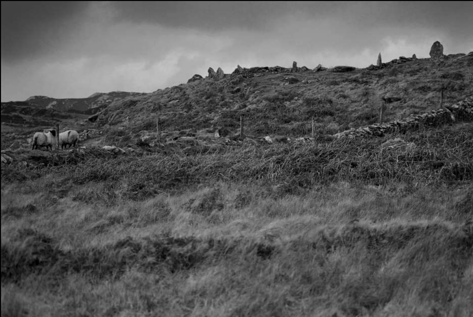
Famine burial site, Carrowgarve, Achill Island, County Mayo