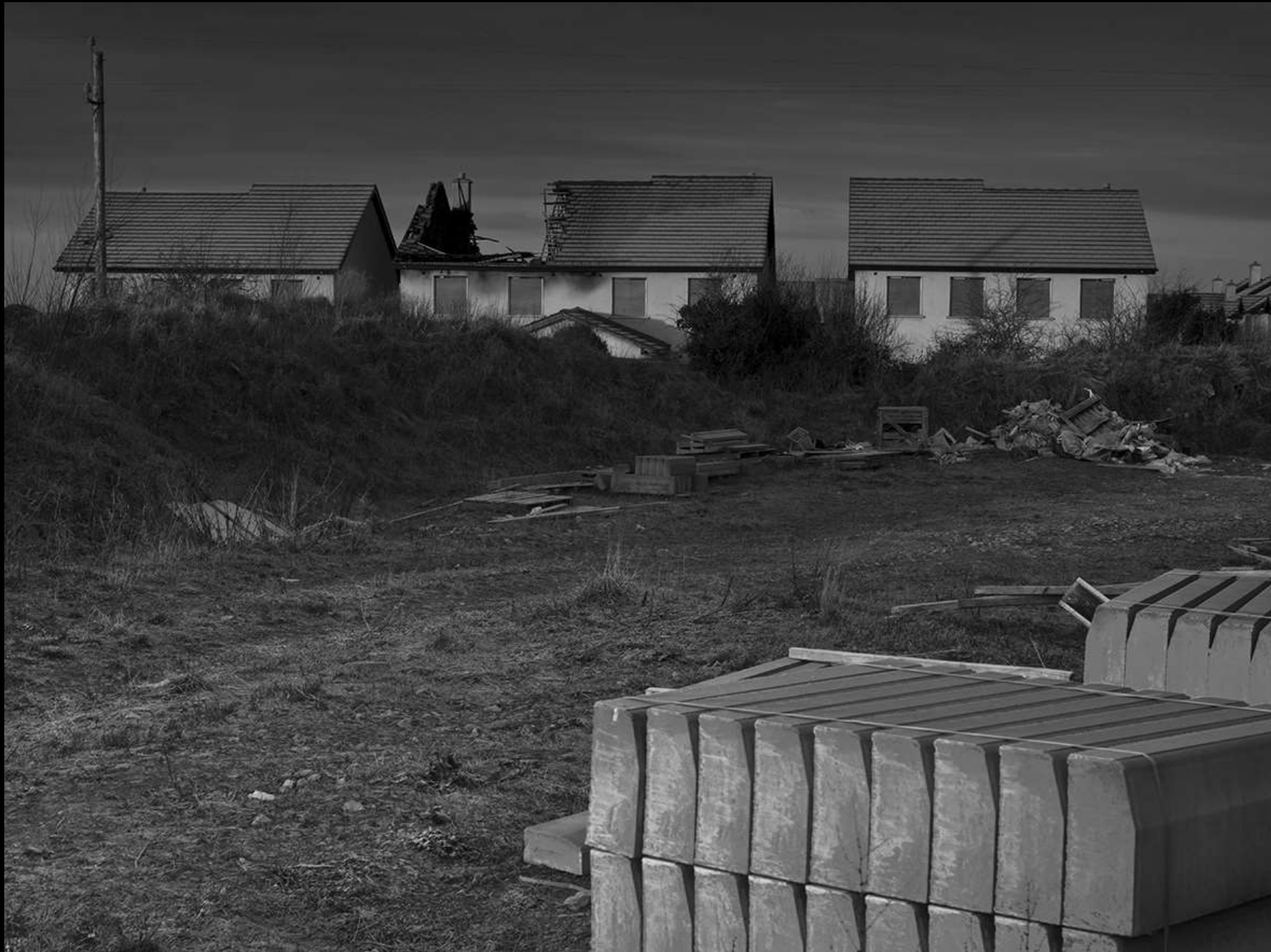
"Cottage Hill" (Ghost Estate), Loughrea, County Galway