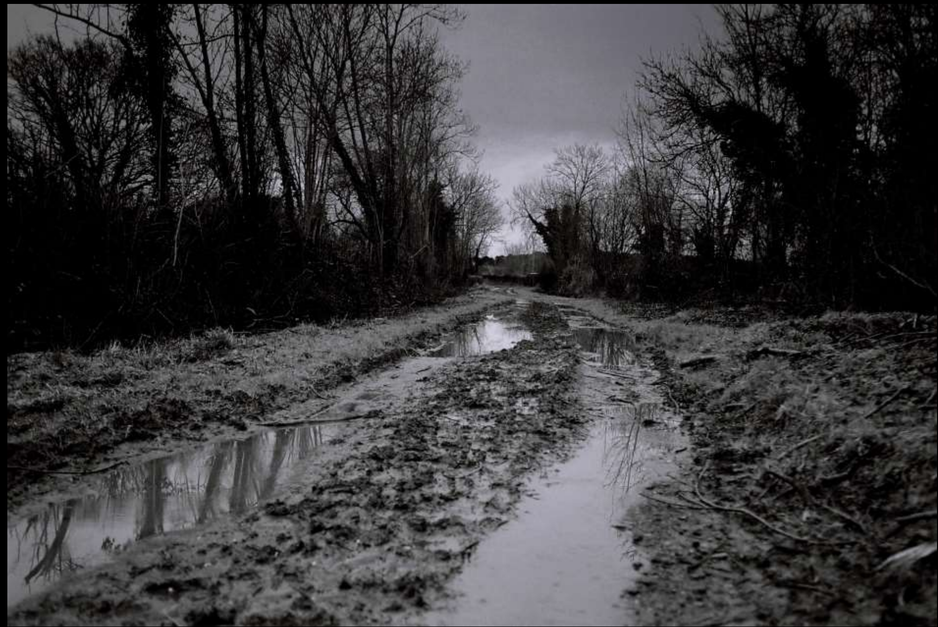
Boreen to the Callan Workhouse and Famine Graveyard, Callan, County Kilkenny