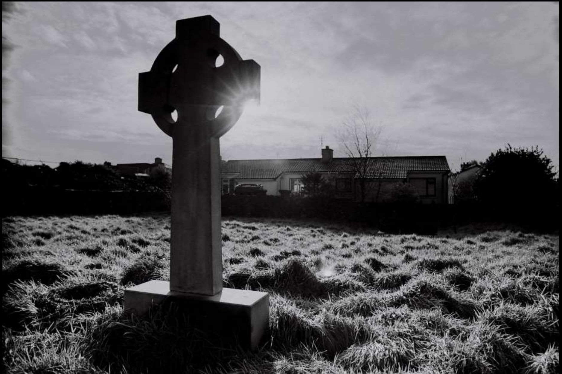
Tubbercurry Workhouse and Famine Graveyard, Tubbercurry, County Sligo