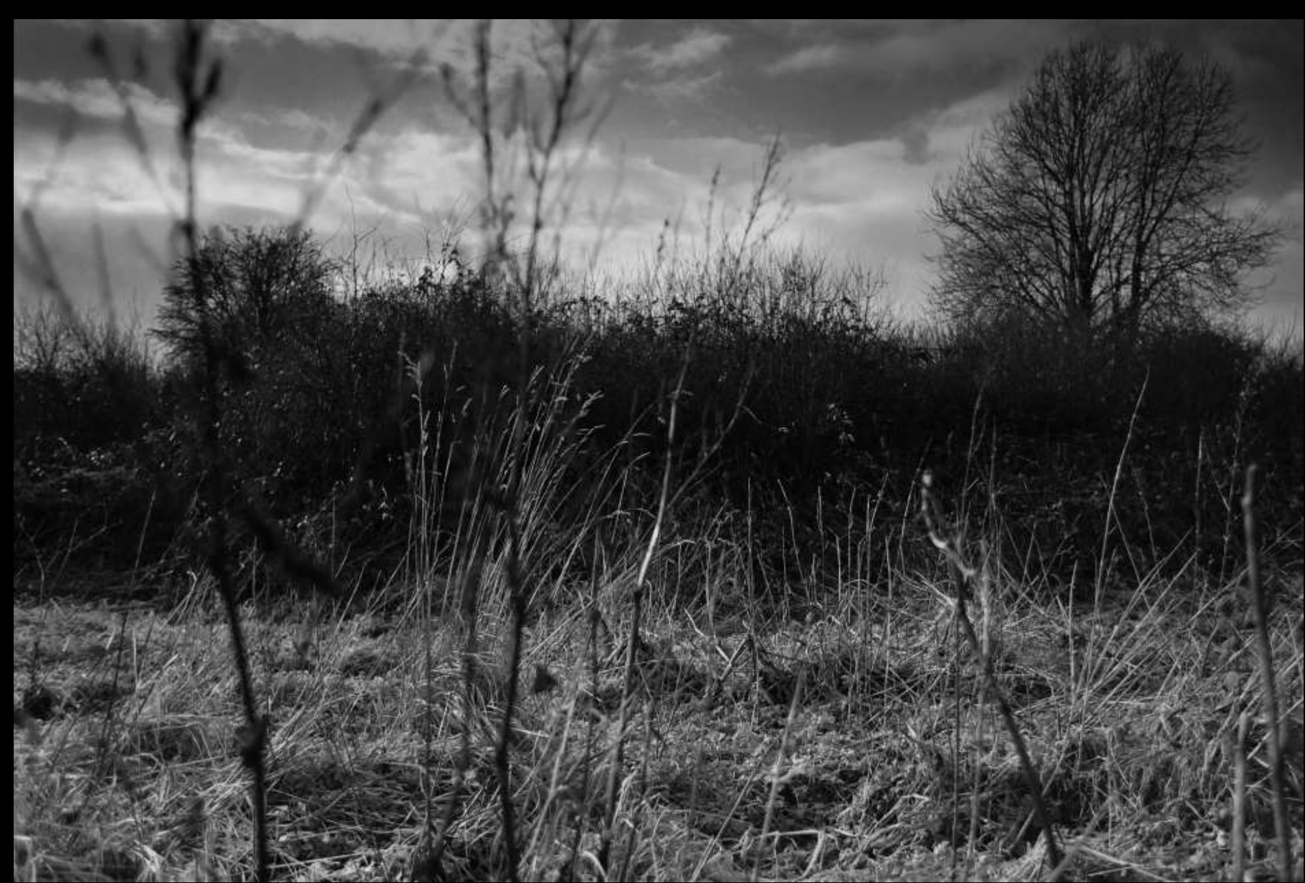
"The Pauper's Plot", (Famine burial site), Strokestown, County Roscommon