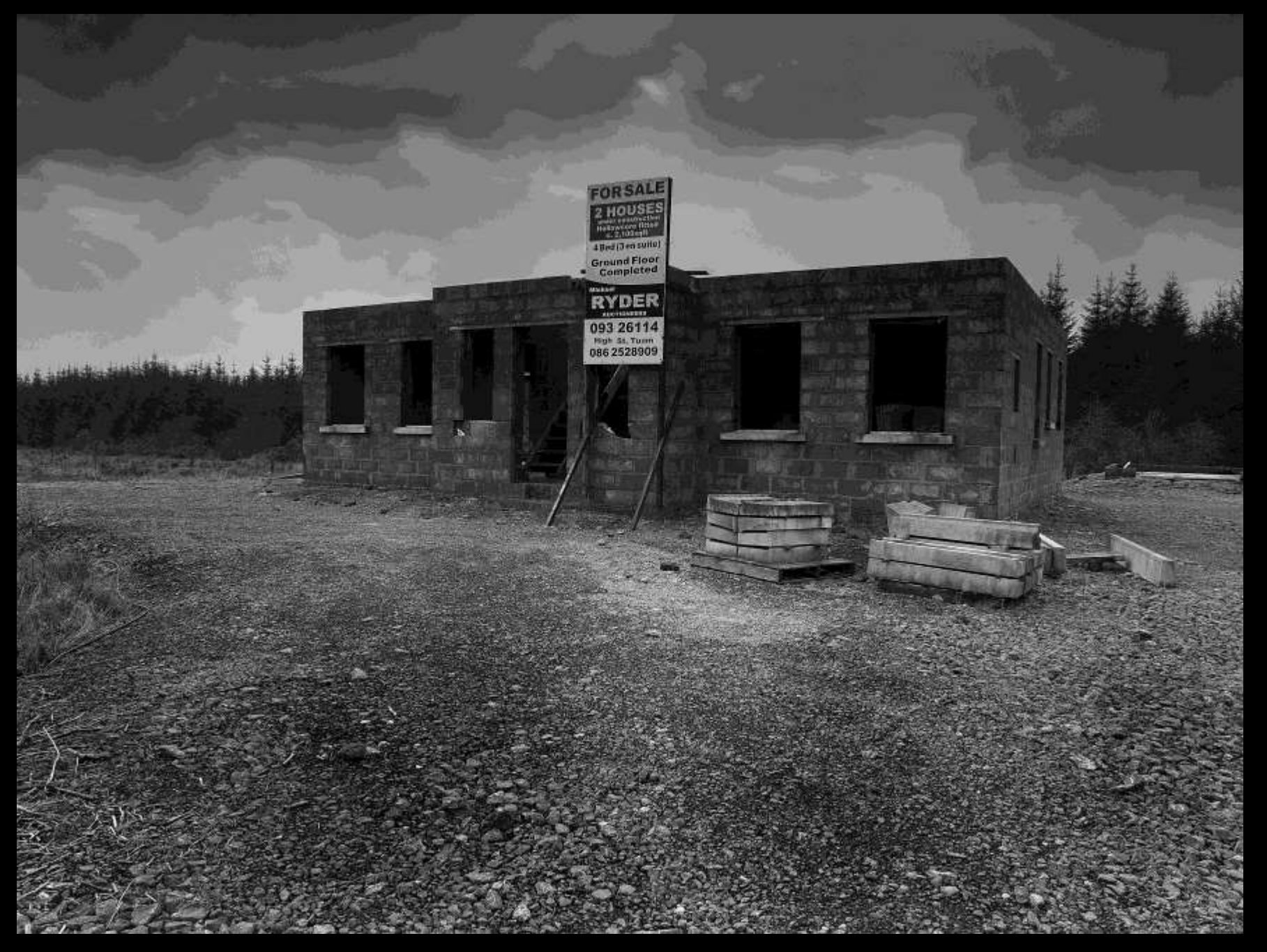
Abandoned bungalow construction, Kilkerrin, County Galway