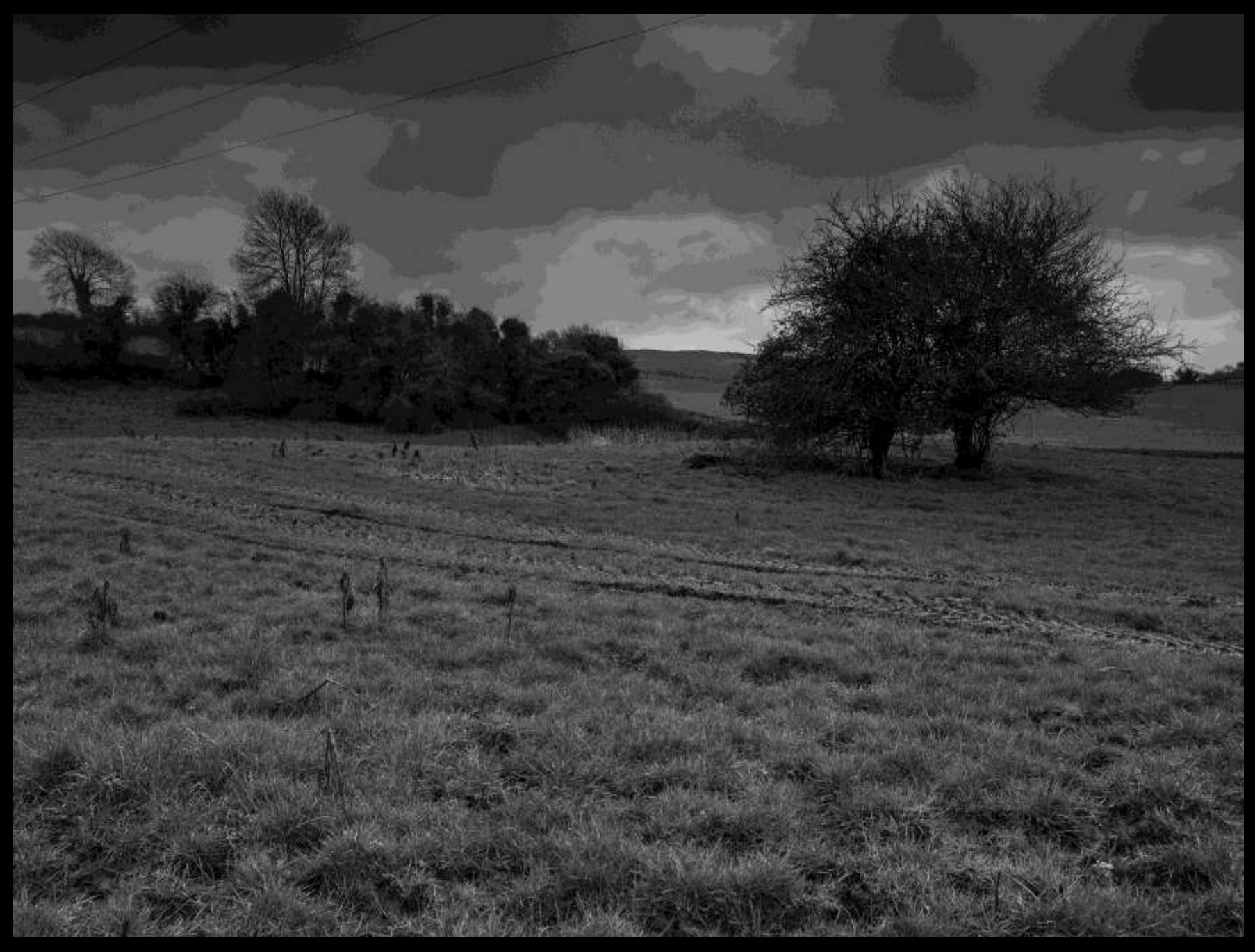
Sixmilebridge Graveyard (Famine burial site), Sixmilebridge, County Clare