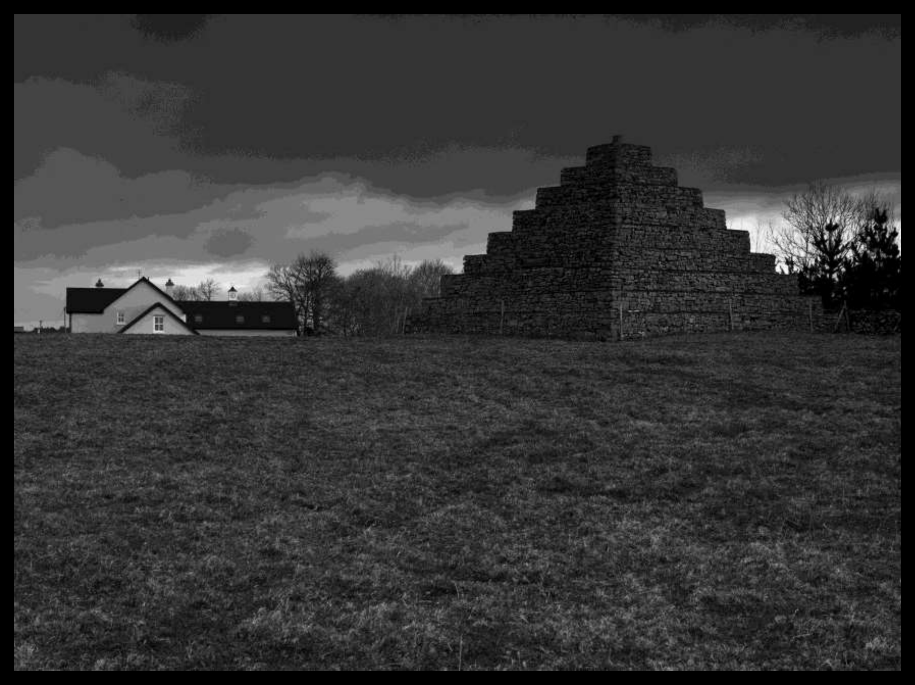
"The Pyramid of The Neale" (Architectural folly), Cong, County Mayo