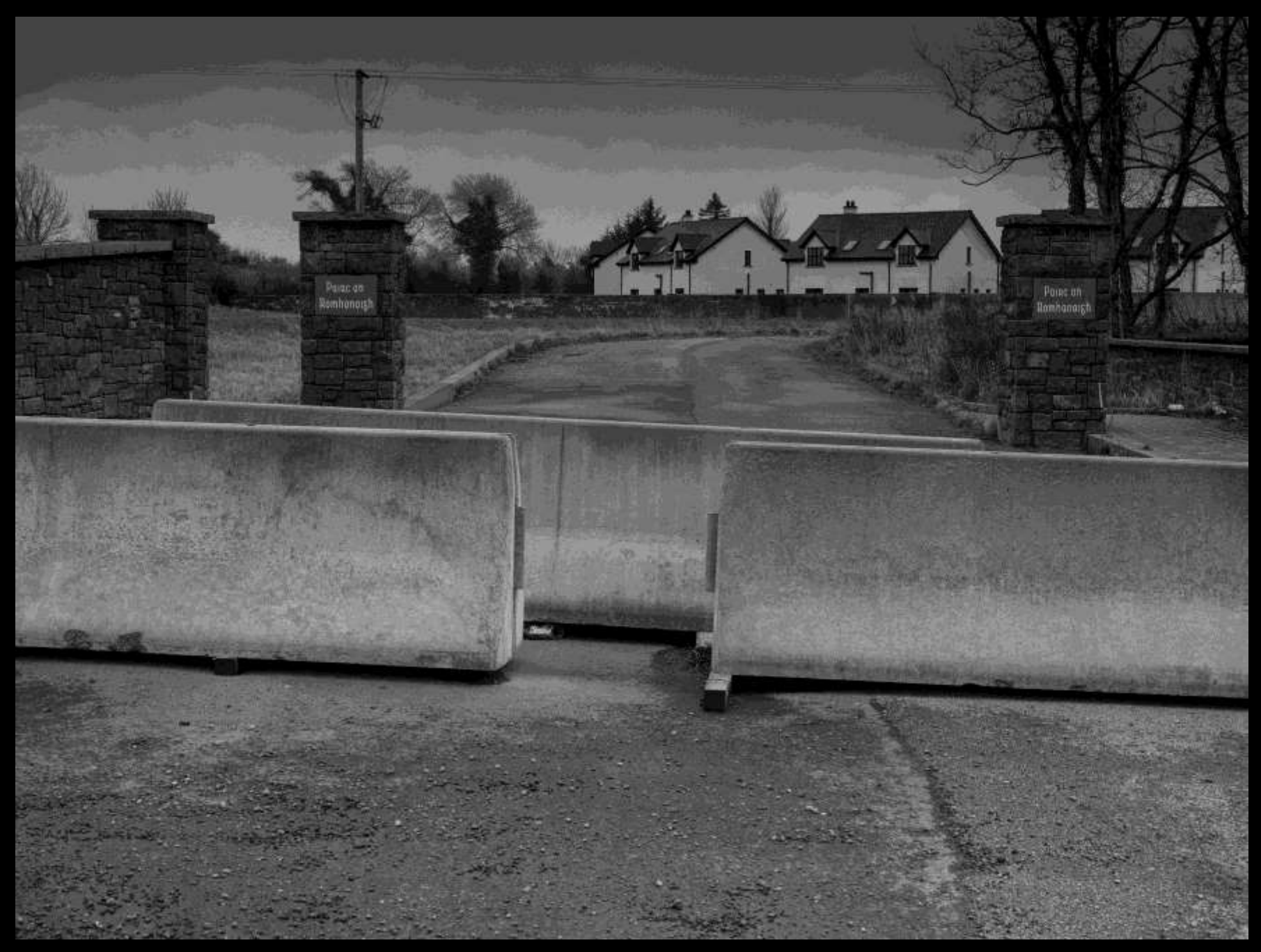
"Pairc an Romhanaigh" (Ghost Estate), Kiltullagh, County Galway