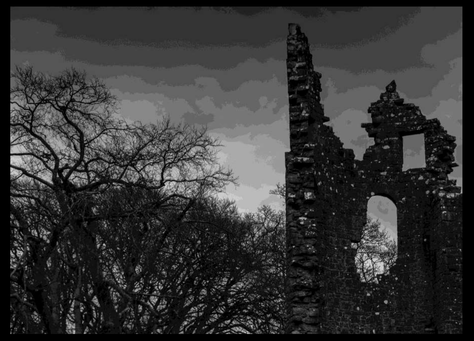
The "Jealous Wall" (Architectural folly), Belvedere House, County Westmeath, 1