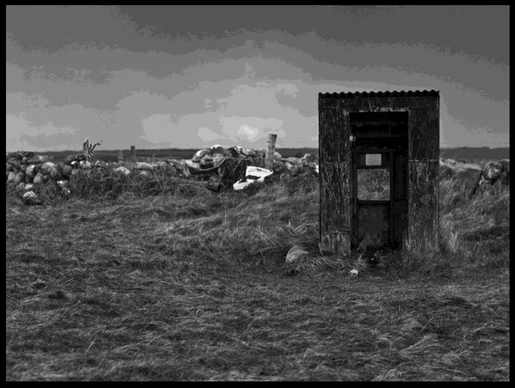
Famine burial site, Aughinish Peninsula, County Clare