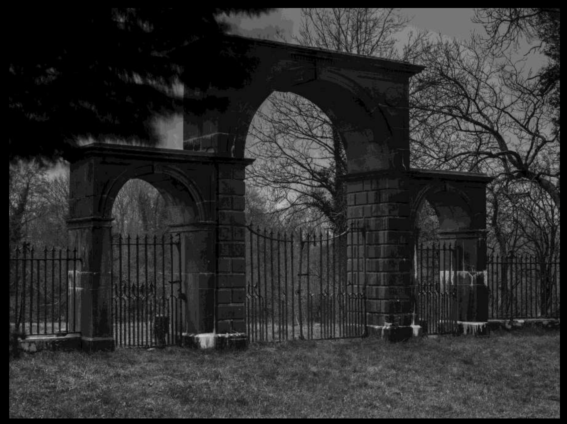
Northbrook Demesne gateway, Northbrook, County Galway