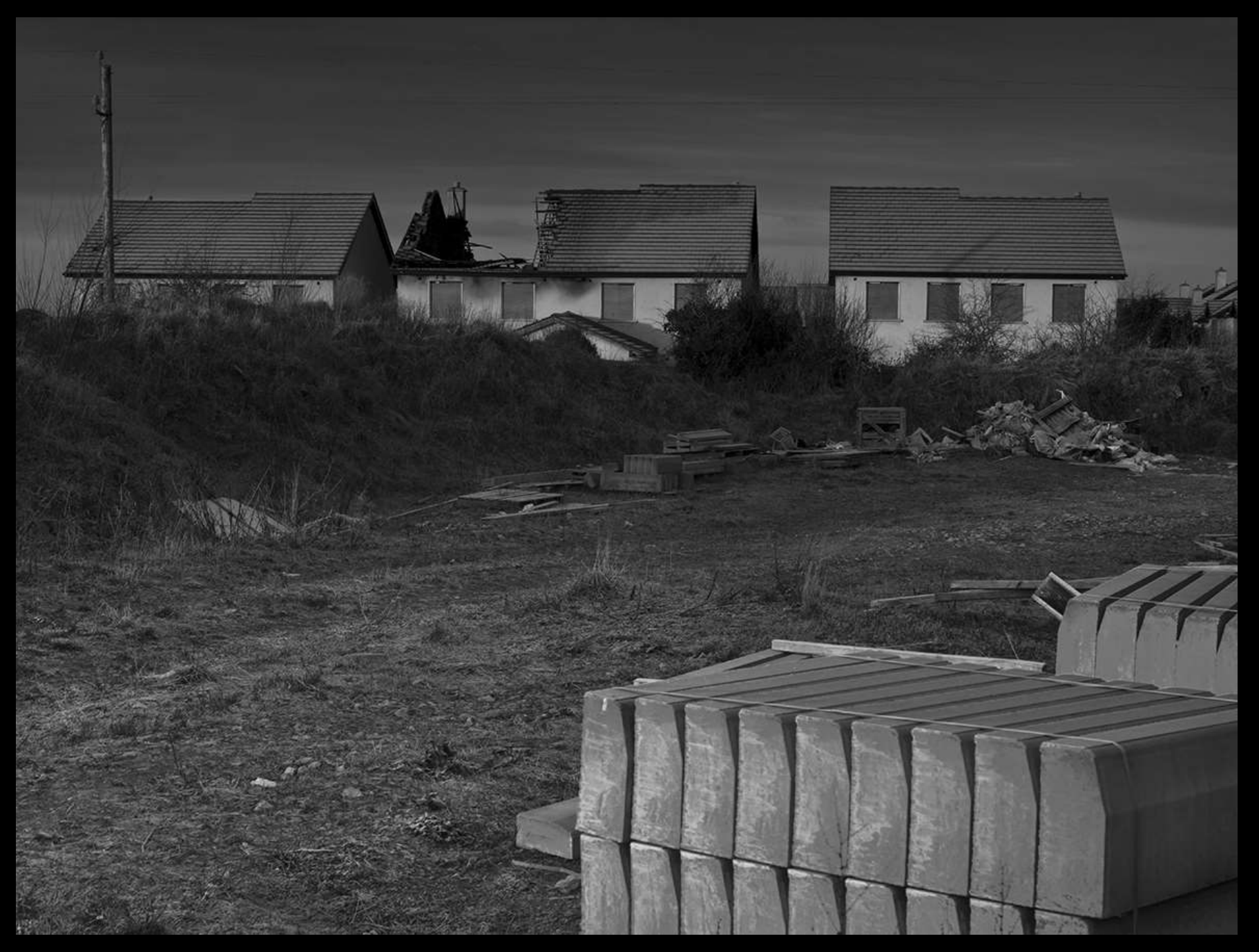
"Cottage Hill" (Ghost Estate), Loughrea, County Galway