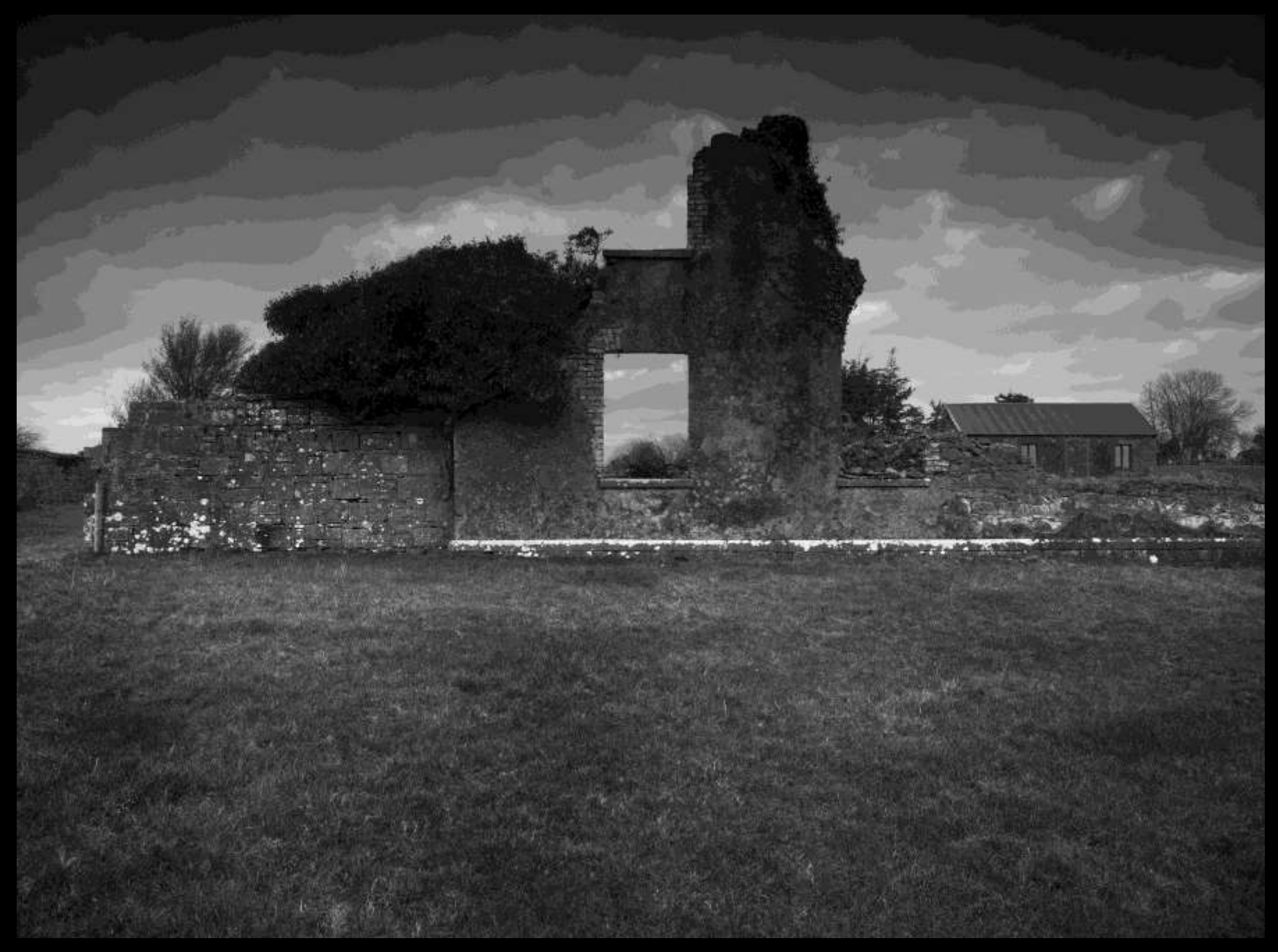
Glenamaddy Workhouse, Glenamaddy, County Galway