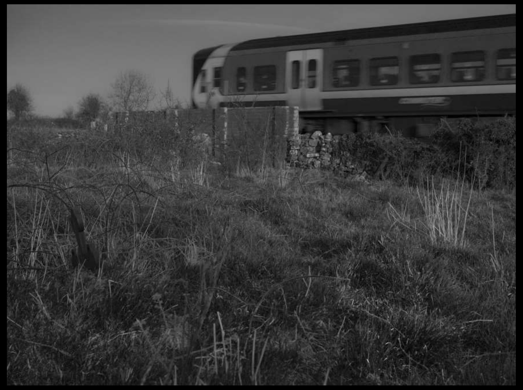
Lavallylisheen Graveyard (Famine burial site), Gort, County Galway