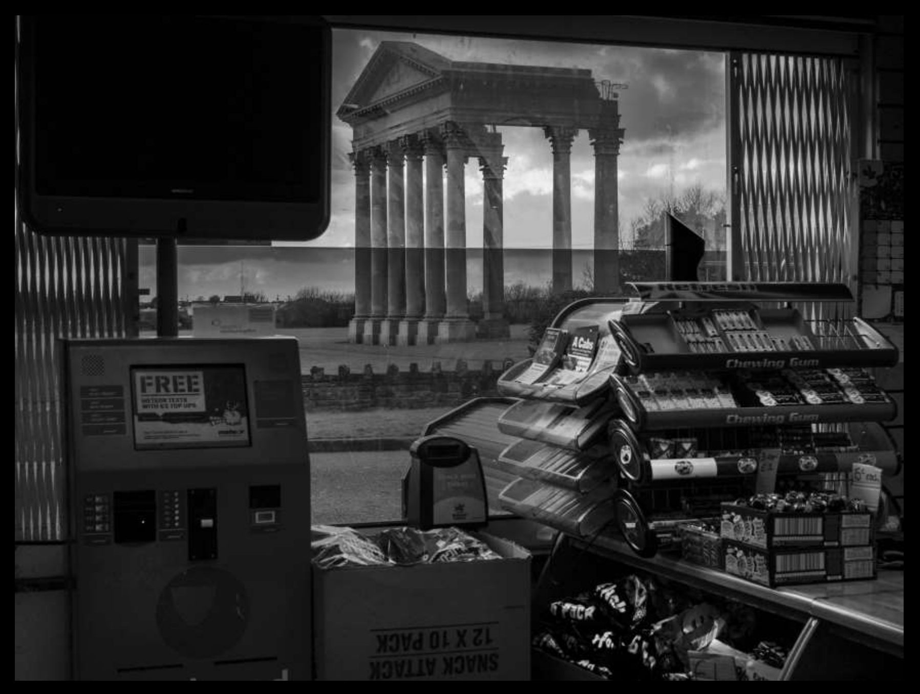
Kenure House through the window of Rickard's Delicatessen, Rush, County Dublin