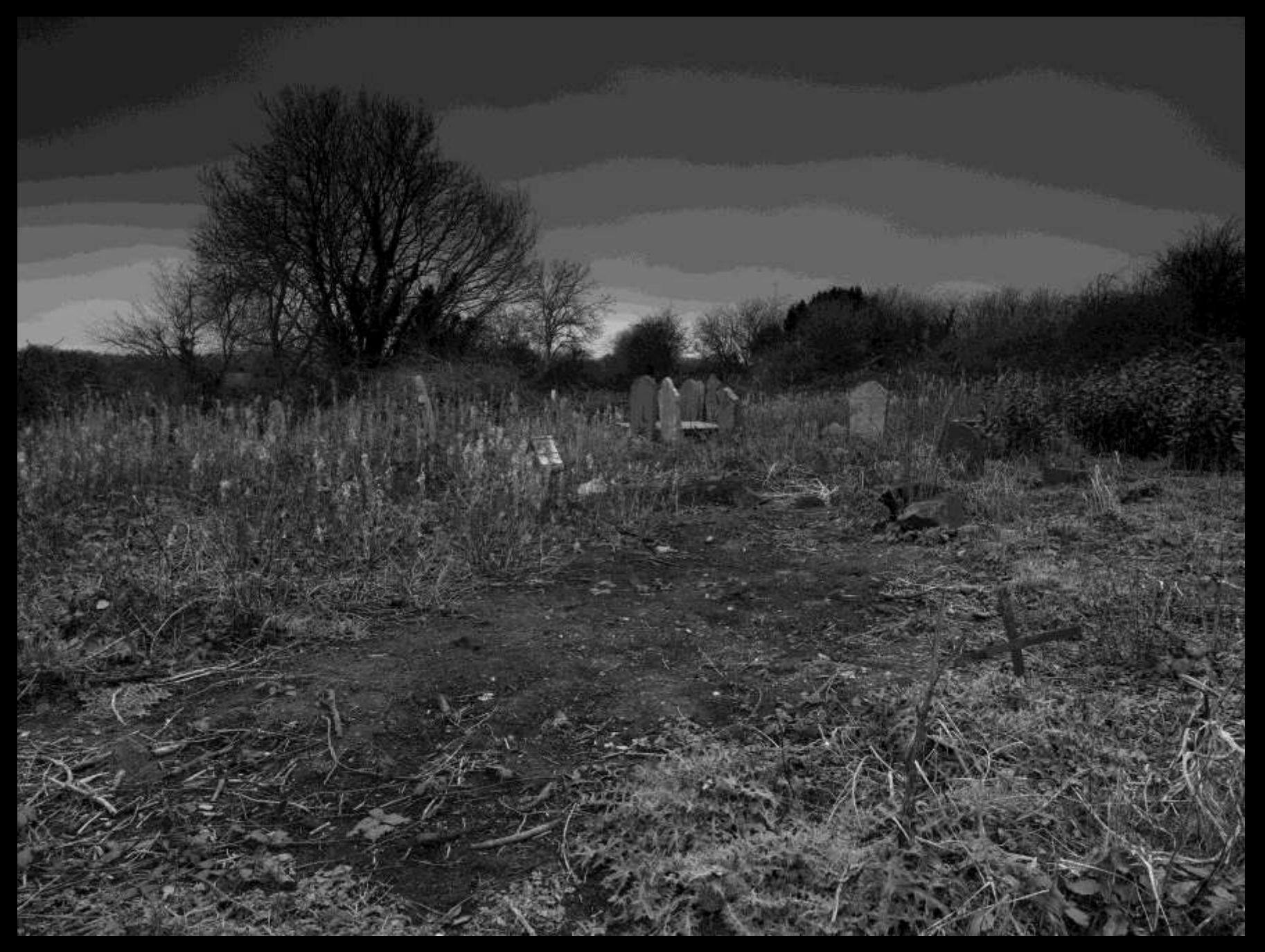
Clonattin Graveyard (Famine burial site), Gorey, County Wexford