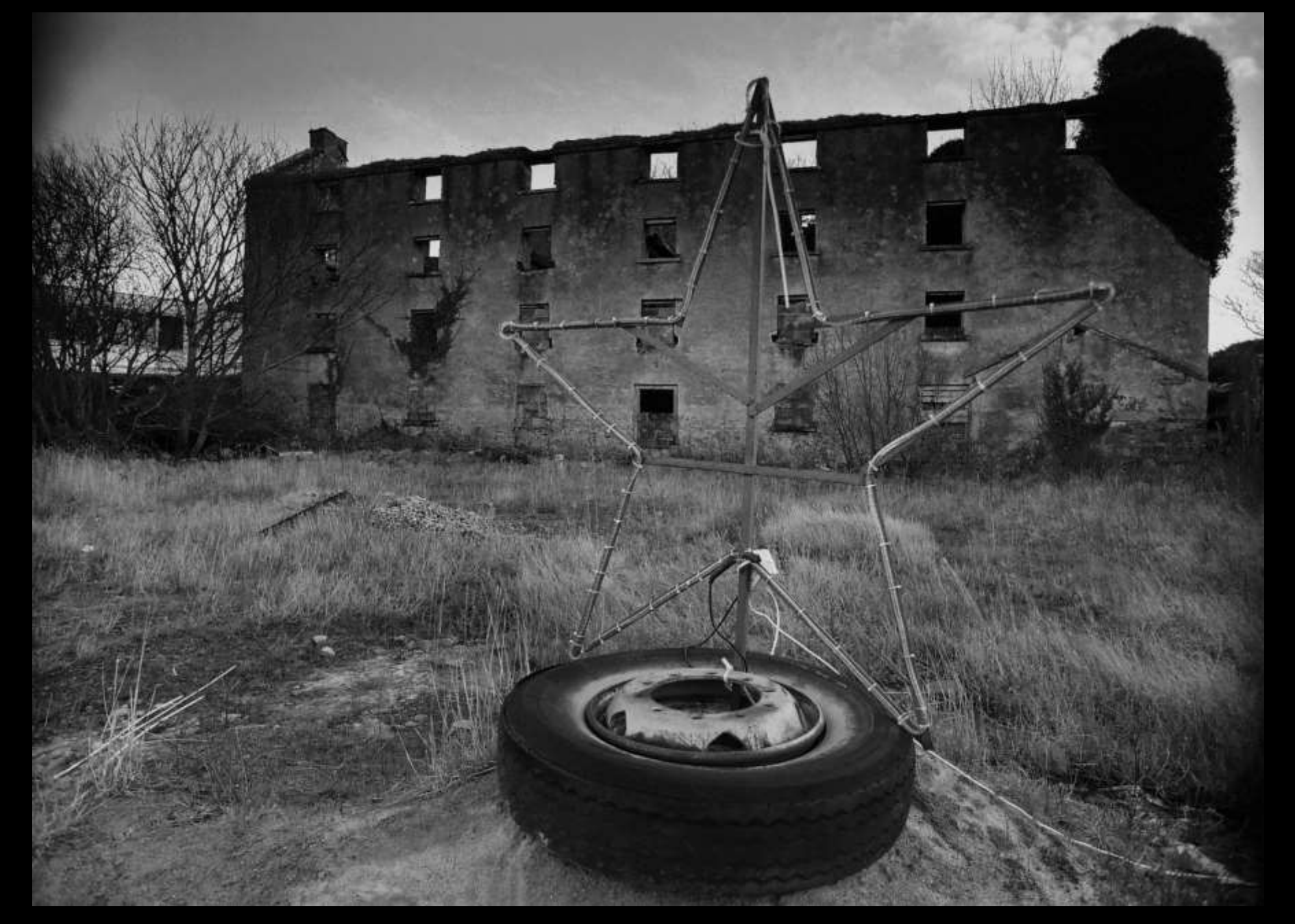
Dungloe Infirmary (Famine burial site), Dungloe, County Donegal