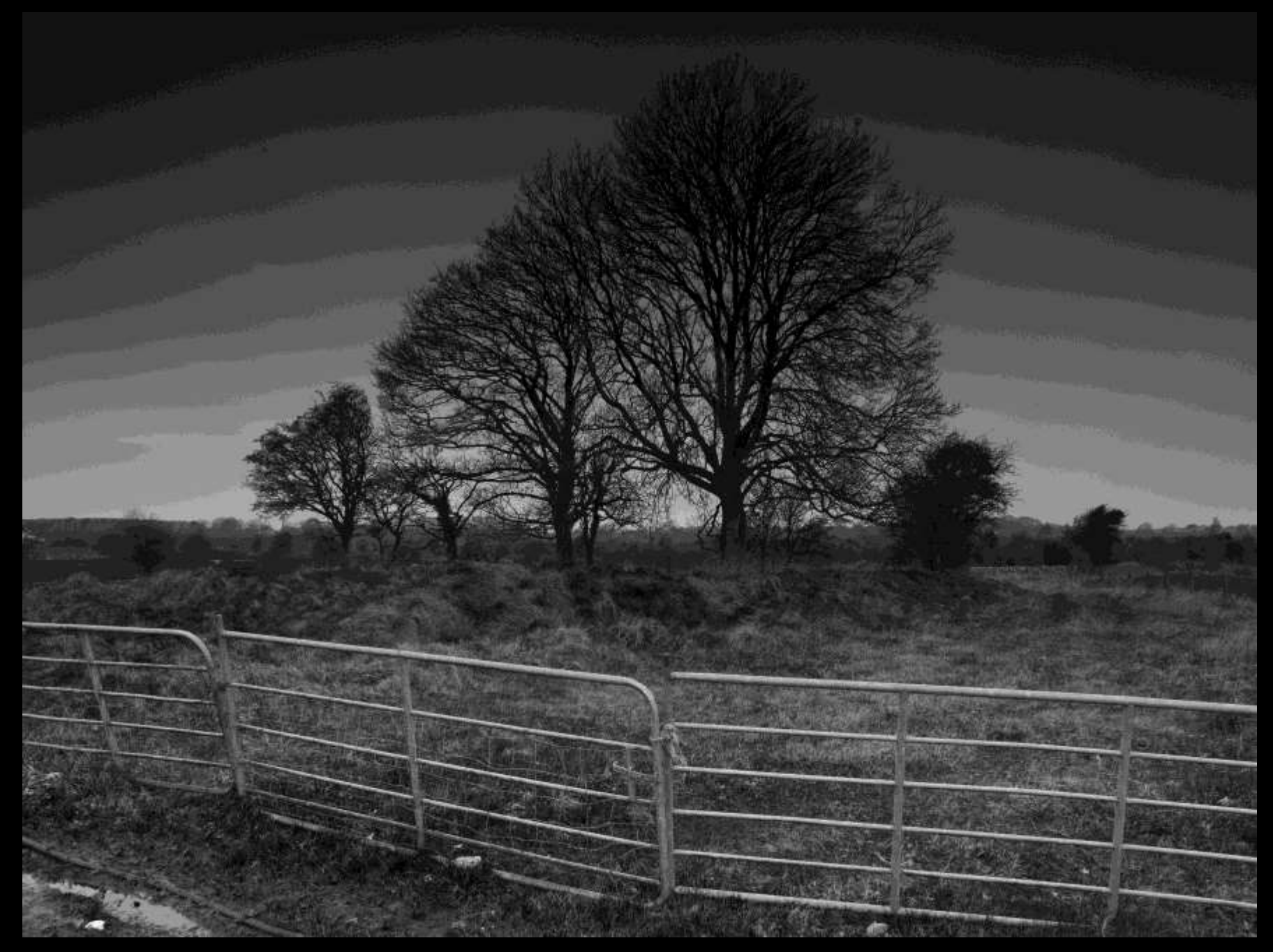
Famine burial site, Brooke Lodge, County Galway