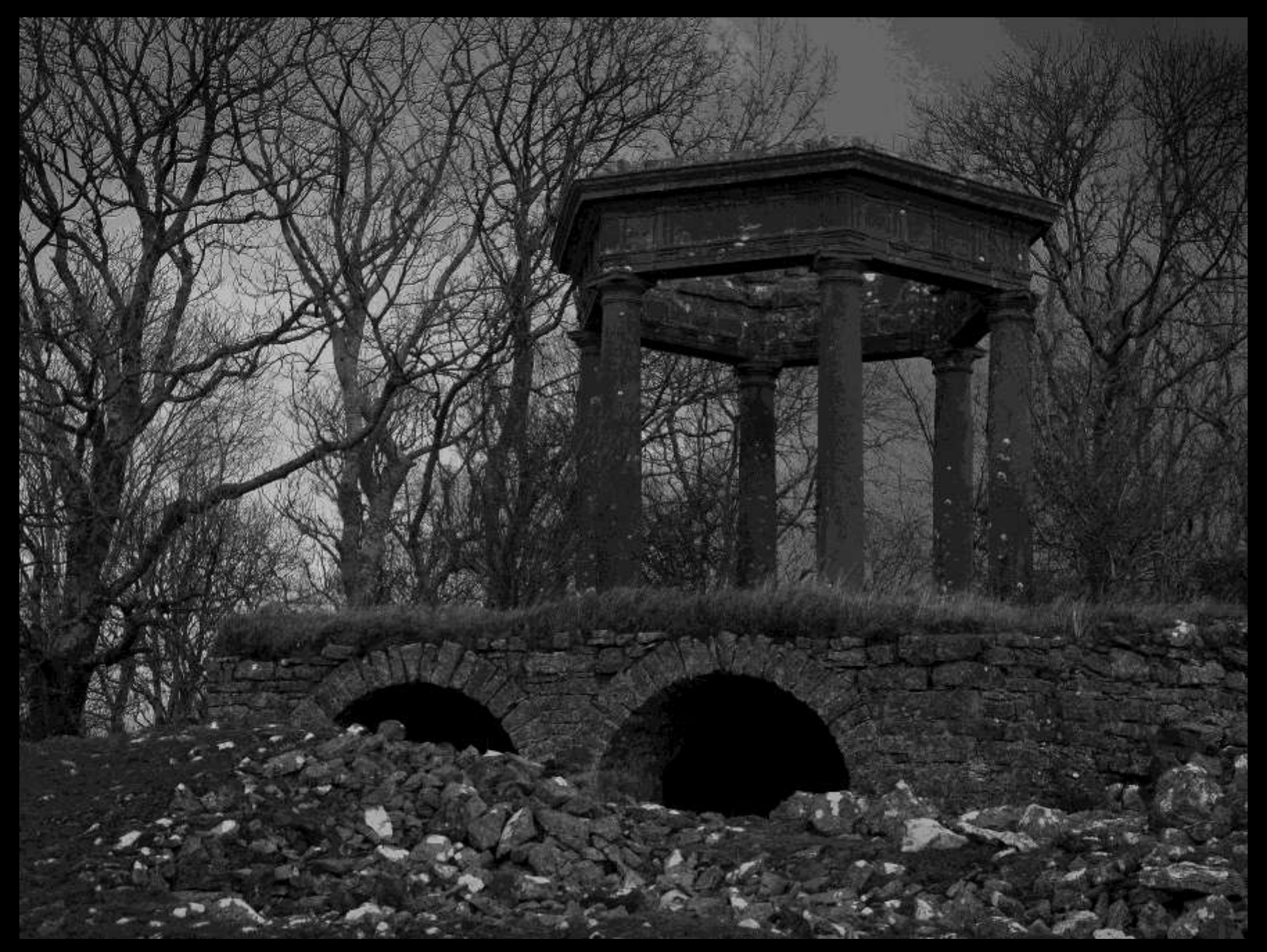
"The Temple" (Architectural folly), Cong, County Mayo