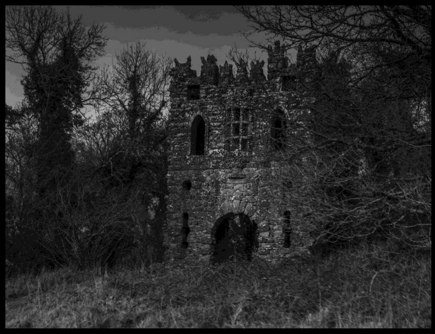
Gothic folly, Belvedere House, County Westmeath