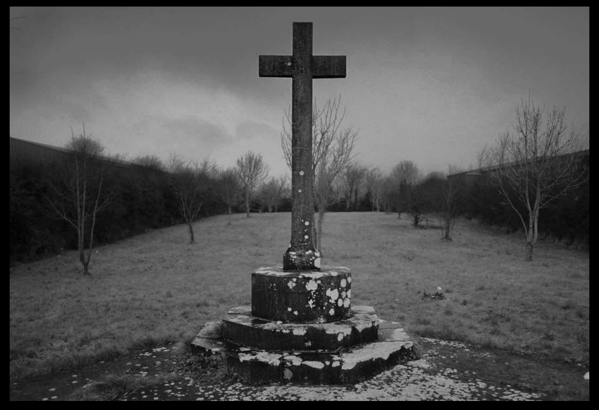
Newcastle West Workhouse and Famine Graveyard, Newcastle West, County Limerick