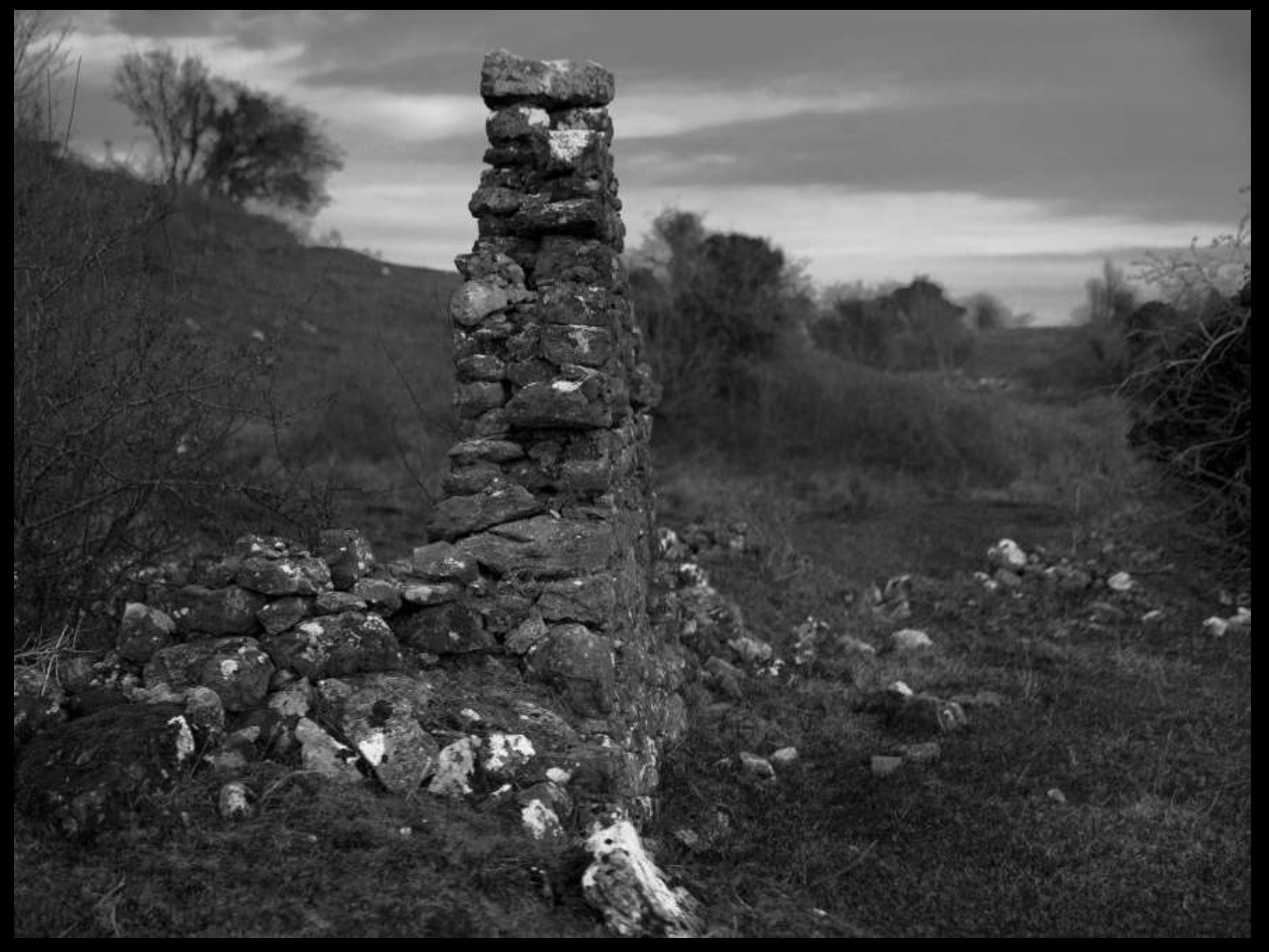
Famine eviction site, Carn, Killare, County Westmeath, 1