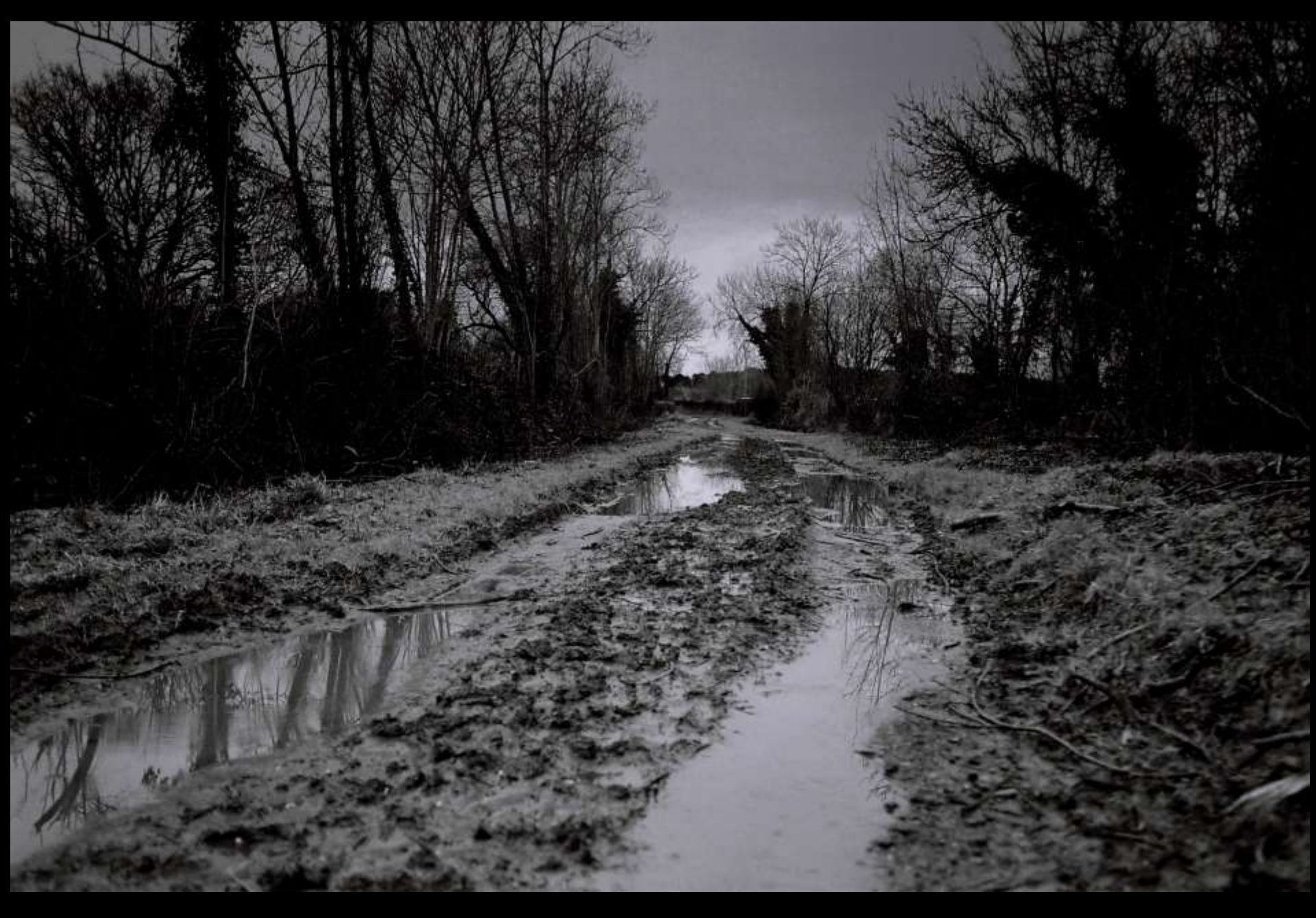
Boreen to the Callan Workhouse and Famine Graveyard, Callan, County Kilkenny