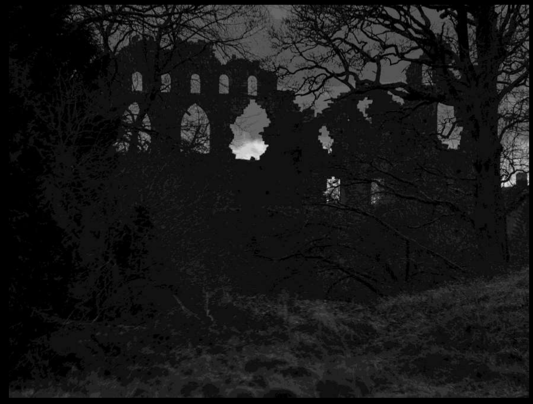
The "Jealous Wall" (Architectural folly), Belvedere House, County Westmeath, 2