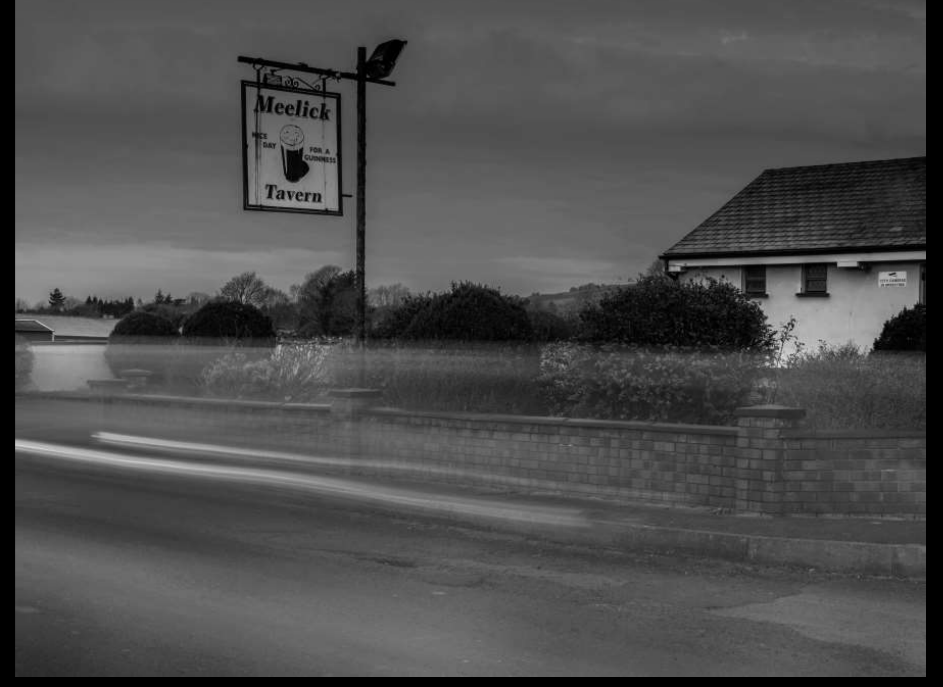
Knocklisheen Graveyard (Famine burial site), Meelick, County Clare