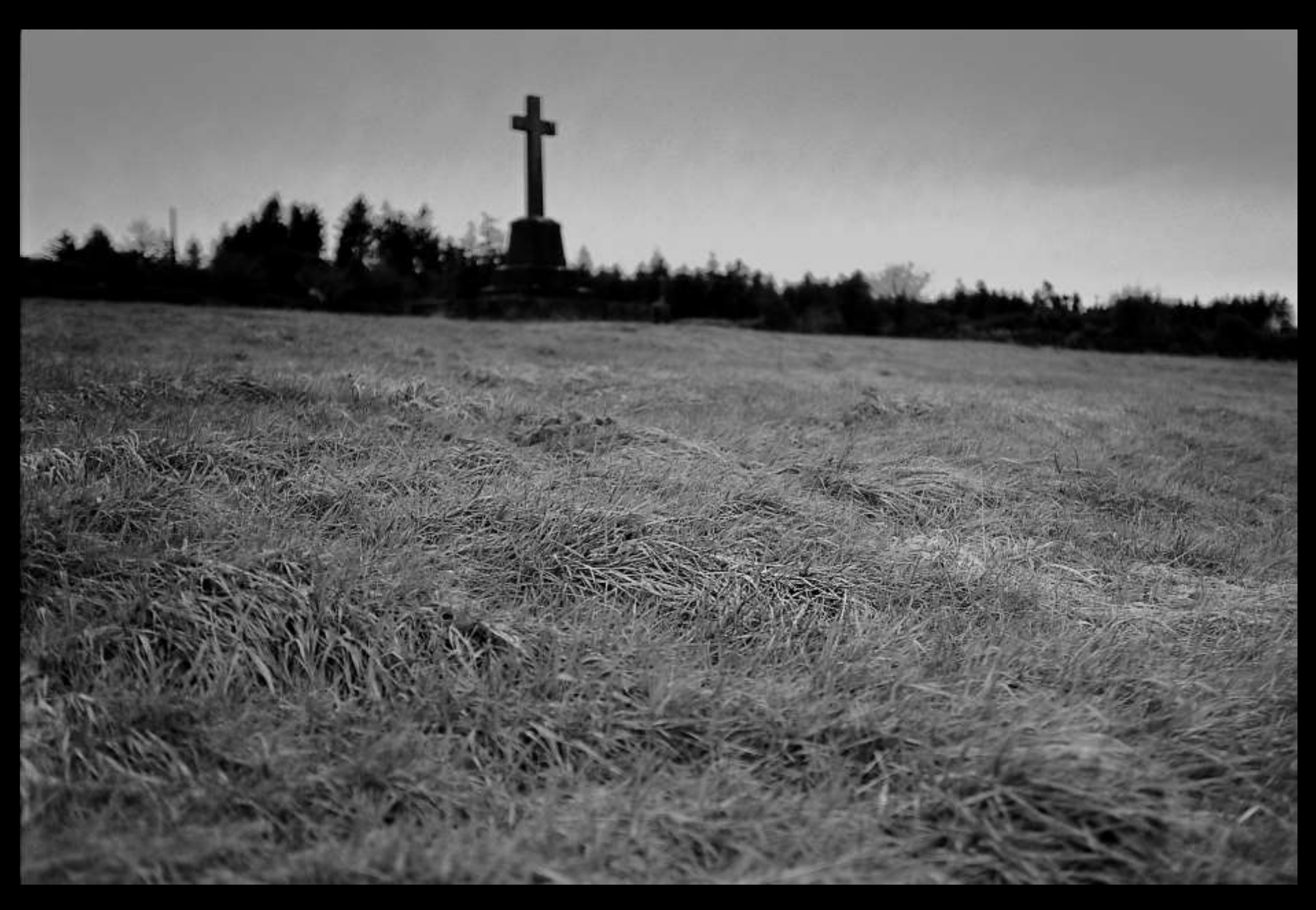
Dungarvan Workhouse and Famine Graveyard, Pulla, County Waterford