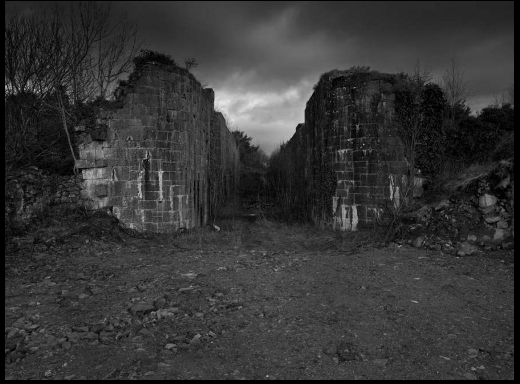
Abandoned Famine Relief Project, Cong, County Mayo, 2