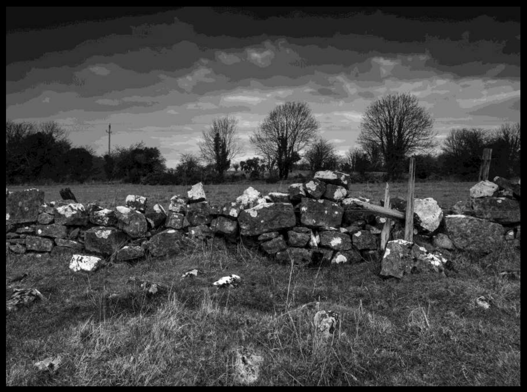
Glenamaddy Workhouse and Famine Graveyard, Glenamaddy, County Galway