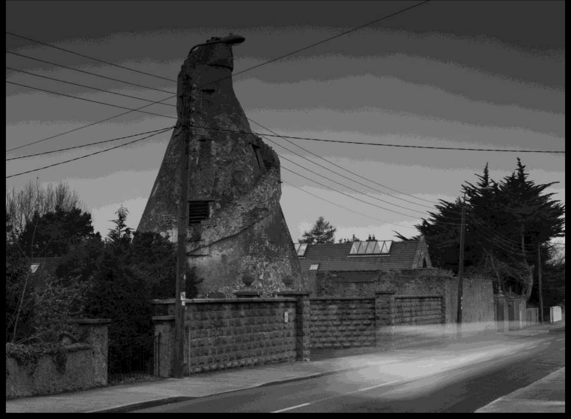
A relic from the famine of 1740-41, Rathfarnham, Dublin