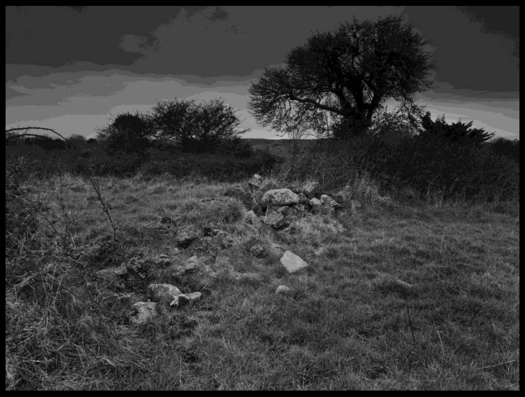
The Crag Graveyard (Famine burial site), Clonconnane, County Limerick