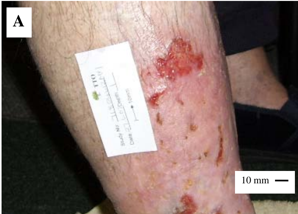
Figure 2. Initial and post-treatment images of wounds for participant #5 who had a venous leg ulcer of 12 months duration. Images were taken on enrolment (A) and in week 6.