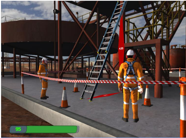
Figure 1. Screen shot of working at heights module: correcting ladder angle.

The deployment produced valuable data and the conclusions and recommendations derived from the study are summarised in the following sections. A screen shot of the Working at Heights module is shown in Figure 1 and Figure 2.