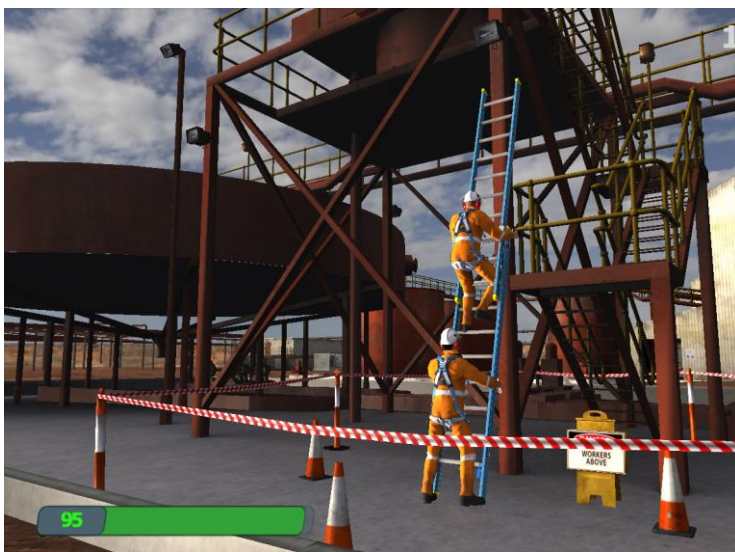
Figure 2. Screen shot of working at heights module: safe use of ladders.