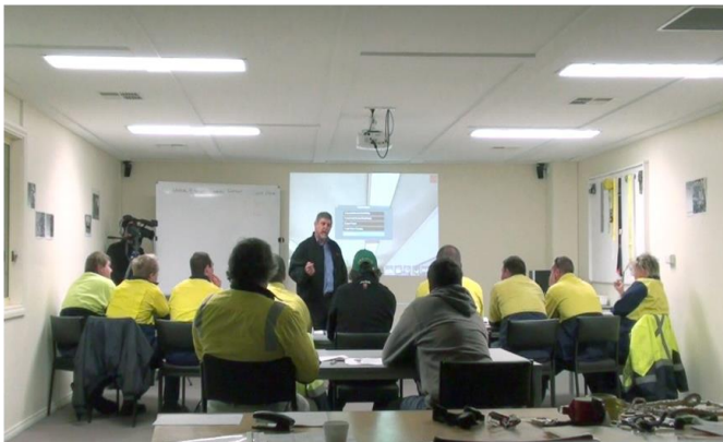
Figure 3. Intergration of module into mine site inductions.

Olympic Dam kindly accommodated a site deployment and due to time restrictions, uncontrollable variables and logistical issues, only a general satisfaction survey was conducted. The deployment took place in a classroom environment at the 'pilot plant' training site. The course was trainer led as shown in Fig. 3.