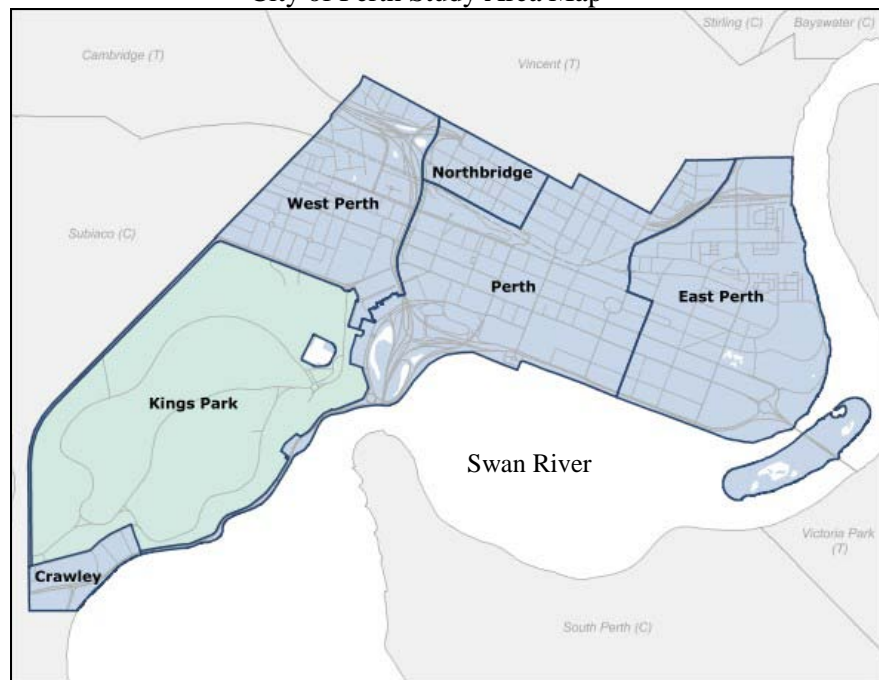
City of Perth Study Area Map

1. Is City of Perth your main destination for this trip (circle one)? Yes No