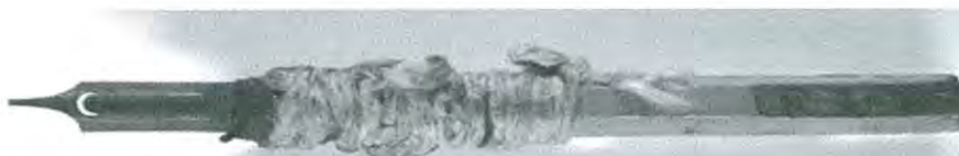
Image of Henry Lawson's Pen