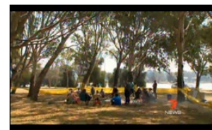
Figure 1: ‘Aboriginal activists meeting with their elders at Heirisson Island’ (Item 7)

The issues of native title and sovereignty are explored by reporter Jane Hammond in two articles (Items 2 and 8) published in The West Australian in the