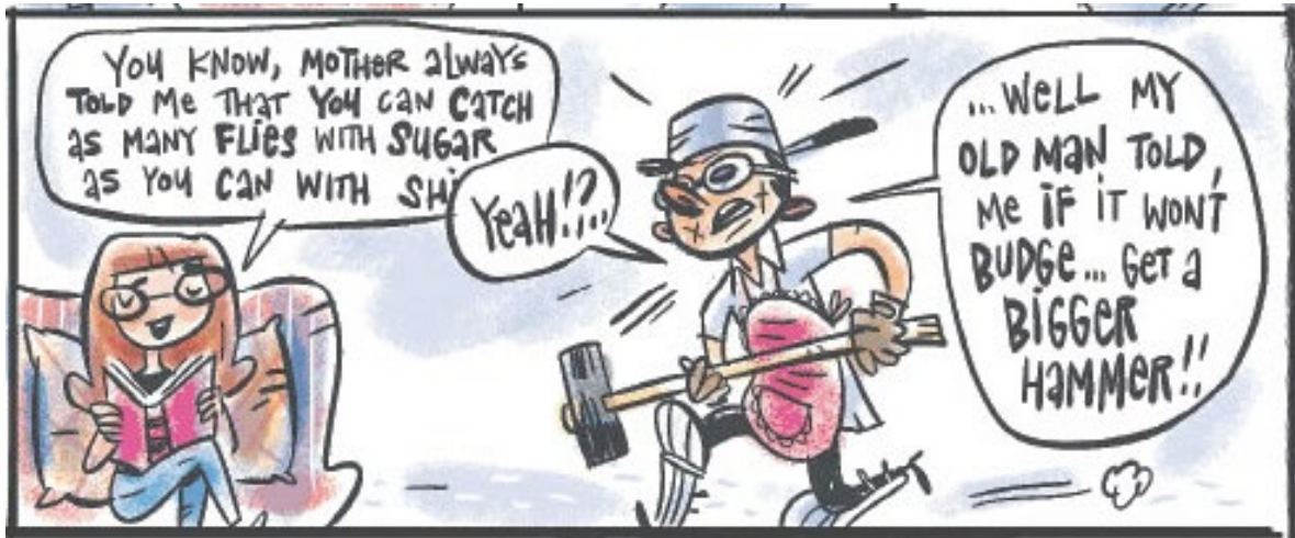
Figure 37: 'Get a BIGGER HAMMER' (Item 94)

While The West's cartoon and editorial for 24–25 March may seem extreme, they are nevertheless representative of some of the most problematic media practices used in the reporting of events and issues associated with the Tent Embassy. Some of the media's most significant failures (exemplified by the 24–25 March cartoon and editorial in The West Australian ) may be listed as follows: