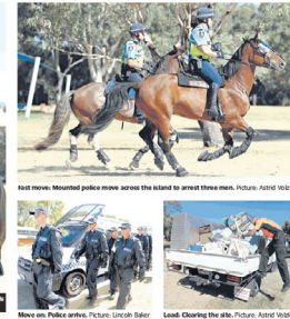
Arrested 10 police and 100 protesters were taken to the island after protesters camped on Heirisson Island.

But more charges including obstructing police, disorderly conduct and refusing to provide information to police. "We tried to avoid a confrontation with the other side of the island but they came at us and made the trouble," he said. "The police always intended to arrest someone."