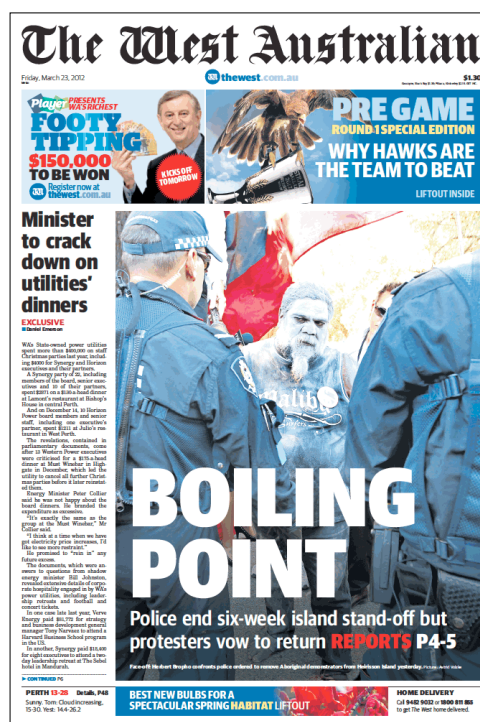
Figure 28: Front page, front lines (Item 82)