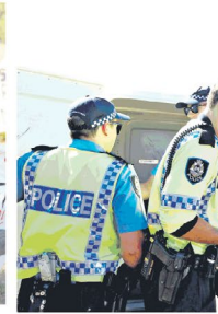
Arrested 10 police and 100 protesters were taken to the island after protesters camped on Heirisson Island.