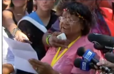
Figure 20: ABC1's representation of Culbong a month earlier (Item 39)

The item closes with the reporter saying that WA police were 'investigating the complaint'. This closing statement is set against a close-up of pebbles, rocks and pieces of broken glass on a blue carpet, followed by a cut to a long-shot of a deserted picnic area with people moving in the background shadows.