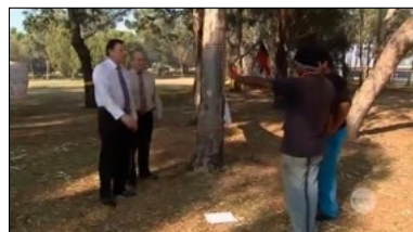
Figure 40: 'Warra, warra, warra ["Bad, bad, bad"]. You are illegally on our land' (Item 20)