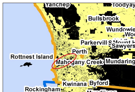
Figure 4: Yellow areas show where native title has been extinguished in Whadjuk people's country before the government-SWALSC deal (SWALSC, 2012, 14).

We should also question whether it is a radical ('anti-social') act to demand public recognition of inheritance. The potential inheritance area is shown in black in Figure 4, including the Swan River and Matagarup areas (within the red oval marked on the map). This area would be radically diminished under the government-SWALSC deal (Figure 5's black areas show where native title would remain and grey areas where partial native-title rights could be enjoyed).