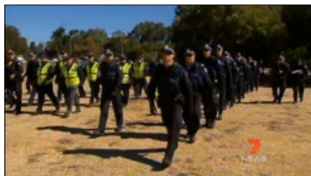
Figure 27: State police (Item 79)