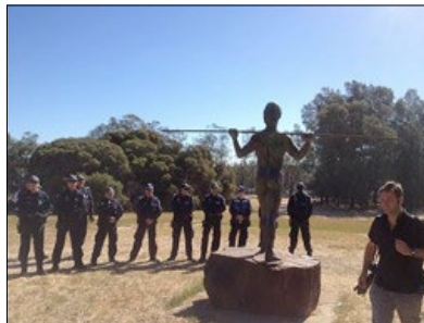
Figure 34: 'Heirisson Island protest' (Item 89)

Police spokesman Higgins' statements were later used to close the frame as follows: