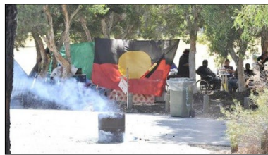
Figure 21: 'island tent camp' (Item 65)

Put simply, news images are routinely read as documentations of events when they are always (also) illustrations of stories. The two images included with PerthNow 's article on O'Callaghan's call to 'clear out' Heirisson Island (Item 65), for instance, work to solicit reader support for police action by appearing to illustrate claims by public authorities that the Embassy represented an eyesore and a menace. Shot as if spying from behind a tree, the first image (see Figure 21) intimates a distant threat lurking in the shadows—a reading supported by the image's positioning of a smoking drum in the middle ground and a patchwork of tarpaulin, cloth, flag and supplies in a clump of trees shadowing unidentifiable people in the background. The second image shows pieces of concrete rubble in the foreground, with the caption: 'DANGEROUS SPLIT: Police are investigating broken kerbing on Heirisson Island as activists stage a protest on the island' (see Figure 22). Such images provide little scope for seeing the Tent Embassy as a positive community contribution, say, or as a peaceful affirmation of Aboriginal heritage. As a consequence, and notwithstanding the inclusion of Tent Embassy voices in the article itself, the meaning and value of the Embassy is visually determined by the composition and selection of images that pick up on and reinforce the reported views of the WA Police Commissioner.