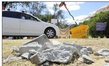
Figure 22: 'DANGEROUS SPLIT' (Item 65)