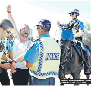
Arrested 10 police and 100 protesters were taken to the island after protesters camped on Heirisson Island.