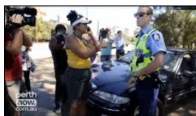
Figure 30: A question of jurisdiction (Item 84)

PerthNow also provided extensive coverage of the previous day's raid. Its video (Item 84: Tension rises on Heirisson Island ) shows a challenge to state authority as police attempt to seize a car (the police respond, it could be said, uncomfortably):