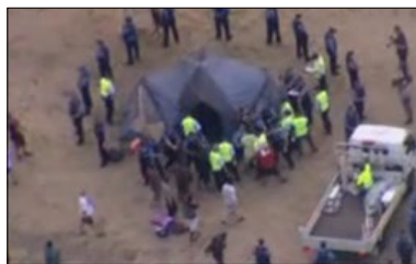
Figure 13: Police and council rangers take down a tent on 23 February (Item 48)

Privileging a police perspective from the start, this report lost sight of the fact that the Tent Embassy was peaceful, orderly and self-regulating prior to the police raid (see Item 45, recorded earlier in the day). Responsibility for any violence is thus placed with the Tent Embassy participants and not with the state institutions that authorised the raid. It inevitably follows from this that Tent Embassy participants are to be held responsible for social disruptions, such as the police closure of all roads around the island.