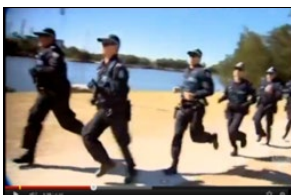
Figure 26: Police in hot pursuit of the Tent Embassy (Item 77)