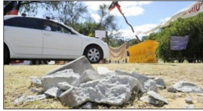
Figure 6: Paul Murray's 'gathering of ammunition' (Item 65)

This (Figure 6) is what Murray—in the hours before the biggest and most violent police raid against the Tent Embassy on 22 March—called a 'gathering of ammunition', presenting no evidence that it was anything more significant than a small pile of concrete rubble. PerthNow captioned its image as follows: