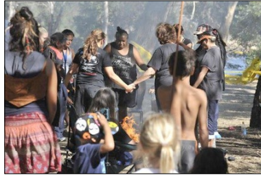
Figure 12: Image 3 of Galleries: Tent embassy shutdown (Item 28)

Immediately following the second large-scale police raid, which began at about 5:30pm on 23 February, the 6pm edition of Nine News (Item 46: Tent Embassy battles ) showed rangers confiscating Tent Embassy equipment under police guard and against the continual sound of an overhead helicopter. The reporter, Simon Bailey, suggested that police had arrived not just to ensure the removal of tents and cars, but also to remove the Tent Embassy participants from Heirisson Island. The threat of police violence—‘they are prepared to use force if the members of the tent embassy remain here on Heirisson Island and refuse to leave’—was excused in Bailey’s closing words: ‘But already we have seen protesters, um, arcing up to police, swearing and trying to stop their Tent Embassy being taken down.’ In a similar vein, the 7pm edition of ABC1’s news bulletin (Item 47: Aboriginal protest shut down on Heirisson Island ) opened with the anchor saying: