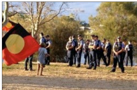
Figure 7: I fought the law (Item 52)