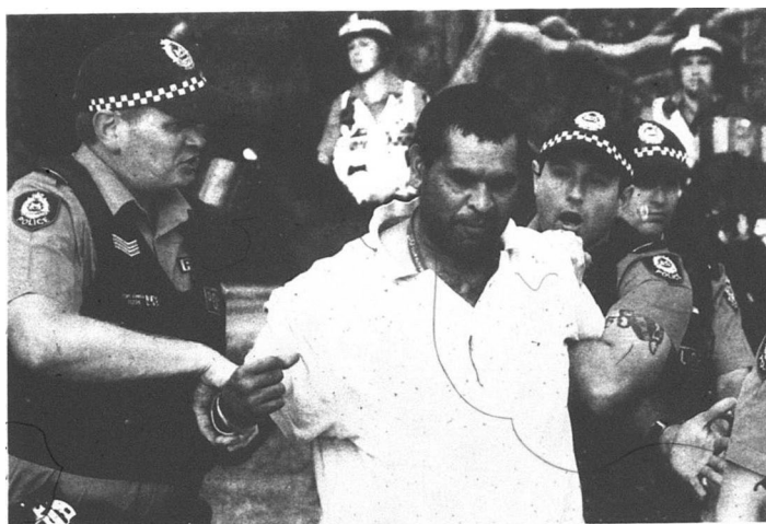
Rising tension: Police detain a man at the Heirisson Island camp last night.