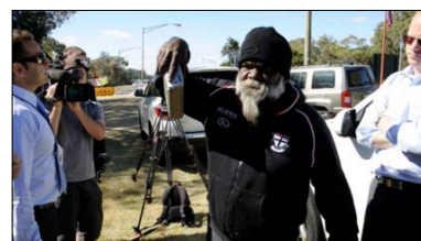
Figure 32: 'Who was the person talking on the radio?' (Item 86)

Neither fire nor danger, however, is represented in the image below or in the PerthNow video (Item 84), but still the point of the article was to portray a public crisis requiring strong police action.