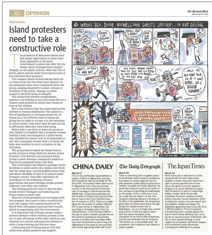
Figure 36: 'protesters' and 'unwelcome guests' (Item 94)

On the Saturday after the raid, The West Australian's editorial and adjacent half-page cartoon (Item 94, see Figure 36) worked to justify the police raid and place responsibility for it on the Tent Embassy and head off any emerging criticism.