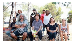
Figure 3: Nyoongar Tent Embassy press conference (Item 18)

Barnett speaks as if the Tent Embassy participants have been treated reasonably here, by ‘allowing’ people to stay ‘a few days’ on their own land under threat of eviction. The head of the government normalises the subsequent forced removal of the Nyoongar people from a state-registered sacred site, his ‘reasonableness’ serving to legitimise an unreasonable government action. Crucially, this act of legitimisation relies on the journalist’s uncritical acceptance of Barnett’s referral of the issue to police rather than the Department of Indigenous Affairs, which regulates access to registered Aboriginal heritage sites. Barnett’s comments thus make his government’s use of police to enforce the closure of the Embassy seem to be the logical and appropriate way to deal with camping ‘protesters’ (Item 19: Tent Embassy protestors defy move-on notice ):