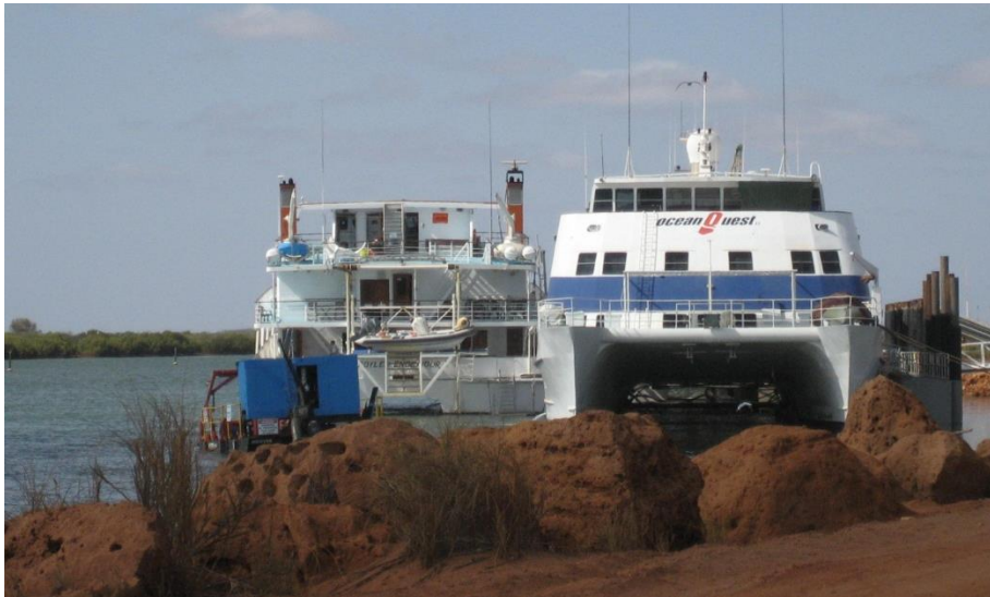
Figure 3: 'Floatel' worker accommodation in Onslow, 2012.

Despite attempts to contain speculation and minimise the negative impacts, local residents complain that Onslow is changing with limited opportunity for local entrepreneurs to take advantage of opportunities due to a large multi-national company with limited empathy for small-town Australian conditions, tardy land release, hold ups with native title processes and the provision of utilities; the same problems which have been experienced by the other Pilbara communities and which have stymied orderly regional economic development elsewhere. There are also concerns for the corporate partners. Development delays mean