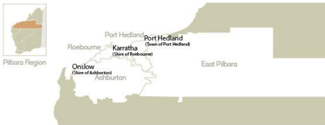
Figure 1: The Pilbara Region of Western Australia showing four local government authorities