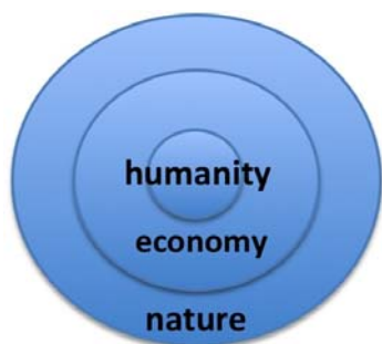
Figure 2. A buffer model of the global system; Giannetti, 1993

Based on the co-evolutionary paradigm (e.g. Norgaard, 1997), it is possible to model the interactions within the global “humanity–global economy–nature” system. The important point is that all three should be modelled and analysed simultaneously in terms of their global interactions. In other words, a model: (1) should not be representing only one of the components (e.g. the economy) against the other two; and (2) should allow a study of the conflict and risk factors together with the resulting changes of transformation and co-adaptation that shape the co-evolutionary process. Hence, sustainable development is not only a macroeconomic concept, it is not only nature conservation either. It can be social advancement but again cannot happen in isolation from nature and the economy. Sustainable development is a development that synchronises and harmonises economic, social and ecological processes.