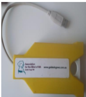
Fig 1. Designed USB cartridge for Blind or limited mobility people

The Association for the Blind (WA) provides a talking book library services to these people in Australia and throughout the world via its website ( http://www.guidedogswa.org ). This service is open to any person with either a verifiable print disability, through low vision, physical disability (eg quadriplegia) or learning difficulty (eg Dyslexia). The library contains a collection of 67,640 books as of 27 May 2013 and continues to increase this collection on a daily basis. Current delivery is via several methods: clients physically visit the library and load books onto their daisy player or USB device, books may be posted on a USB cartridge, which is designed for ease of handling by people with limited mobility or dexterity (shown in figure 1)