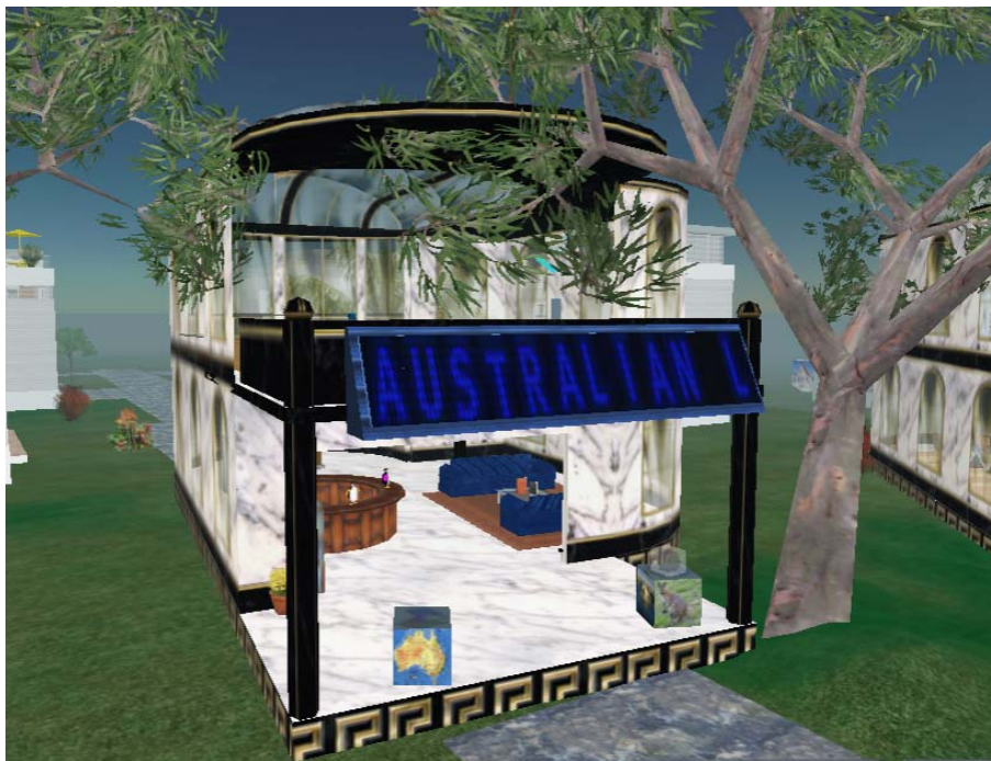
IMAGE 1 – Australian Libraries Building in Second Life, Cybrary City 211, 70, 24

Second Life started in 2003, and there were early library services by January 2005. The Alliance Library System, a consortium of around 260 libraries in Illinois in the United States, started their Second Life Library 2.0 project in April 2006 in a small rented shop front. By September 2007, this project had grown to over forty affiliated islands in the “Information Archipelago”. Library activities centre on Info Island, which receives over 6000 visitors a day. The Australian Libraries Building is a two-storey granite building, surrounded by Eucalyptus trees, on Cybrary City, one of the islands in the Information Archipelago. It is at coordinates 211, 70, 24.