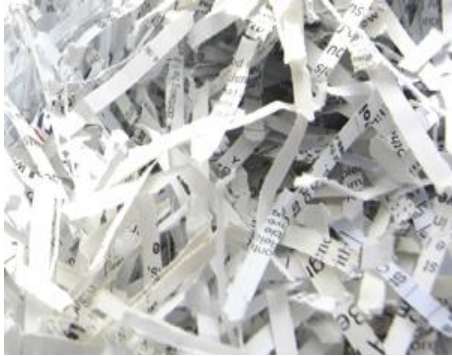
Fig. 2 Used paper template(online source,2012)