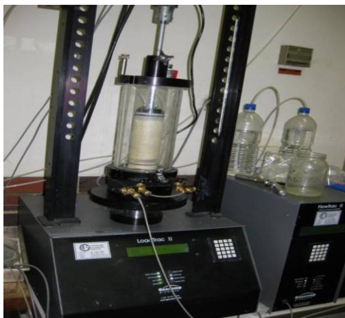
Fig. 3 Triaxial machine(Chegenizadeh and Nikraz,2011)