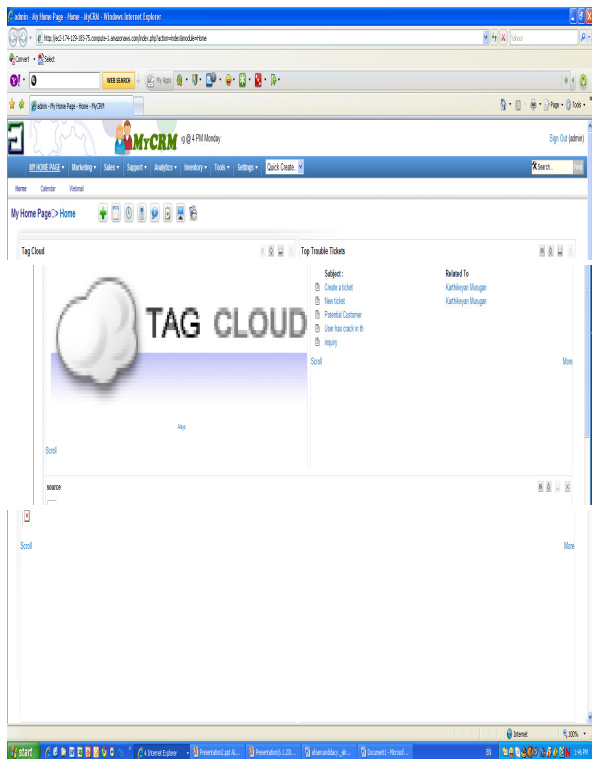
Figure B: DEBII Open Cloud to be adopted in this research (sample from Aلسys Project 2009)

approach. This work is concluded with significance of science and social science contribution.