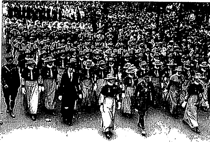
The Queen Alexandra Imperial Nursing Service on the march in London, 1902.