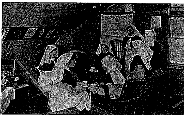
A group of Australian VADs enjoy a break from their nursing duties in their temporary quarters at a military hospital behind the Western Front during World War I.