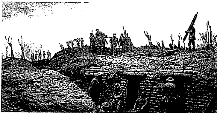
Model of an Australian Regimental Aid Post on the Western Front during World War I (photograph courtesy of Australian War Memorial).

Nursing and medical facilities on the Western front consisted of casualty clearing stations (CCS), hospital trains that transported the wounded, 'stationary' [tent] hospitals (which were essentially mobile), base hospitals to where the wounded men were taken for care, and hospital ships which returned wounded soldiers to England. All these came under her control. Her nursing workforce consisted of all trained nurses, the volunteer aid detachments (VAD) and orderlies. VADs were women without nursing training who wanted to help in the war effort, and so undertook nursing (and other) duties under the supervision of the trained nurses. They provided significant care to the wounded soldiers throughout World War I (Light 2009).