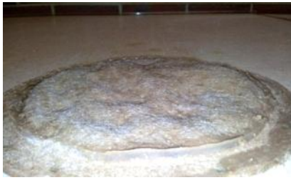
Fig. 6 The final GCL form

It was also found that the uplift hydraulic pressure has triggered the bentonite particles to move aside into some areas where the pressure was not as high as the thinner areas of the GCL. This condition made the GCL to lose its capability to hold the water pressure during the experiment. However, some bentonite particles were also indicated to move away outside the GCL cover by water flow which caused the drop of the water pressure in a short period of time.