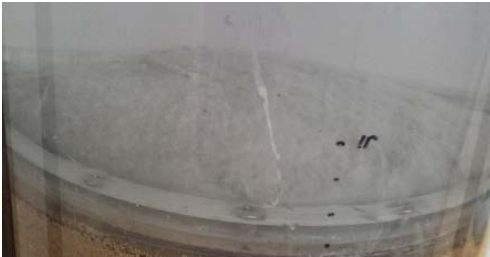
Fig. 3 GCL started to be lifted

Once being tested with water coming from above, the GCL was tested with reverse direction of water flow. The water flowed from underneath the apparatus, passed through subgrade layer and GCL. The applied pressure was 40 kPa which was equivalent to \approx 4 m water head.