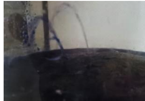
Fig. 4 GCL Failure

The effective stress at the bottom of the sample was -1.933 \frac{kN}{m^2} while the water pressure at this area was 1.14 \frac{kN}{m^2} . Summation of force shows that upward force was greater than downward force made the sample to be lifted. Since the edge of the GCL was hold by a sample holder, the GCL started to deform into a dome shape. In this case, the surface of the GCL might be stretched and cracked subsequently the water would flow up through the cracks.