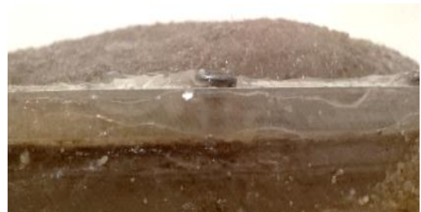
Fig 5. Sample after being tested

The GCL started to fail after undergoing water pressure for 3 days. The water just flowed easily through two small holes on the thinnest area of the sample (Figure 4). The water pressure was fall into 20 kPa in less than 5 minutes and the GCL's sample lost its capability to hold a certain water pressure any longer in 12 hours.