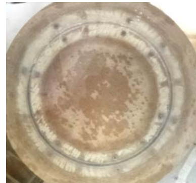
Fig. 2 Sample in the apparatus

The GCL sample was placed inside the permeameter on the top of the subgrade. Silicon sealant was applied around the sample holder's perimeter to secure the sample holder and prevent sidewall leakage (Figure 2). The cap of the apparatus was placed, secured and tighten to prevent any leak. The experiment started a day after to allow the silicone paste to completely dry.