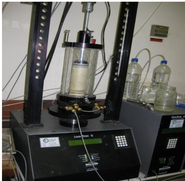
Fig. 2 Triaxial machine