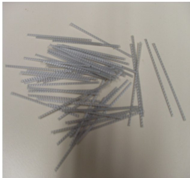
Fig. 1 Plastic fibre

The plastic fibre has been used for this investigation. The fibre properties are presented in table 2. The fibre is commercially available and is called fibre Meyco FIB SP 65 macro structural synthetic polypropylene fibre which generates a very high energy absorption rate when used in the matrix. Figure 1 shows the used fibre.