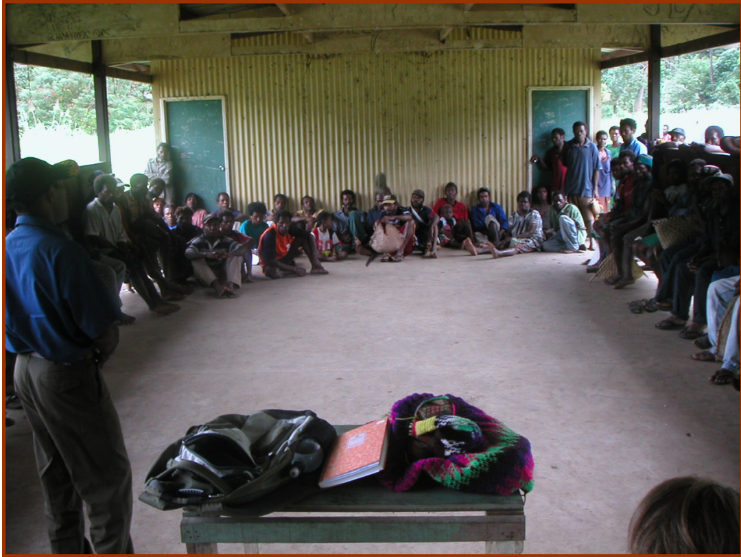
Plate 2.1. OPIC Mobile Card awareness meeting at Uasilau LSS subdivision.

records and dealt with any problems as they arose (e.g., late payments, payment inaccuracies or late renewal of contracts).