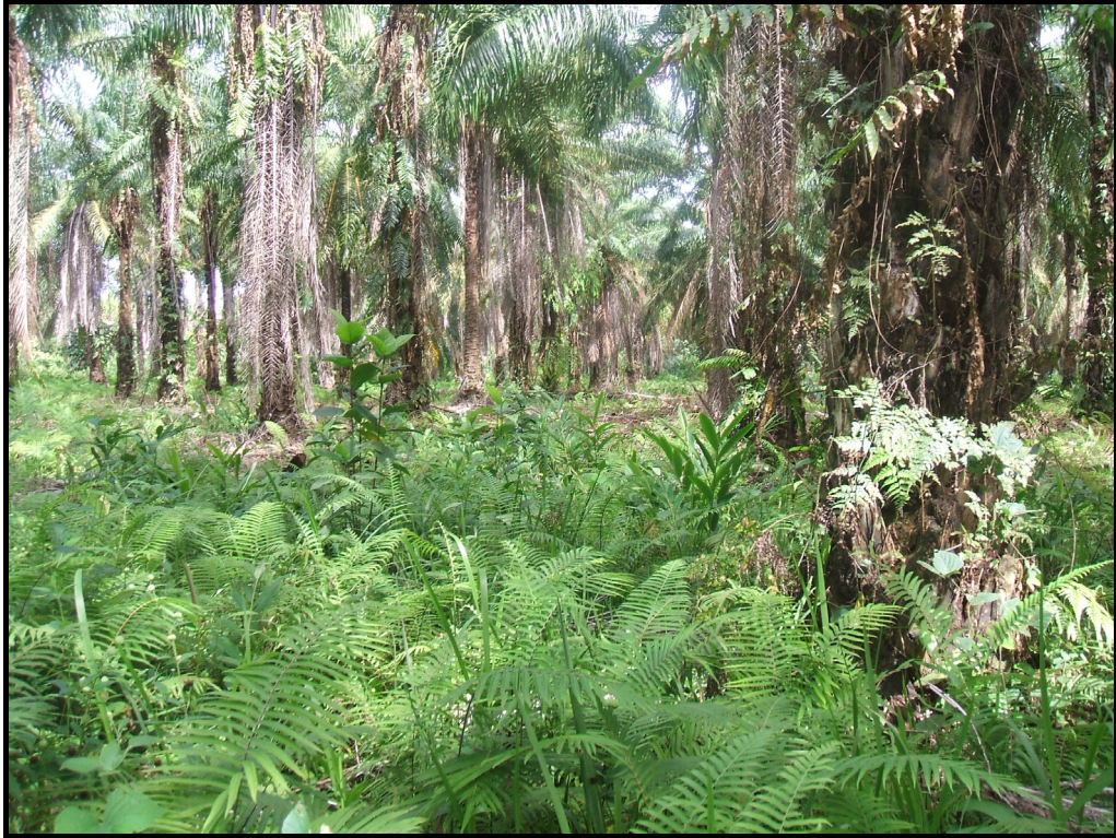
Plate 3.1. An LSS block at Wilelo before the deployment of Mobile Card labour.