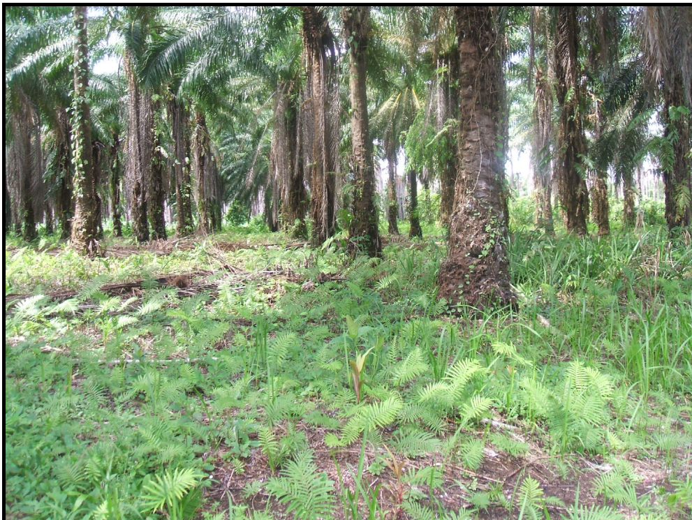
Plate 3.2. An LSS block at Wilelo after the deployment of Mobile Card labour.