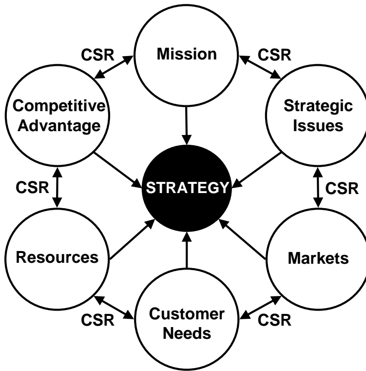
Figure 1. CSR in the context of strategy