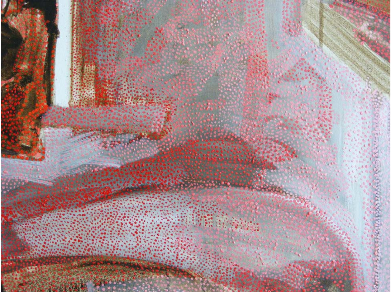
Image 6: Sabadini, Anna, Dining Room, Looking South , detail. 2010. Oil on canvas.

The approach to paint's materiality, to the way it is applied in the Western tradition also tends toward a dichotomy – between classicism and romanticism. This delineation is a micro-mirror of the Western dualism between wilderness and civilization, wilderness and home, human and nature (Sabadini, 2007; 70-7.) In painting, classicism and romanticism portray characteristics that align with either civilization or wilderness respectively: classical painting is measured, reveals forms and space clearly with evenly graded light, is often slow in methodology, and features architectural forms as a stage set for human activity; romantic painting, by contrast, is wild, fast, gestural, in the moment, emotionally interior and subjective. The two are not often brought together but are instead understood in opposition. Classicism, as embodied by a particular approach to paint's materiality and to the subject, is understood invariably as the negation of romanticism, and vice versa. Therefore, in my view, they offer incomplete, fragmented visions of the world. This fragmentation cements identification to a sort of enclosed 'othering.' It also results in a hyper-awareness, an insistent defensiveness of either the collective human heroism that evolved civilization, or the individual heroism of human subjectivity. In Western painting, the skill of mark-making, the skill of being able to create grand panoramas is often associated with genius.