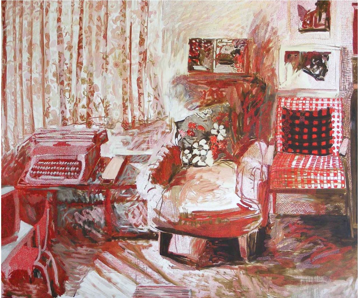
Image 1: Sabadini, Anna, Loungeroom, Looking East , 2010. Oil on canvas, 180 x 215cm.

and ideality or body and language' (Zylinska, 2001: 159,173). As the following discussion will highlight, these relationships are intertwined in the various artistic transformations in both the viewing of, and the creative practice involved in the making of, Anna Sabadini's painting.