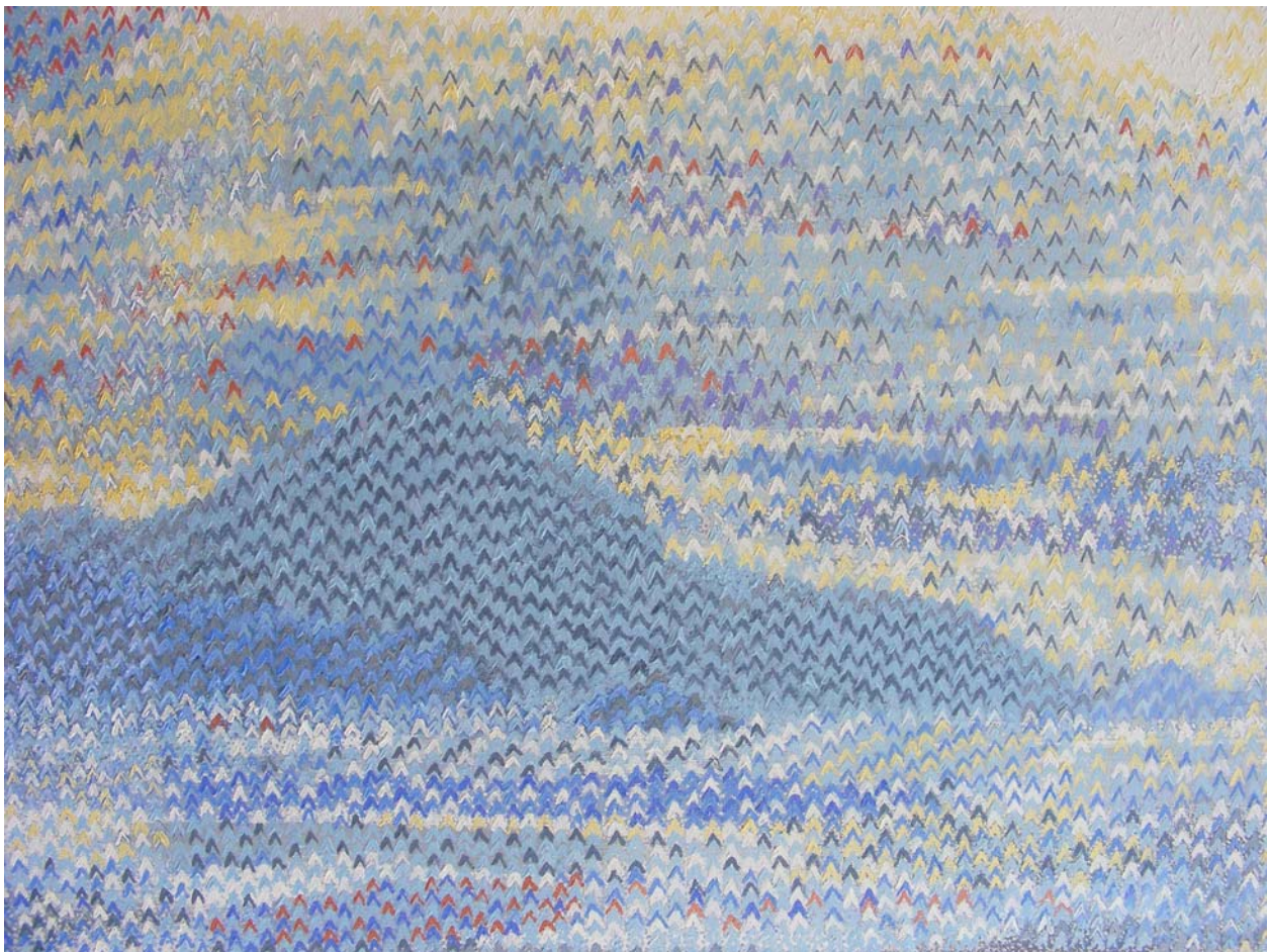
Image 7: Sabadini, Anna, Knitted View East with Crepuscular Light over King George Sound , detail. 2010. Oil on canvas.

When viewing the paintings from a distance, the eyes see rushes of gestural marks that materialize as a recognizable subject. I am not interested in perfectly placed genius marks; in fact I often scrub with the brush, making fallible and panicked attempts to engage with an elusive object. Up close, these sequences dematerialize into patterns of dots or constructed marks deliberately composed as ornamentations for the viewer – arranging them I imagine reactions of surprise and pleasure. There is nothing particularly special about dots, they are ubiquitous and uniform and their effect is dispersing but I like to imbue them with plump materiality, so that the surface bristles with restlessness and a desire to be touched, like a textile. These arranged dots, in my mind, also recall patterns of vegetation in biologically diverse hot-spots such as the Great Southern region of WA. They are a language of biodiversity, maps of desire reflecting maps of vegetation.