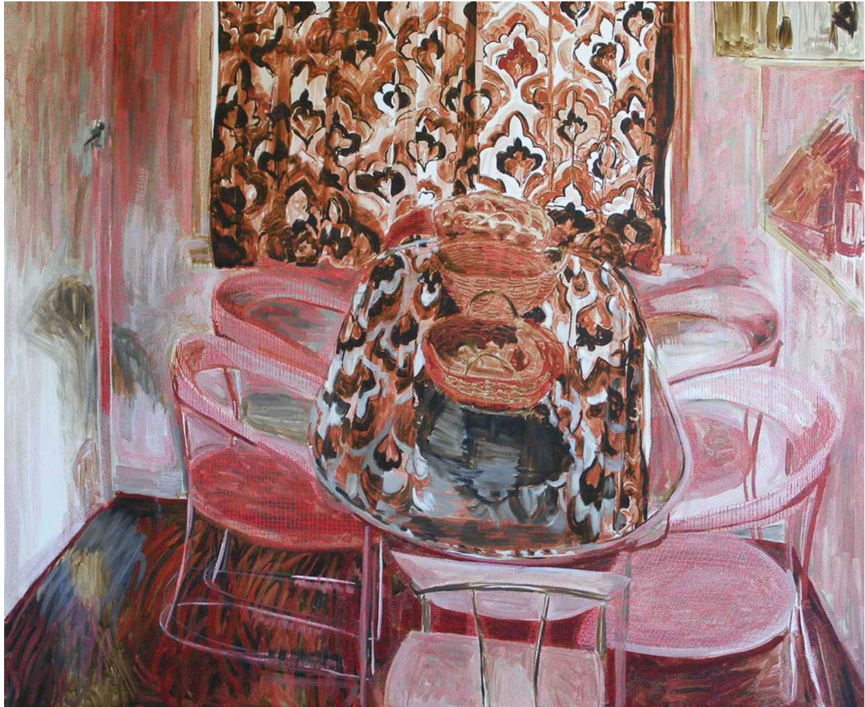
Image 3: Sabadini, Anna, Dining Room, Looking South , 2010. Oil on canvas, 180 x 215cm.

of the eyes as occurs when daydreaming. I am very interested in peripheral vision, in the sense of the world perceived at the edges of vision. When your attention is otherwise taken up, by deep thoughts or daydreaming perhaps, the mind is elsewhere but the retina still takes in the form of the world, distracted, distorted, at the edges. I compose the paintings like this, like peripheral vision: that memory shadow of reality you carry into your intensely subjective concerns. Instead of imposing a centrality of focus on the viewer, I imagine that the paintings operate as backdrops to each viewer's sense of themselves; an invitation to wander into themselves whilst being with the work. This is an additional directionality to that of Renaissance paintings.