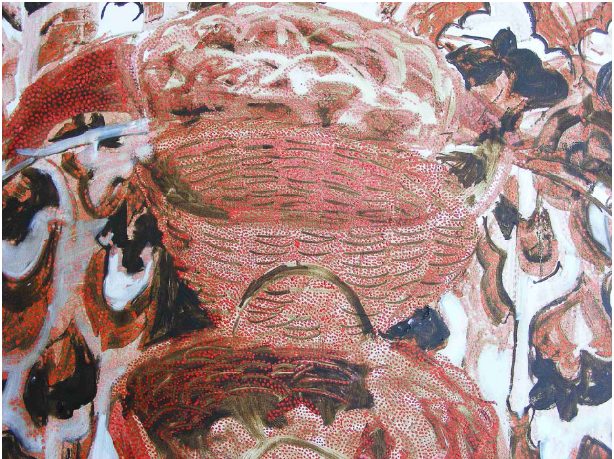
Image 4: Sabadini, Anna, Dining Room, Looking South , detail. 2010. Oil on canvas.

in Anna's paintings, the landscape and the home are foreign and familiar within the same picture plane. For example, in works such as Loungeroom Looking East , Dining Room Looking South and Kitchen Looking West , the main setting is the domestic interior which is, in a patriarchal Eurocentric tradition, the realm of women, a private domain secure in its familiarity. In my looking at these works, I enter into a picture of domesticity, yet one whose intimacy unravels into a localized unknowing. The rhythm of pots and pans, the pattern of motifs, the repetitive weave of baskets, all shift the pulse of my viewing. I am invited into the murmurs of daily life and lulled into complicity with its sensuous pulsations. As the scene embraces me, I sense a familiarity that flickers with reverence. This is home. But once I am taken within the comfort of its subtle vibrations things start to go askance. I have lost a singular focus and orientation. The decorative flourishes of ordinary life envelop me and disperse my vision.