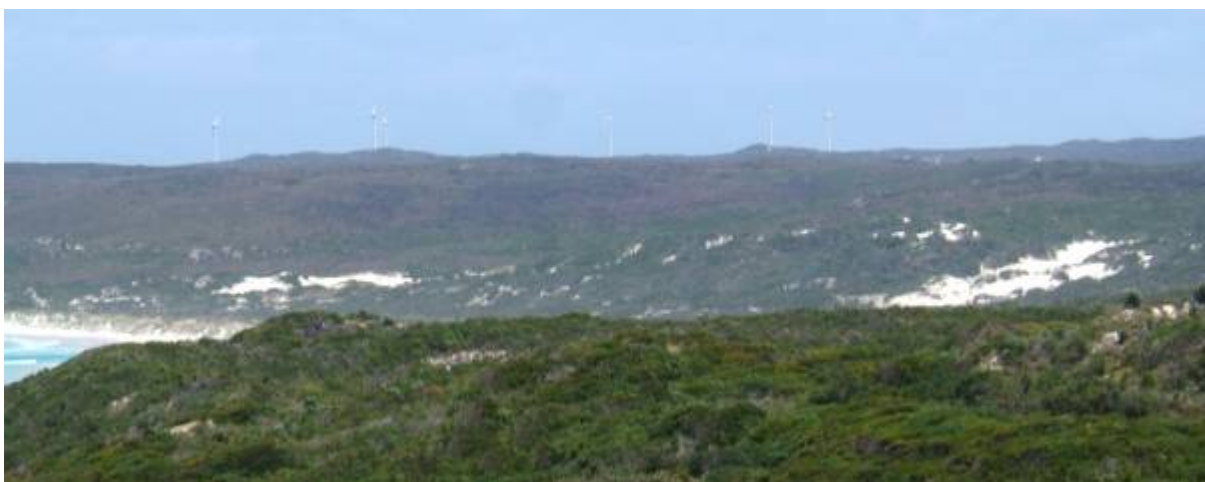
Ten Mile Lagoon Wind Farm