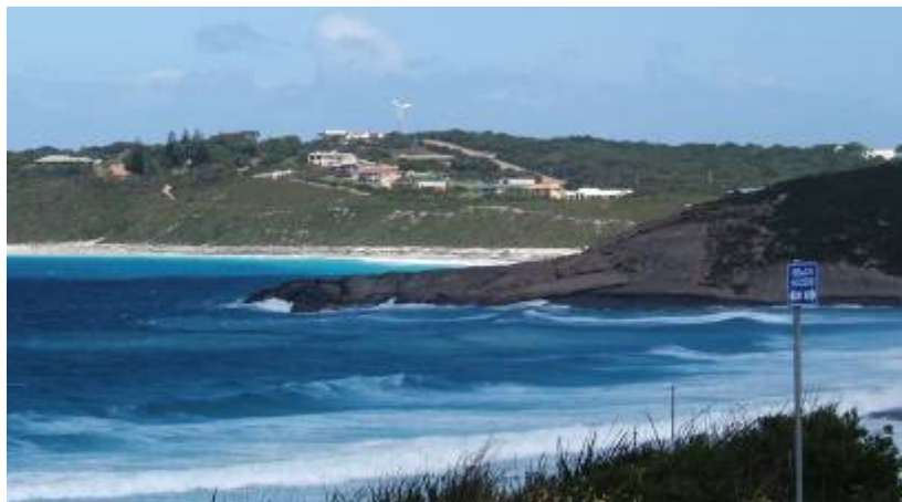
Salmon Beach Wind Farm