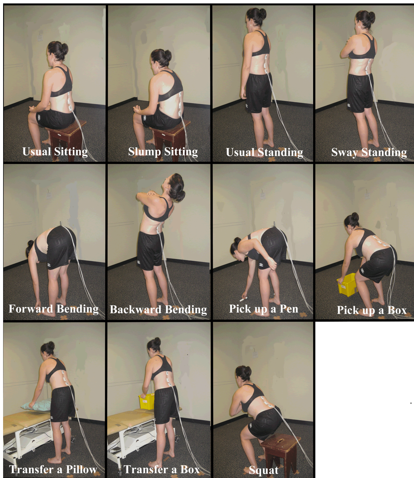
Figure 1 Test postures.