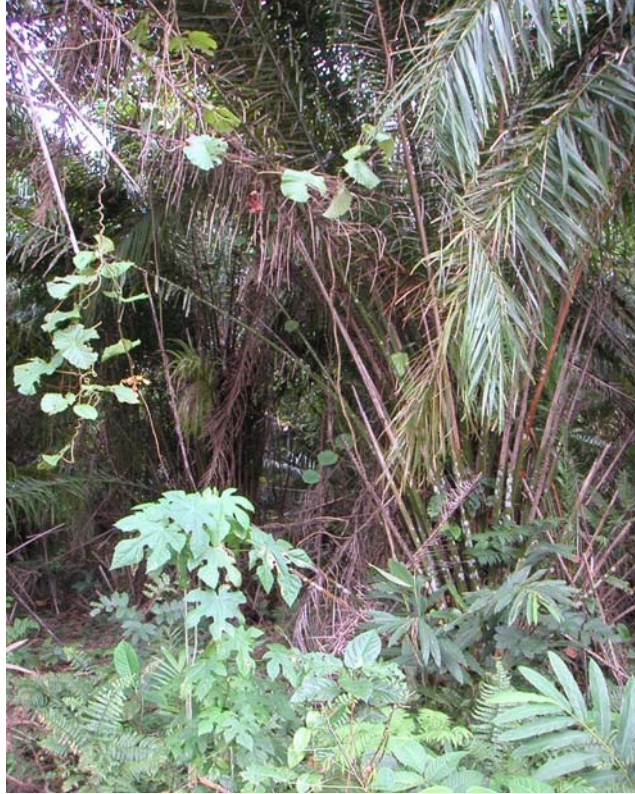
Plate 2a. A semi-abandoned LSS block in Kapore subdivision.