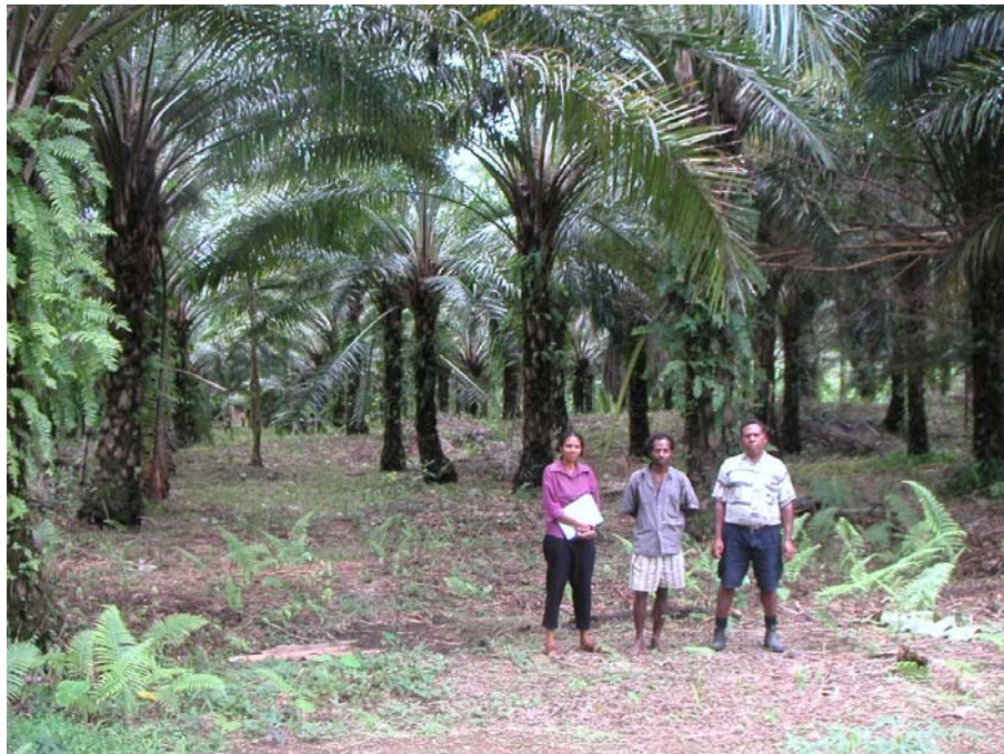
Plate 1b. The same Siki block cleared by Mobile Card worker.