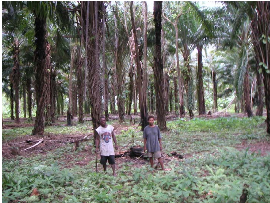
Plate 2b. The same Kapore block cleared by a Mobile Card husband and wife team.