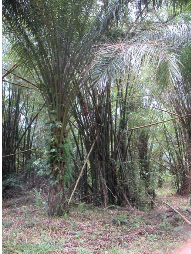
Plate 1a. Area of overgrown LSS block in Siki subdivision prior to deployment of Mobile Card labour.