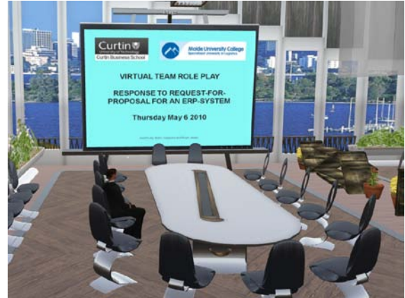
Figure 2. The executive meeting room used at the Kamimo virtual campus in Second Life

The manuscript describes a separate meeting between business executives in a purchasing firm and the senior sales executives from three the vendors SAP, Microsoft and SAP ByDesign. Typically, this type of meeting is held in a high-end executive meeting room since buying an ERP system often is the single largest investment a company does with a time horizon of ten to twenty years. As shown in Figure 2, an executive meeting room was created in Second Life to make the role play realistic.