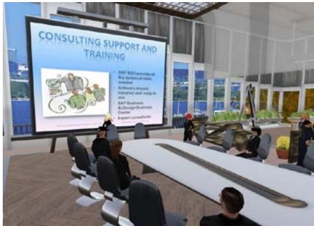
Figure 4. Snap-shot of from the presentation by the sales team from SAP Business ByDesign

role play more realistic. Doing the role play in Second Life was voluntary. The ones who did not participate had to do the role play in a classroom. All 22 students in Molde volunteered for Second Life while 6 of 24 students in Perth joined giving a total of 28 students. The students in Perth formed two sales teams. The rest of the teams were in Molde. Figure 4 shows the sales team from SAP Business ByDesign presenting in Second Life virtual environment to the students. Note how the virtual teams can present slides in Second Life just as they would in a real world presentation. The support in second life for private voice and/or chat is useful when someone wants to communicate without disturbing an ongoing presentation. We found this a particularly useful feature for teachers from Norway and Australia which observed the role play via their avatars, since we could coordinate activities without interfering with the student activities. This is impossible with other technologies like video conferencing or in real life.