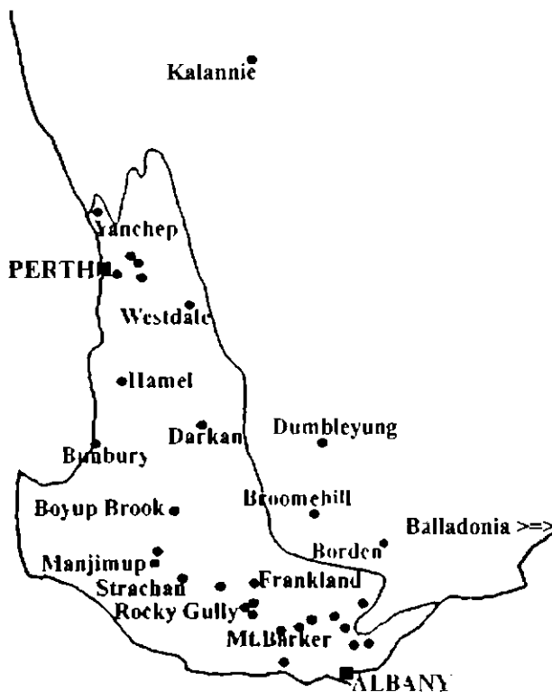
Figure 1. Sites from which Cadmus excrementarius (•) has been collected in Western Australia. The thick line shows the boundary of the jarrah forest region (after Dell & Havel 1989).

Morphological and behavioural aspects of each biological phase were noted, both under field conditions at Rocky Gully and in the glasshouse at Curtin University, Perth. Larvae were maintained in the glasshouse in an 80x40x40 cm glass tank filled with sandy soil, jarrah litter, and blue gum seedlings. Larvae collected from the field in April and June were also reared in petri dishes; they received fresh leaves three times a week. Field observations on larvae and observations on adult feeding, mating, oviposition and natural enemies were carried out throughout 2001. From 2-4 March 2001, ten wooden plates (10x10 cm) were placed on the ground at 10 m intervals inside both the Rocky Gully blue gum plantation and jarrah forest. Twenty egg scatoshells (eggs encased in faecal material) were then placed on each plate for 48 hours to observe predators. Plates were inspected every 2-3 hours during both day and the evening, and predators were collected.