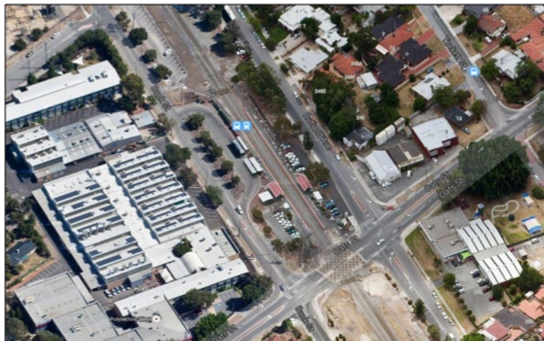
FIGURE 6. Aerial photograph of Oats Street train station showing surrounding land uses