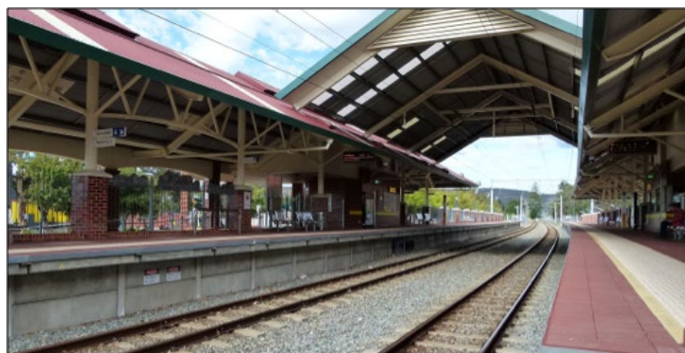
FIGURE 3. Gosnells train station