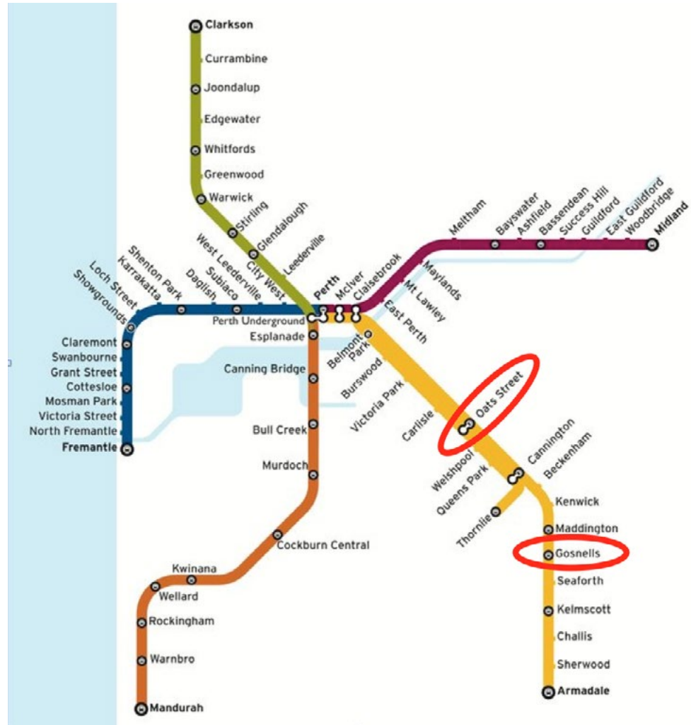
FIGURE 2. Perth's rail network showing Oats Street and Gosnells