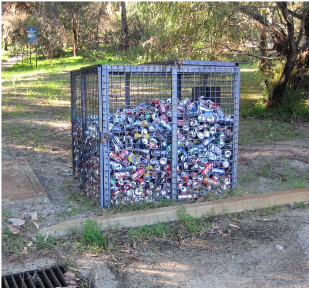
[9] Aluminium can recycling collection, Perth, Western Australia, 2007.

Domestic recycling in Australian increased in the 1980s and 1990s after the introduction of kerbside recycling schemes. Government involvement was through the Australian and New Zealand Environment Conservation Council (ANZECC), which operated between 1991 and 2001 to develop policies on environmental and conservation issues. 83 In 1999 ANZECC set up the National Packaging Covenant as a National Environment Protection Measure (NEPM). In 2001, these recycling initiatives were transferred to the Environment Protection and Heritage Council (EPHC). 84 By 2002, 63% of aluminium cans were recycled in Australia. 85 [9]