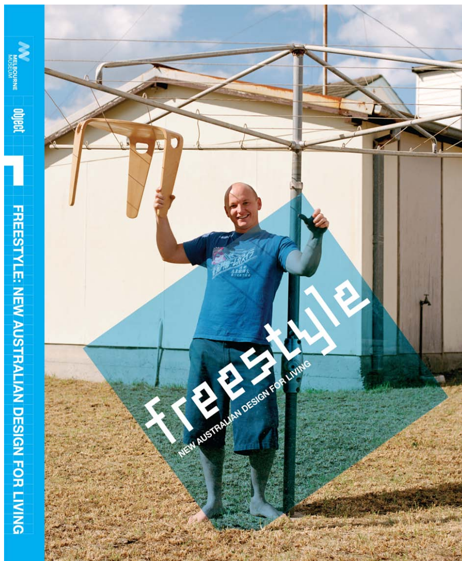
[8] Cover of 'Freestyle' catalogue. Published with permission from Object, from Brian Parkes (ed.), 2006, Freestyle: New Australian Design for Living , Sydney: Object: Australian Centre for Craft and Design & Melbourne: Melbourne Museum. Cover art designed by Frost Design, Sydney.

The other two exhibitions, 'Freestyle' and 'Smart works' held in 2006 and 2007, included makers who experimented with aluminium. These exhibitions made reference in curatorial narratives to globalisation and national identity, but they did not make associations with a sense of place and a specific locality, that were evident in the 'Vast Terrain' exhibition.