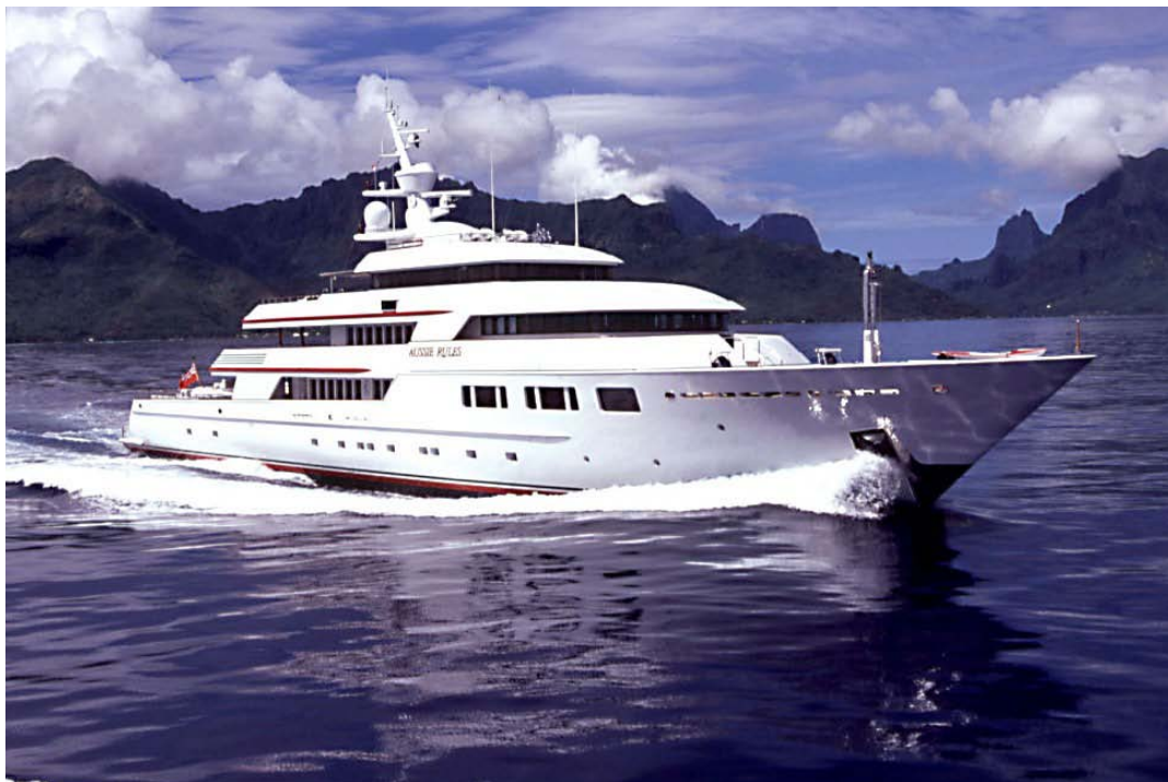
[3] MY 'Aussie Rules' luxury motor yacht, built by Austal, Henderson, Western Australia, 2002. (Oceanfast) MY Aussie Rules, Picture courtesy of Oceanfast.