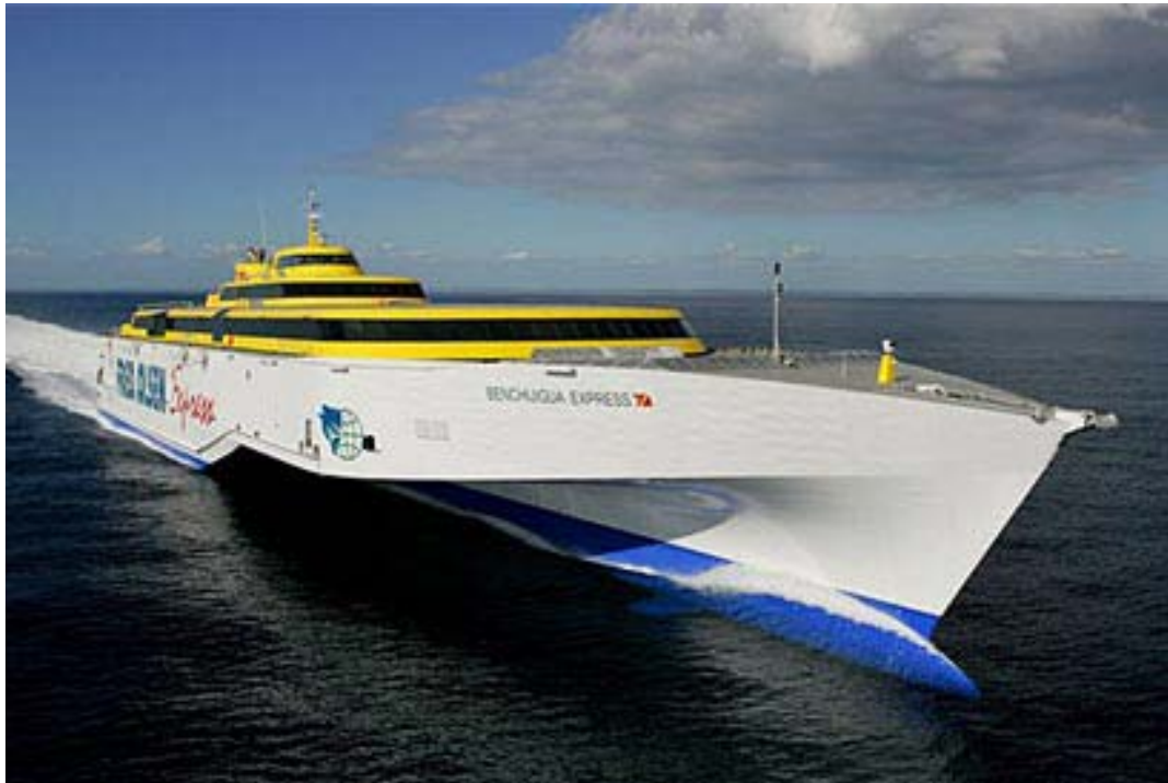
[2] The 'Benchijigua Express' Trimaran built by Austal, Henderson, Western Australia, 2005.

with Sam Sorgiovanni and Design Works [3]. 51 These were notable achievements in a specialist international market.