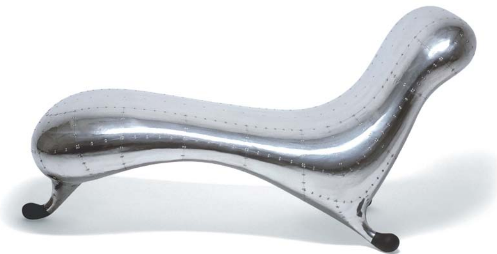
[1] Lockheed Lounge chair, designed by Marc Newson and launched in 1986. Reproduced with permission from Marc Newson Ltd.

From the beginning of the 20th century the uses of aluminium for the domestic market were first appreciated for the metals functionality in cookware and then in fashionable household objects. 36 Diversification within the aluminium industry after the Second World War led to its promotion for the manufacture of consumer goods, thereby extending its use in manufacture. It is still being 'reinvented' for innovative use in both familiar and new contexts. A recent example for the automobile industry is the collaboration between Alcoa (USA) and Audi, with the Audi A2 launched in 1999. The aim of this collaboration was to produce a lighter, more fuel efficient car that was therefore considered more environmentally friendly. 37