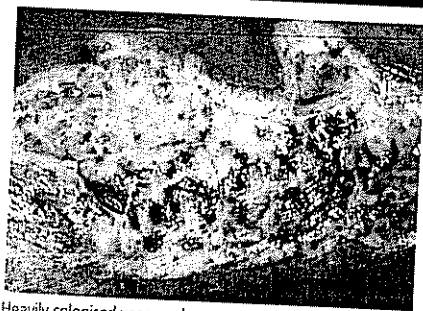
Heavily colonised venous ulcer covered with fibrous coatings