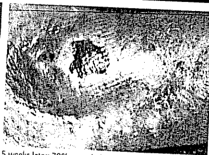
5 weeks later: 70% granulation tissue