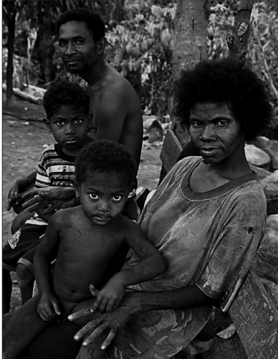
Figure 2. An Aeta Magbukún family from Bataan, near Mariveles, Bataan.