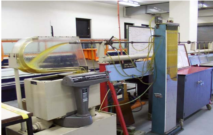
Fig. 1. Laboratory equipment of flow through pipe

The experimental rig is physically very large, and there is insufficient space within the laboratory to simply build multiple identical copies to address the student demand. This is one of the motivations for the consideration of remote access alternatives, provided the experiment proves suitable for conversion.