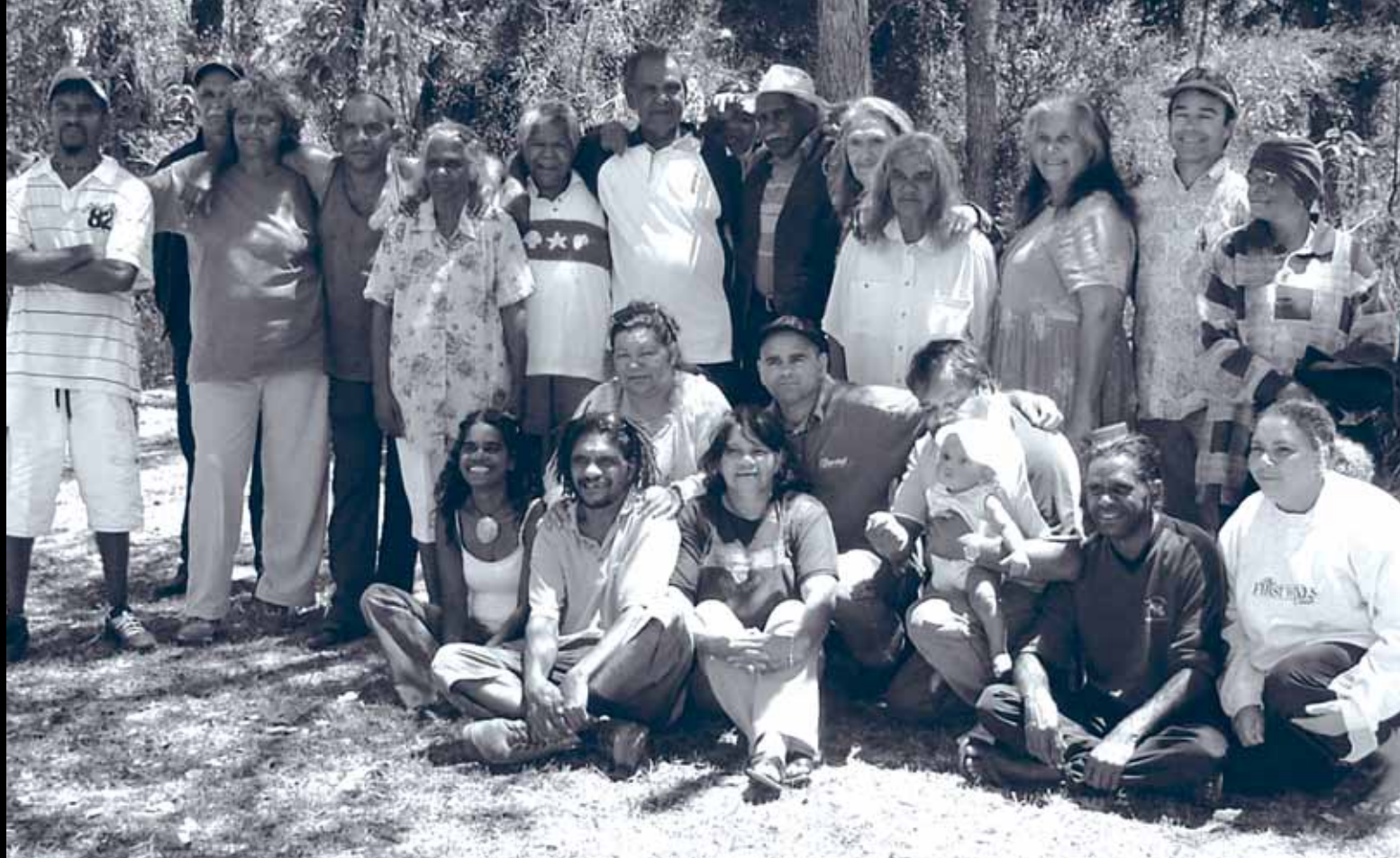
Family members and elders present at the first workshop held in Albany, January 2007.