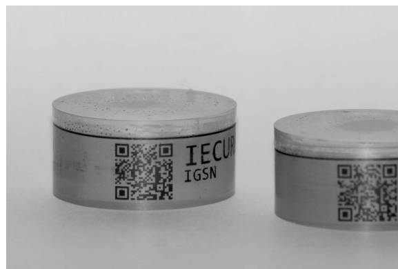
Figure 2: Mineral mounts with embedded QR codes

150 samples were received from the GSWA as bags of mineral grains and prepared in the JdLC as "mounts". Each mount contains tens of thousands of microscopic mineral grains, embedded in an epoxy resin disc, complete with a slip of acid-free paper displaying the IGSN and a QR code,