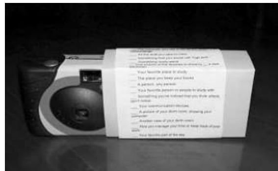
Figure 4. A mapping diary (top) produced by a student and the camera sent to research participants (bottom) to photograph their world. Both generated rich insights into student life and the role of the campus library at the University of Rochester.