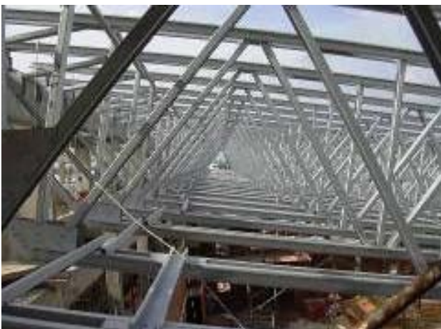
Figure 1: Trinity Methodist Church, Kuching

Current practice to increase the load bearing capacity of a cold-formed steel structure stretching over a vast span is to use built-up section of lipped channels. This section could be either back-to-back or boxed-up. This section is widely used in local projects namely the Trinity Methodist Church, Kuching (Figure 1), the Curtin University of Technology, Miri (Figure 2), the Sarawak International Medical Centre, SIMC, Kota Samarahan (Figure 3) and a food court in Miri (Figure 4) (Mei et al, [1, 2]).