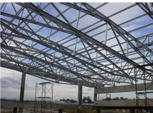
Figure 3: SIMC, Kota Samarahan