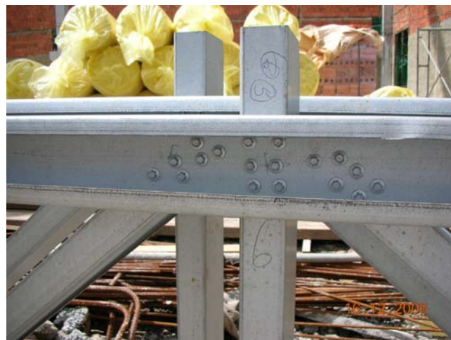
Figure 7: Connections