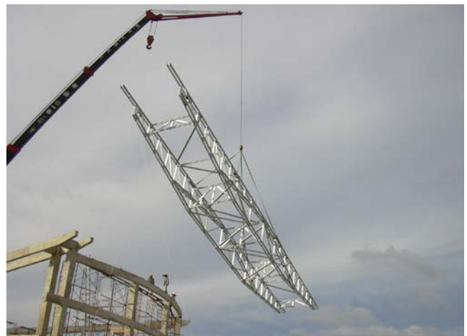
Figure 6: Lifting of truss