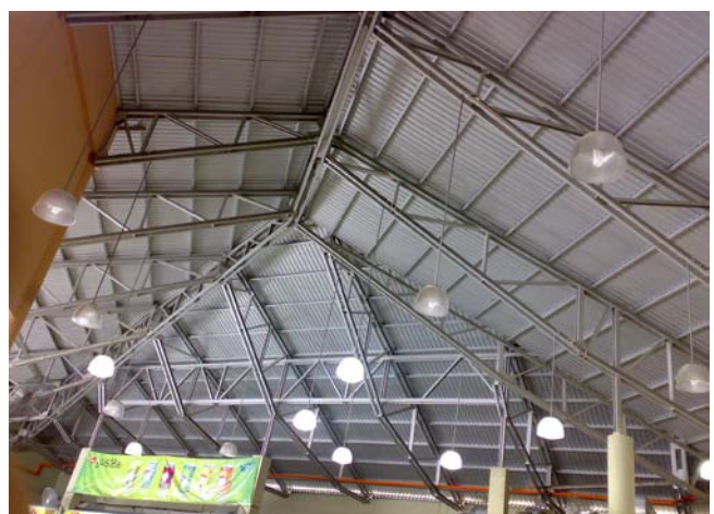
Figure 4: Food Court, Miri