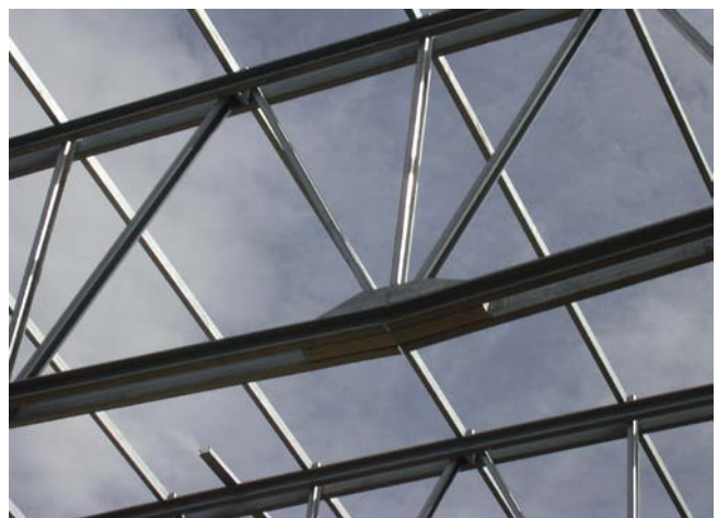
Figure 2: Curtin University of Technology, Miri