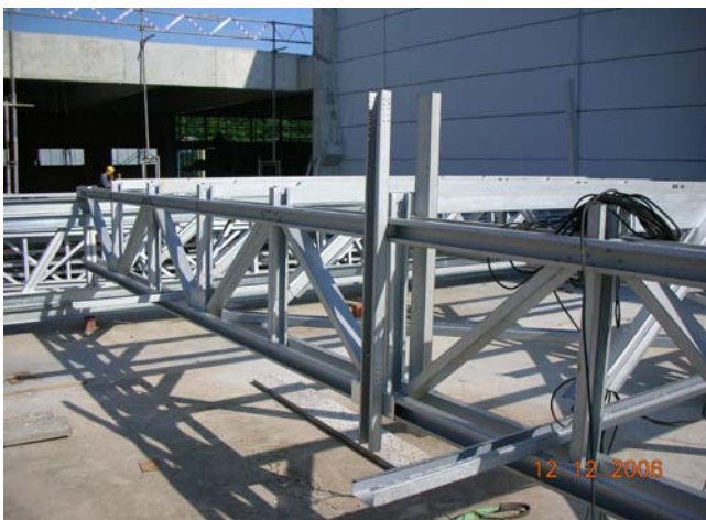
Figure 5: Top and bottom chords built-up sections

Instead of increasing the depth of the truss or using bigger sections, built-up section was adopted. This may be due to space limitation in the design and practicality in construction. This approach utilizes two lipped channels placed back-to-back at the top and bottom chords of a truss as shown in Figure 5. These channels are spaced apart to receive the web members which act as lacing on the structure forming a gap. This configuration is adopted in the design as it will improve lateral stiffness making handling especially lifting for installation becomes easier as seen in Figure 6. Besides that, it also simplifies the connection detailing of the web members to the chord members. The use of gusset plates is eliminated. Figure 7 shows the connections of the web members to the top chord.