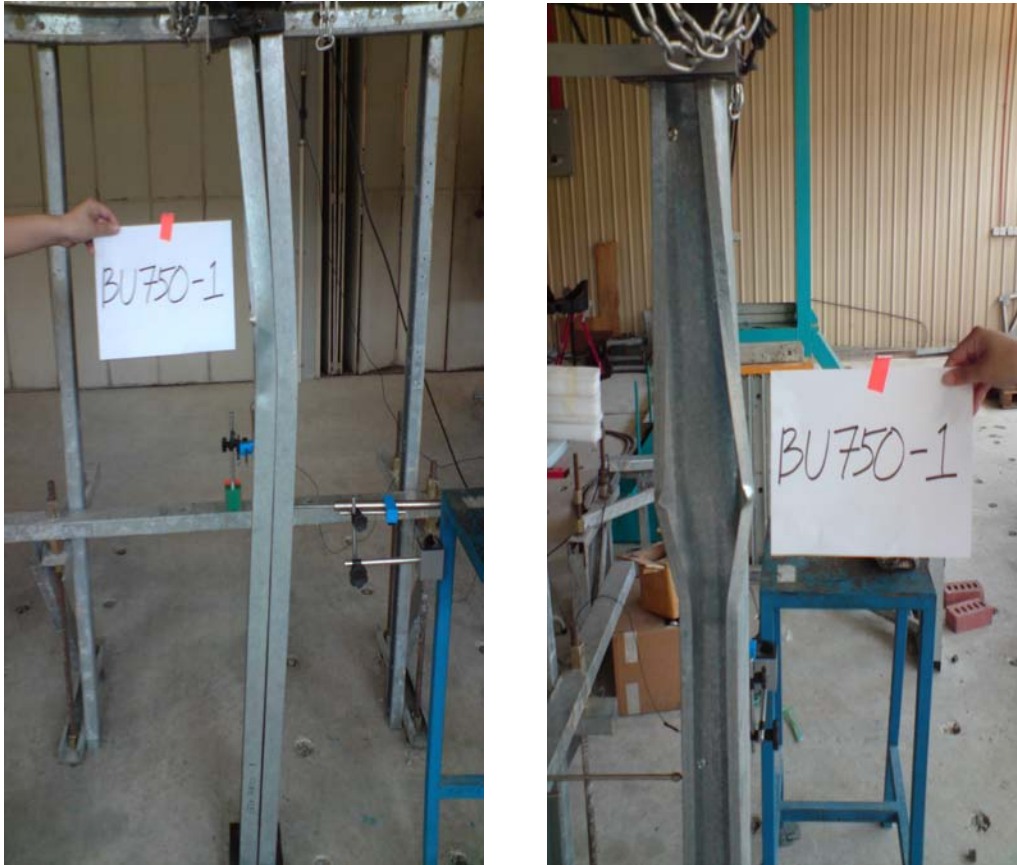
Figure 8: Buckling mode of column