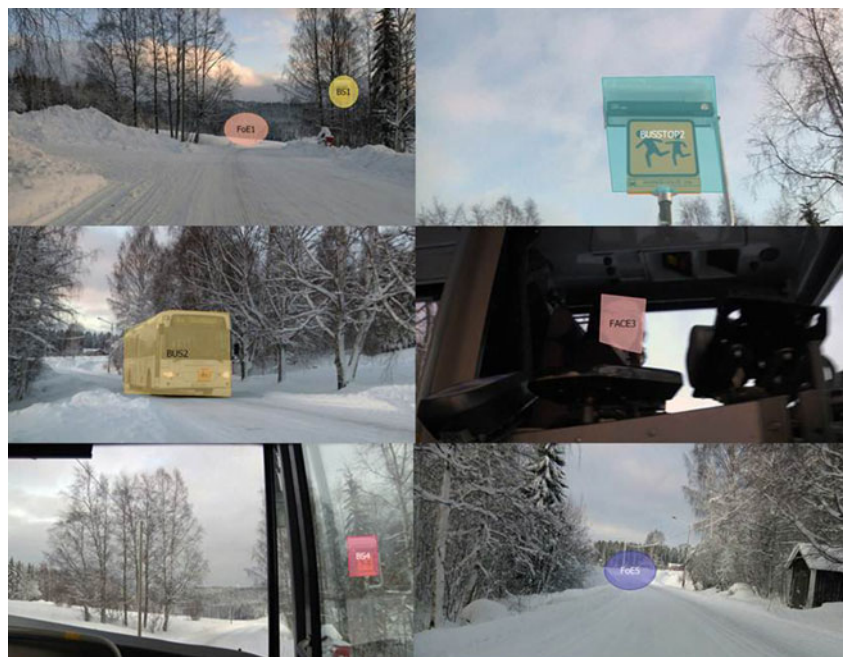
Fig. 1 The five video scenarios (scenario 2, Wait at the bus stop, is represented by the upper right hand slide and the middle left hand slide ) and their relevant areas of interest (AOIs)

Data were analysed using SPSS 20 (SPSS Inc.). The Kolmogorov–Smirnov test was used to test the data for normal distribution, which was only found for the responses to the 50 statements in relation to the five scenarios and regarding the participants' age. These data were analysed with independent samples t-tests.