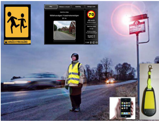
Fig 2 The SAFEWAY2SCHOOL system. The relevant parts for the present study were the flashing “Intelligent bus stop”, the radio transmitter that the children carry as their “bus ticket”, the special yellow signage on the school buses (similar in the video but not identical), the mobile phone which can receive live SMS updates, and the “On-board computer” carrying all the relevant information about every child boarding and alighting the bus

The remaining questionnaire, background information and eye tracking data were analysed using Mann–Whitney U-tests for group comparisons and \chi^2 -tests/Fisher’s exact tests to analyse categorical data. In all analyses, the \alpha -level was set to .05, with the level adjusted by Bonferroni correction where applicable. To estimate the clinical relevance of the findings, Cohen’s effect size (Cohen’s d ) [18] was used for parametric outcomes (large effect \geq 0.8 ) and r [19] for non-parametric outcomes (large effect \geq 0.5 ). Based on the 14 participants in the smaller group (CWD), a power of 80 % ( \beta=0.2 ) was provided by the sample size to detect a standardised difference (Cohen’s d ) between the CWD and the Con groups of 1.3 given the \alpha -value of .05.