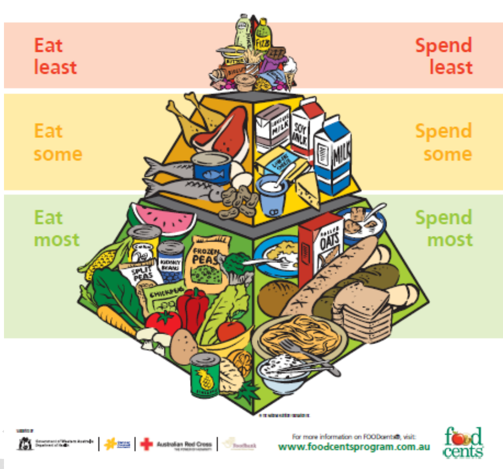
Figure 1. The Healthy Eating Pyramid<sup>16</sup>