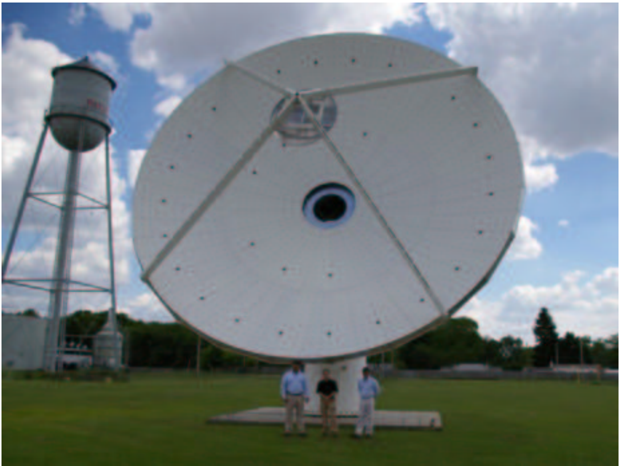
Figure 2: A Patriot 12 m antenna similar to that which has been ordered for installation at Hobart.