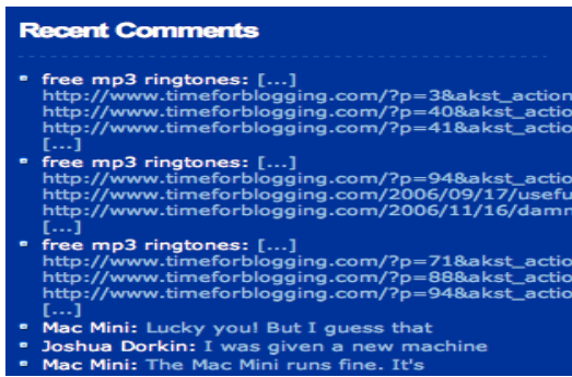
Figure 2. Example of spam 2.0 in comment system