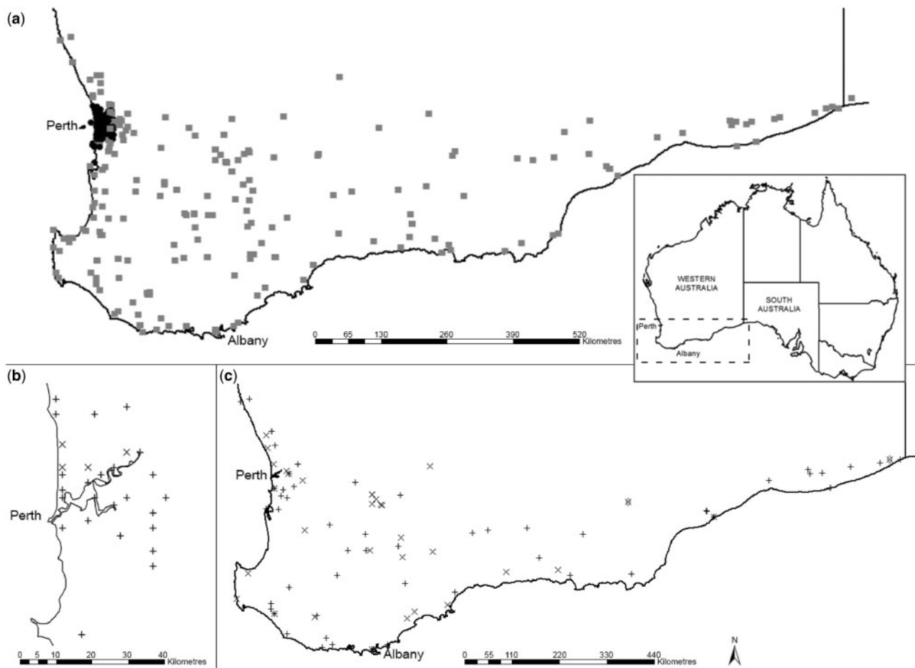
Figure 1. Collection locations of dugite P. affinis specimens used for this study: a) urban specimens (around the Perth metropolitan area where human population density exceeded 500 persons·km 2 at the time of the nearest Australian Bureau of Statistics census) are indicated by black dots, non-urban specimens are shown with grey squares; distribution of dugites containing prey in gut contents for b) urban and c) non-urban specimens. Legend: cross—non-native rodents; diamond—native rodents; plus—reptiles. Study location with reference to the wider Australian continent is shown in center right.

where there have been local prey extinctions recorded as a result of predation pressure (Savidge 1988). By contrast, P. sebae in suburban areas in Nigeria supplement their diet with synanthropic rats and domesticated poultry, but are significantly smaller than conspecifics from non-urban environments: the authors did not suggest any reason for this difference (Luiselli et al. 2001). In the present study, we investigate the effect of urbanization on the feeding ecology of the dugite Pseudonaja affinis , Elapidae (Günther 1872). This species is one of the most common snakes of south-west Western Australia, thriving in woodlands, heaths, and urban environments (Chapman and Dell 1985), possibly via supplementation from the spread of the invasive house mouse Mus musculus (Shine 1989). Although the house mouse is a small species, it is larger than the majority of urban lizards in Western Australia (How and Dell 2000), and its communal nesting and prolific breeding (e.g., Gomez et al. 2008; Vadell et al. 2010) appears to provide dugites with frequent opportunities to eat multiple individuals (and therefore larger meals). Dugites are regarded as one of the best urban-adapted large-bodied reptiles in Australia (How and Dell 1993), which makes them ideal model animals for urban/non-urban comparisons. Assuming dugites benefit from the presence of synanthropic rodents, then we make the