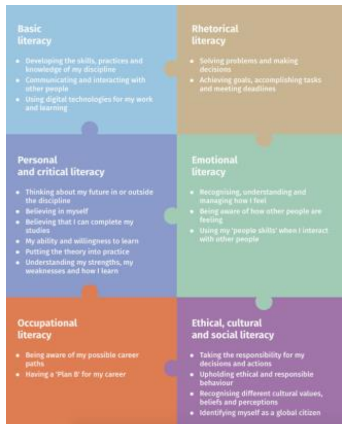
Figure 1: Student (plain English) version of the Literacies for Life (L4) model

The measure underpins a metacognitive model of employability in which employability is defined as “the ability to create and sustain meaningful work across the career lifespan” (Bennett, 2016). The model’s six inter-related Literacies for Life combine to enhance employability and inform personal and professional development. The student version, illustrated at Figure 1, was shared with students as part of their profile and workshop.